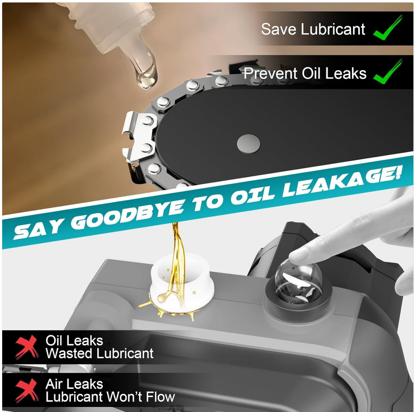
Image: A visual representation of the Gisam mini chainsaw's no-leak oil control system, showing how lubricant is applied precisely to the chain and the benefits of preventing oil leaks and wasted lubricant.