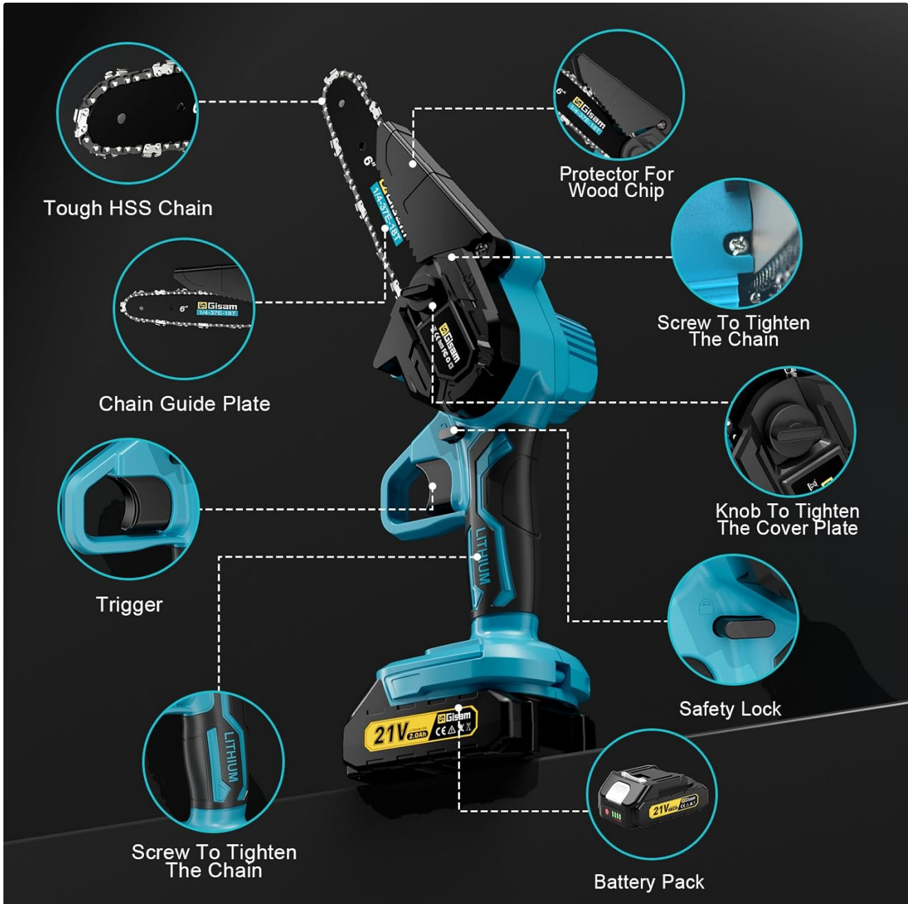
Image: An exploded view diagram of the Gisam mini chainsaw, clearly labeling key components such as the trigger, safety lock, battery pack, chain guide plate, tough HSS chain, protector for wood chip, screw to tighten the chain, and knob to tighten the cover plate.

Familiarize yourself with the components of your Gisam DL06 Mini Chainsaw before operation.