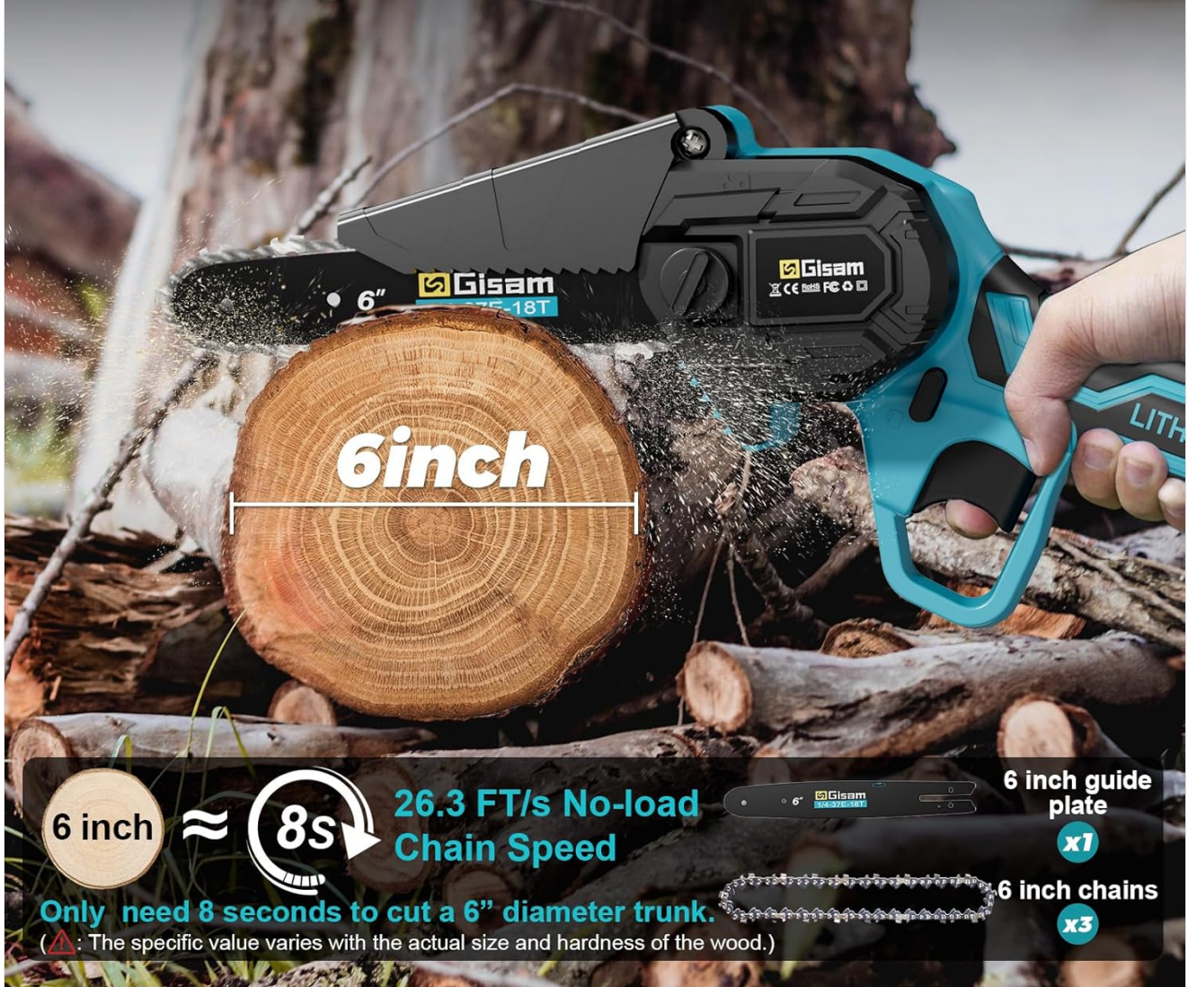
Image: A detailed view of the Gisam mini chainsaw's 6-inch integrated guide plate and the deep-quenched manganese steel chain, highlighting its sturdy construction, efficient cutting, and sharp, wear-resistant properties.

More Cutting Times & Lower Effort Needed