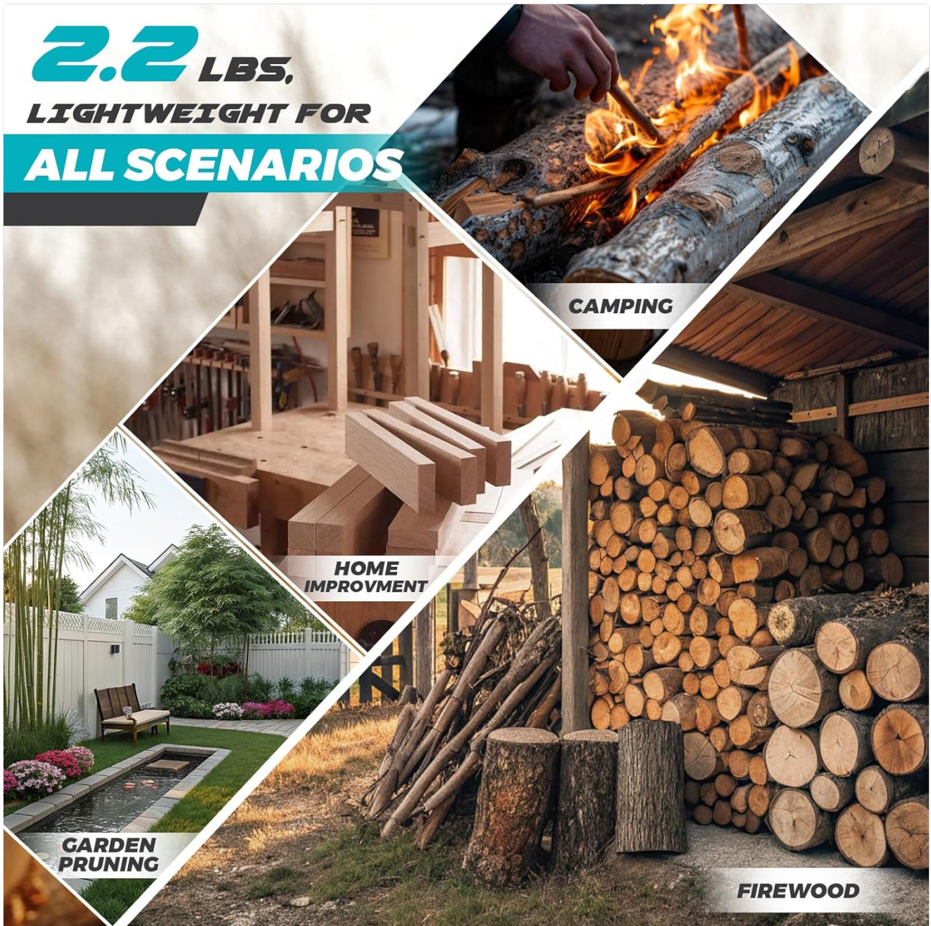
Image: A collage depicting the Gisam mini chainsaw being used in various scenarios, including garden pruning, home improvement tasks, cutting wood for camping, and preparing firewood, emphasizing its lightweight and versatile nature.