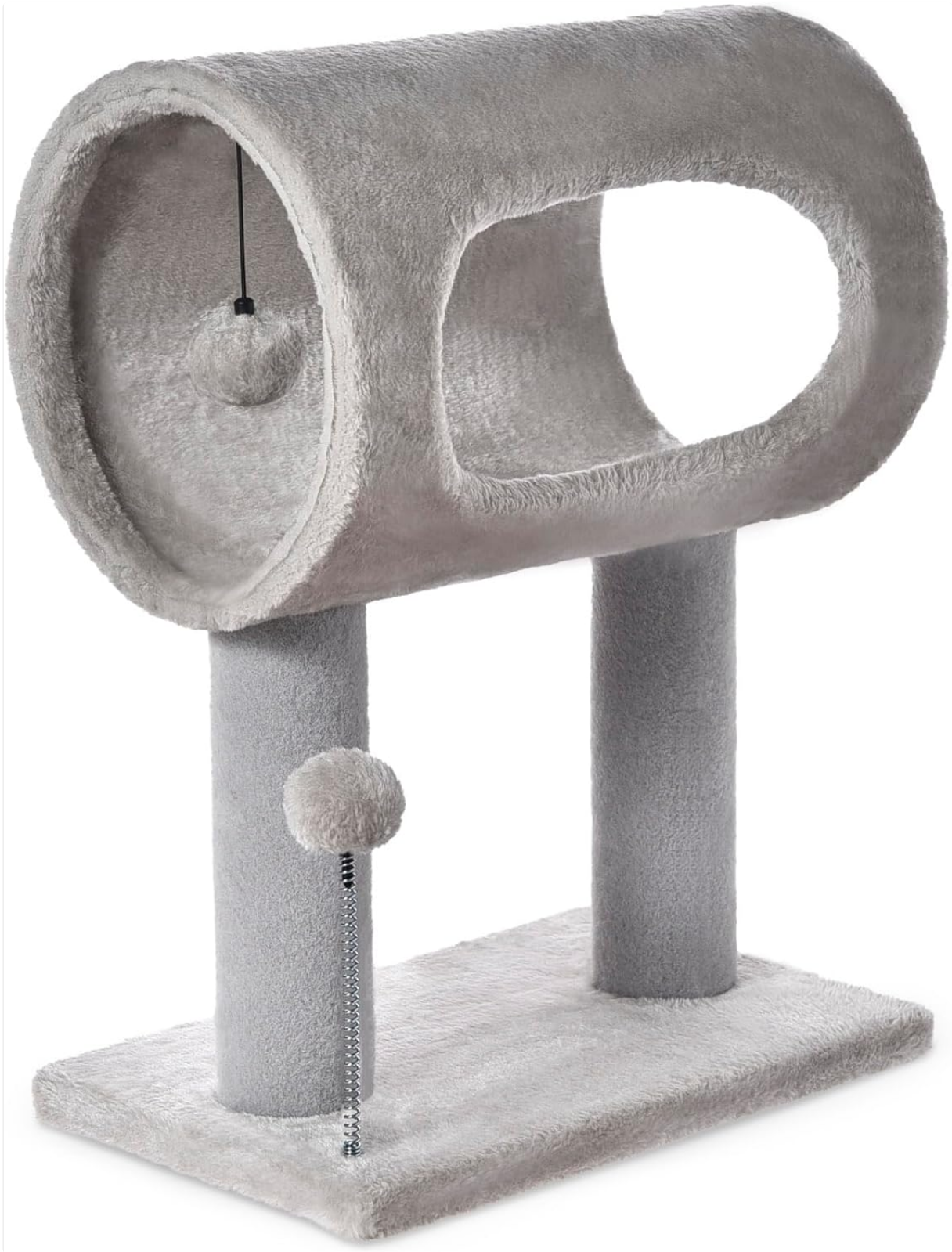
Image 3.1: Front view of the assembled Cat Craft Cat Tree, illustrating its components.