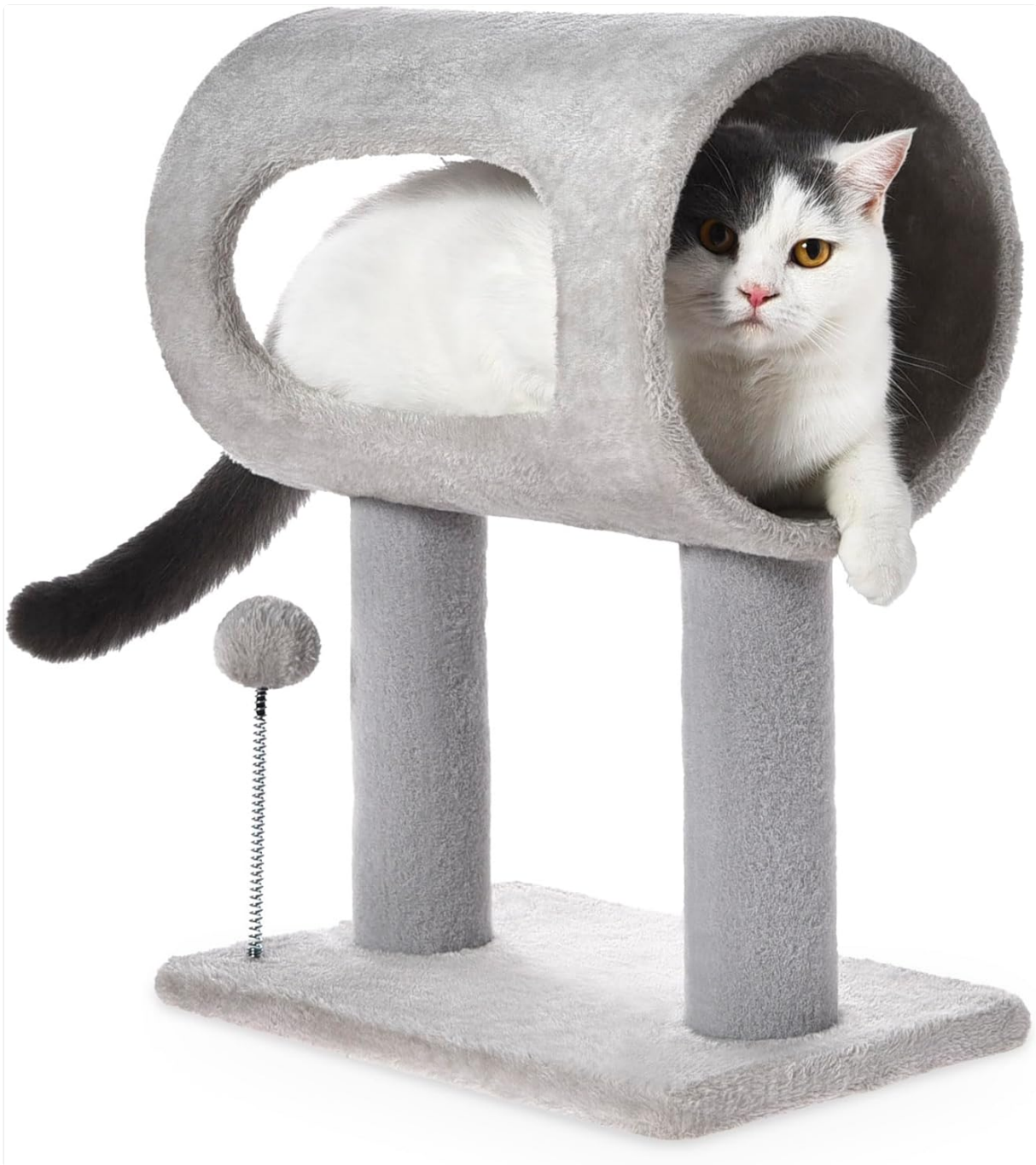
Image 1.1: Cat Craft 20.5-inch Cat Tree with Tunnel, featuring a cat resting inside.