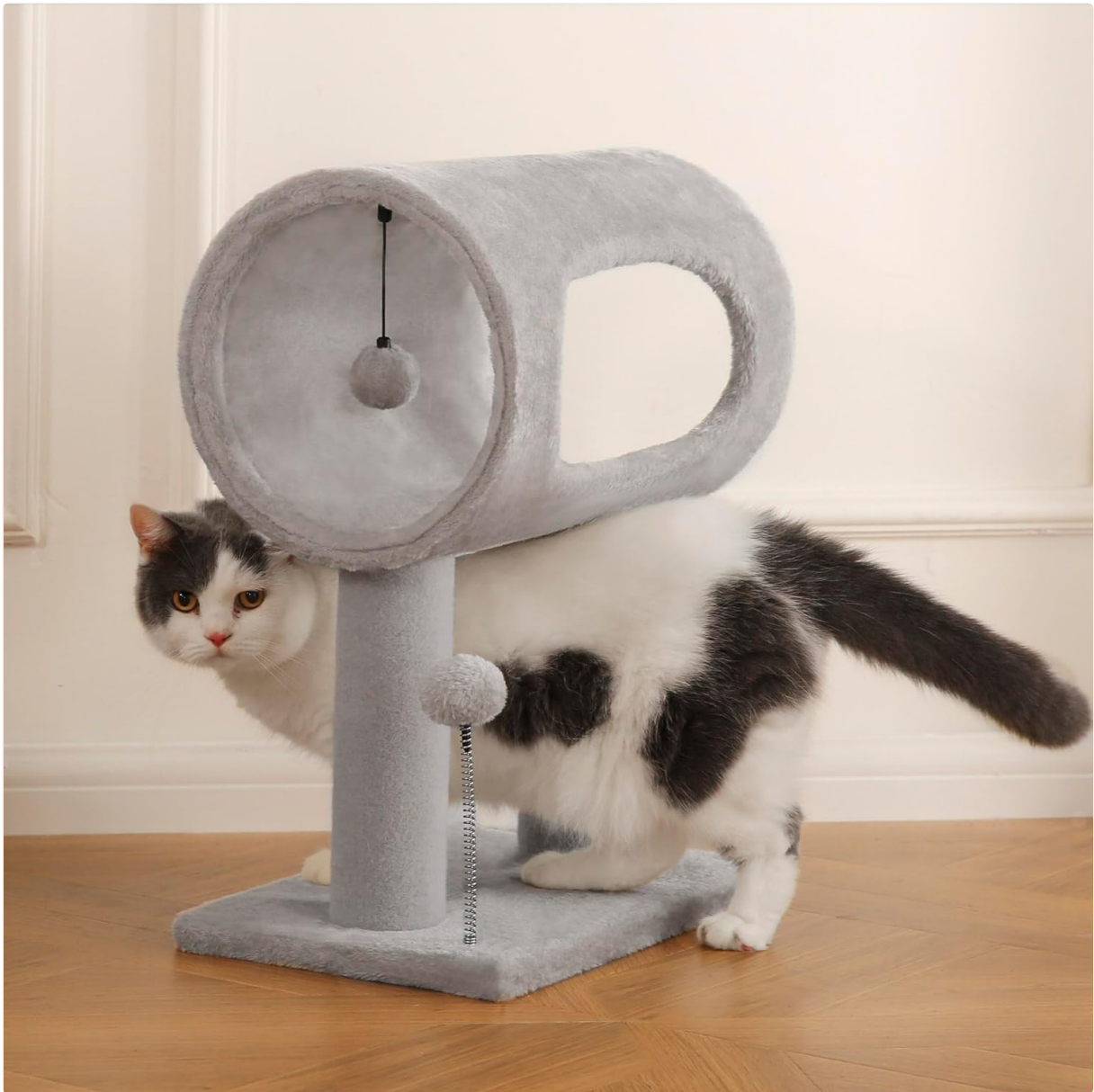
Image 5.1: Cat engaging with the scratching post and spring-loaded toy.