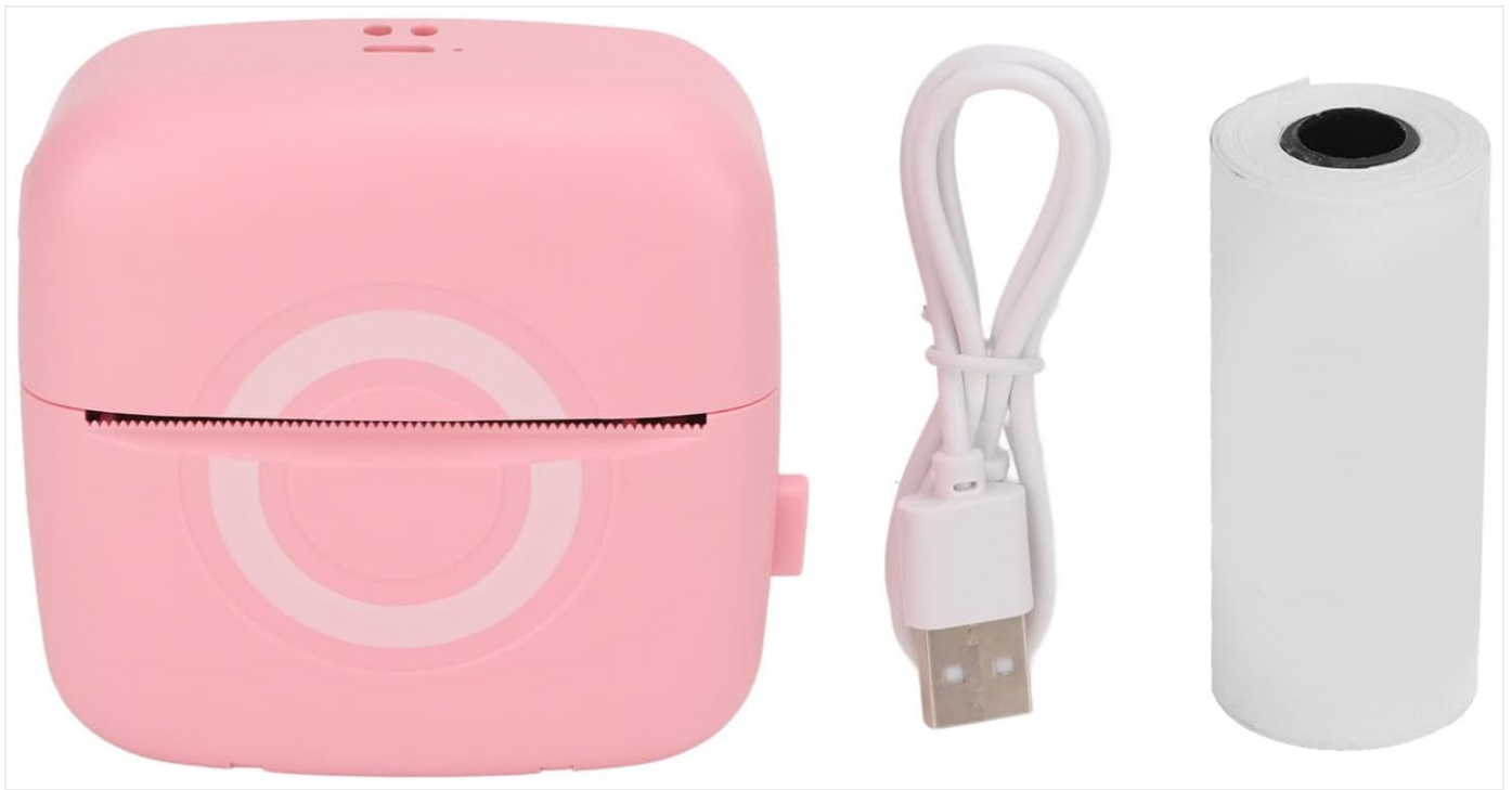
Figure 2.1: Contents of the Yosoo Mini Thermal Printer package, including the printer, USB cable, and a roll of thermal paper.