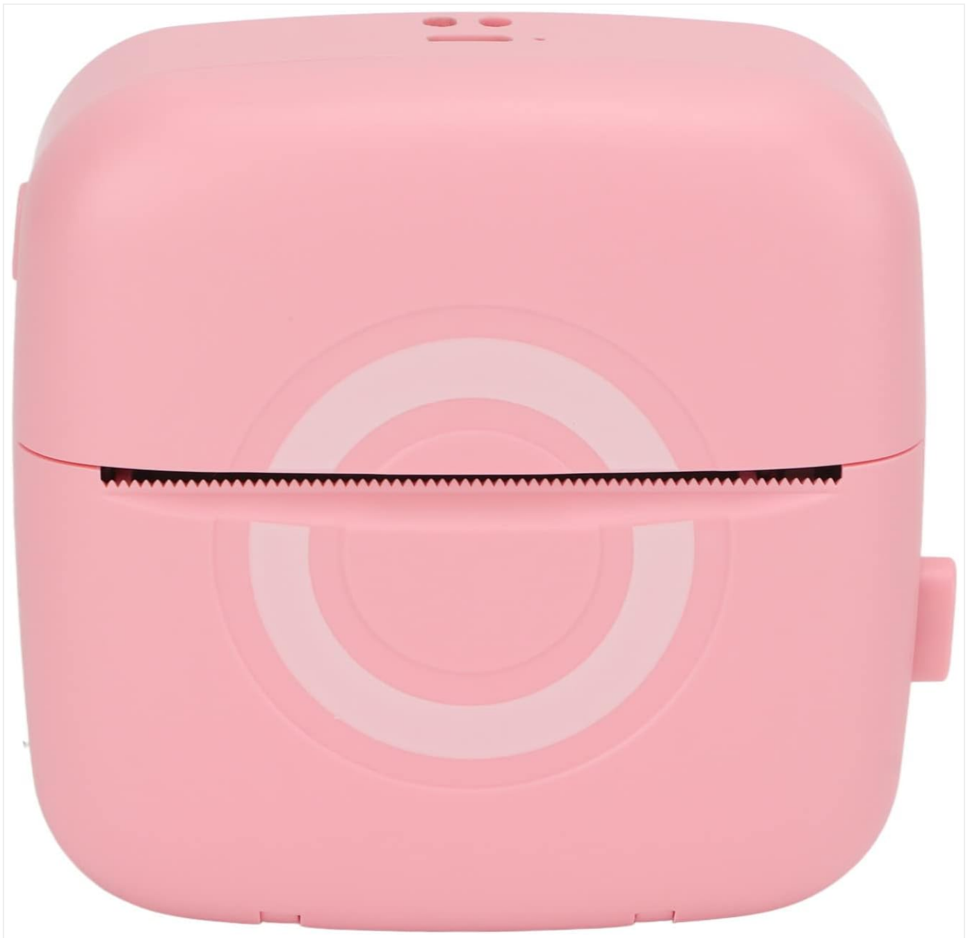
Figure 1.1: Front view of the Yosoo Mini Thermal Printer, showcasing its compact pink design.