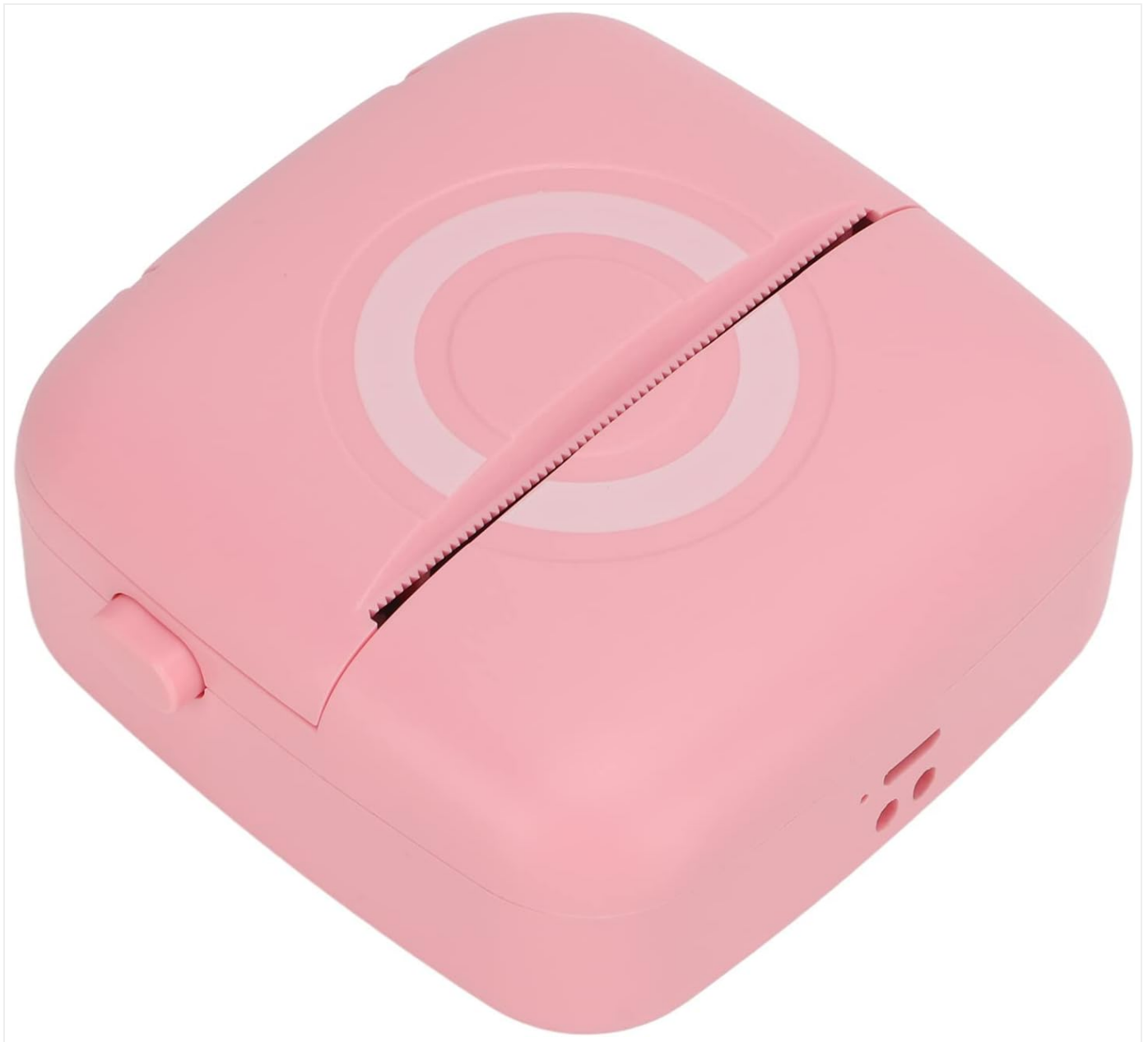
Figure 5.1: Top view of the printer, highlighting the paper exit slot where printed content emerges.

The printer supports "one-click printing" for quick and effortless output of various documents and images.