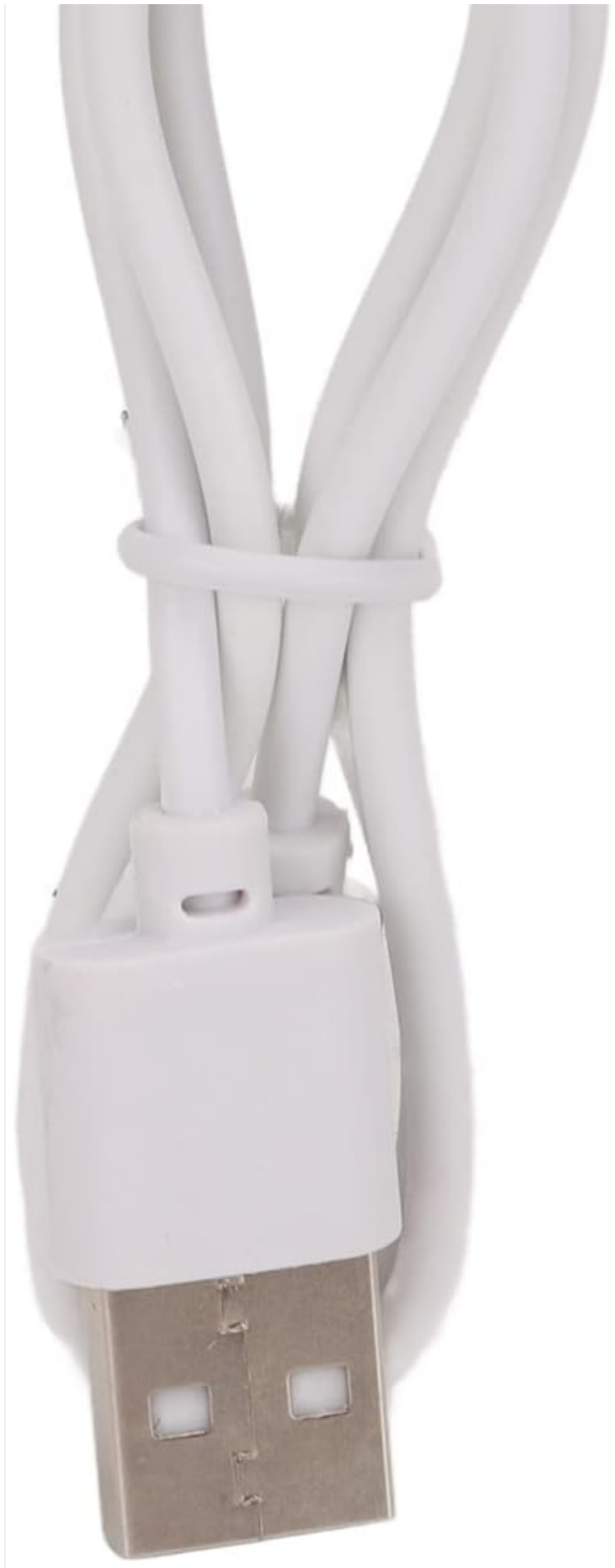
Figure 4.1: Close-up of the USB charging cable provided with the printer.