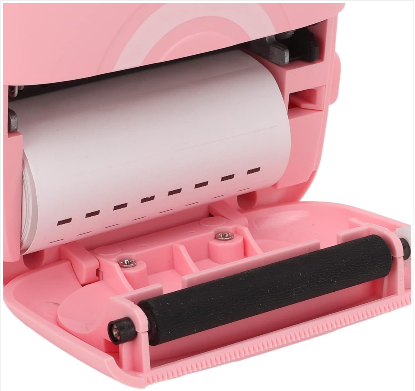
Figure 4.2: The printer with its paper compartment open, illustrating how to insert a new thermal paper roll.