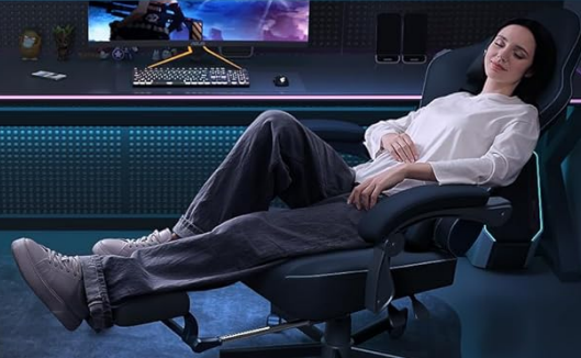
Figure 5.1: Adjustable Recline Positions for Gaming, Watching, and Rest.