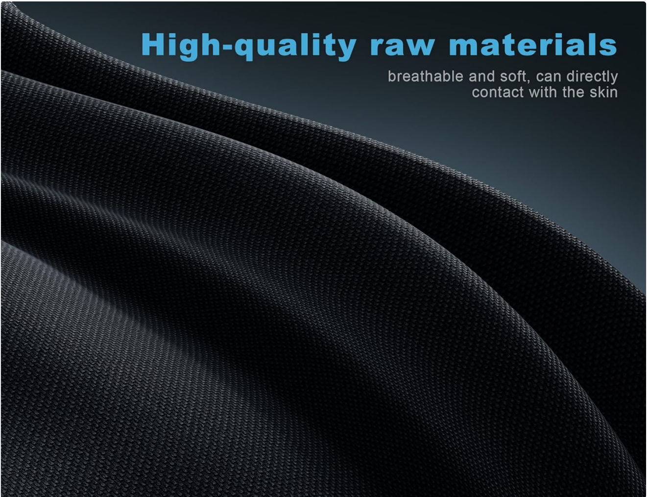
Figure 8.2: High-quality breathable fabric material.

breathable and soft, can directly contact with the skin