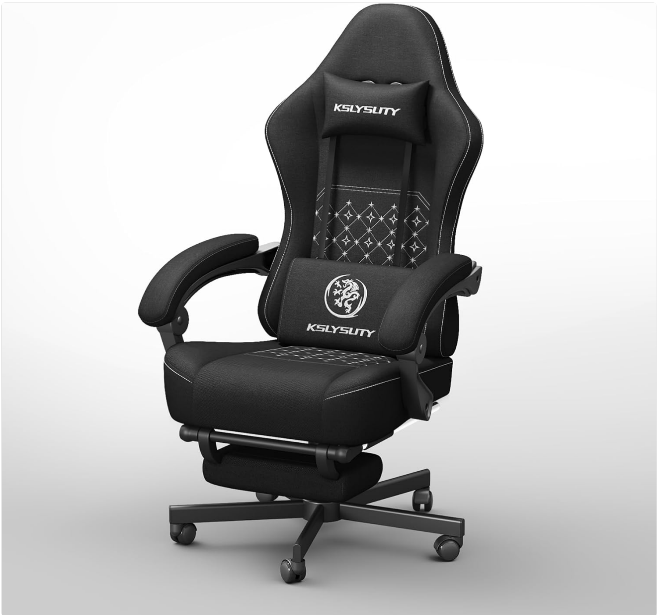
Figure 1.1: Kslysuty Gaming Chair (Black Fabric Model)

Video 1.1: A Quick Look at the Kslysuty Gaming Chair. This video provides a brief overview of the chair's design and features.