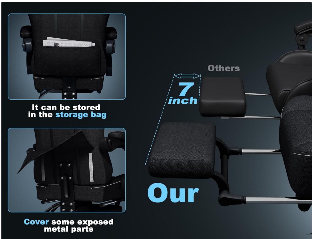
Figure 5.3: Detail of the upgraded footrest, highlighting its storage capability and detachable soft cover.