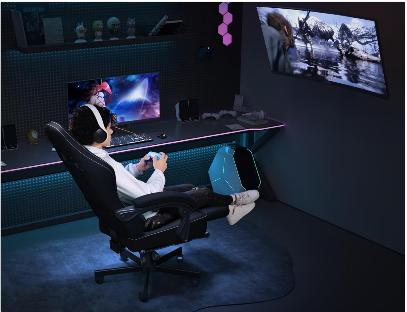
Figure 5.2: User demonstrating the extended footrest for relaxation.