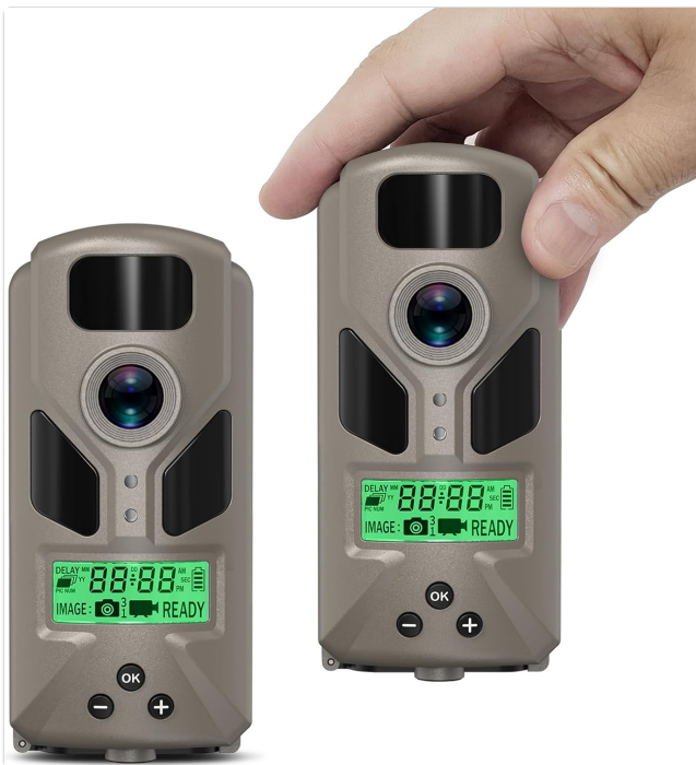
Figure 1: Two OUTDOOR EXPERT Mini Trail Cameras, demonstrating their compact and portable design.