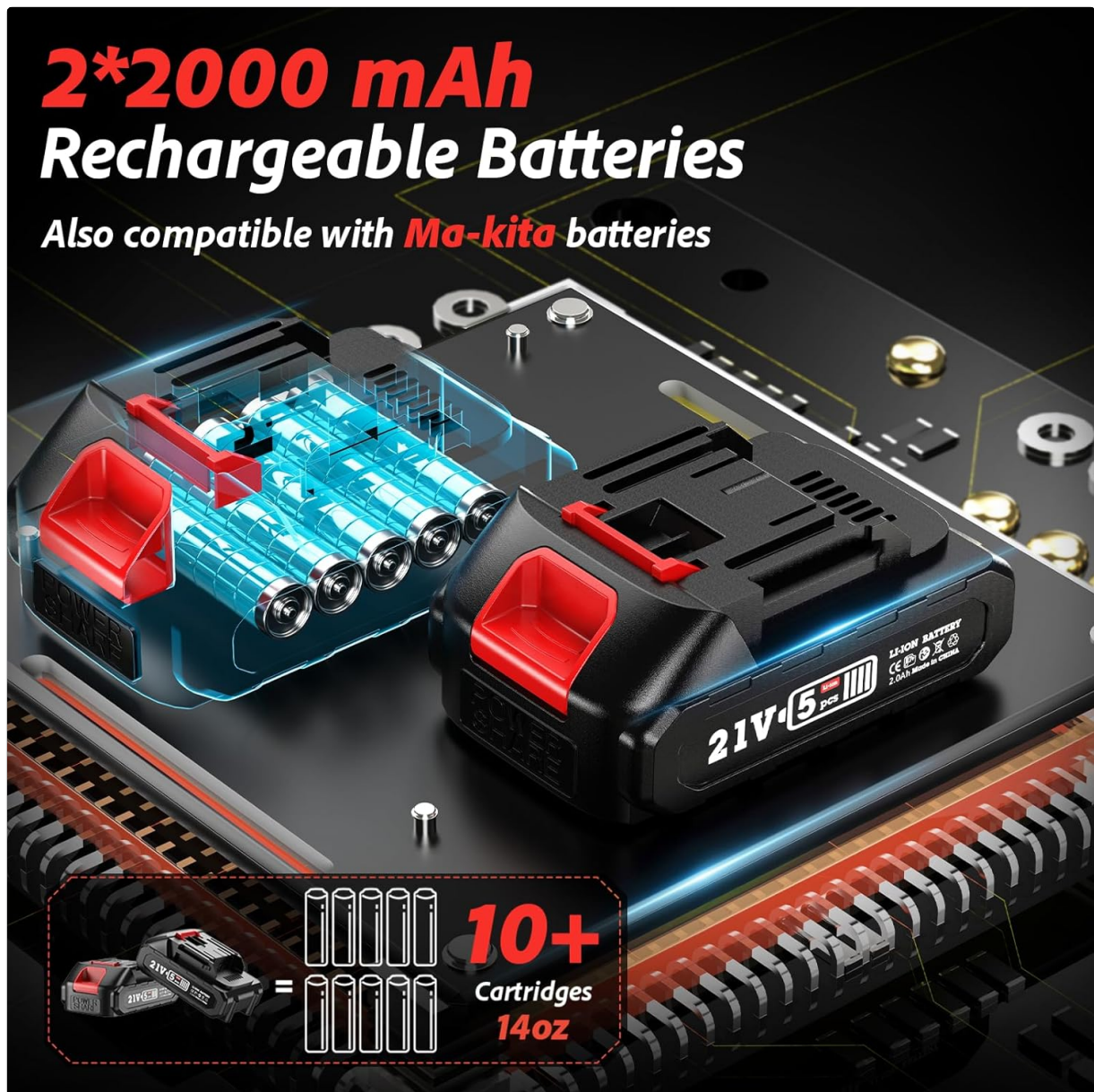
Figure 2: TaskStar 21V 2000 mAh rechargeable batteries.

To install the battery, align it with the battery slot on the grease gun handle and slide it in until it clicks securely into place. To remove, press the release button and slide the battery out.