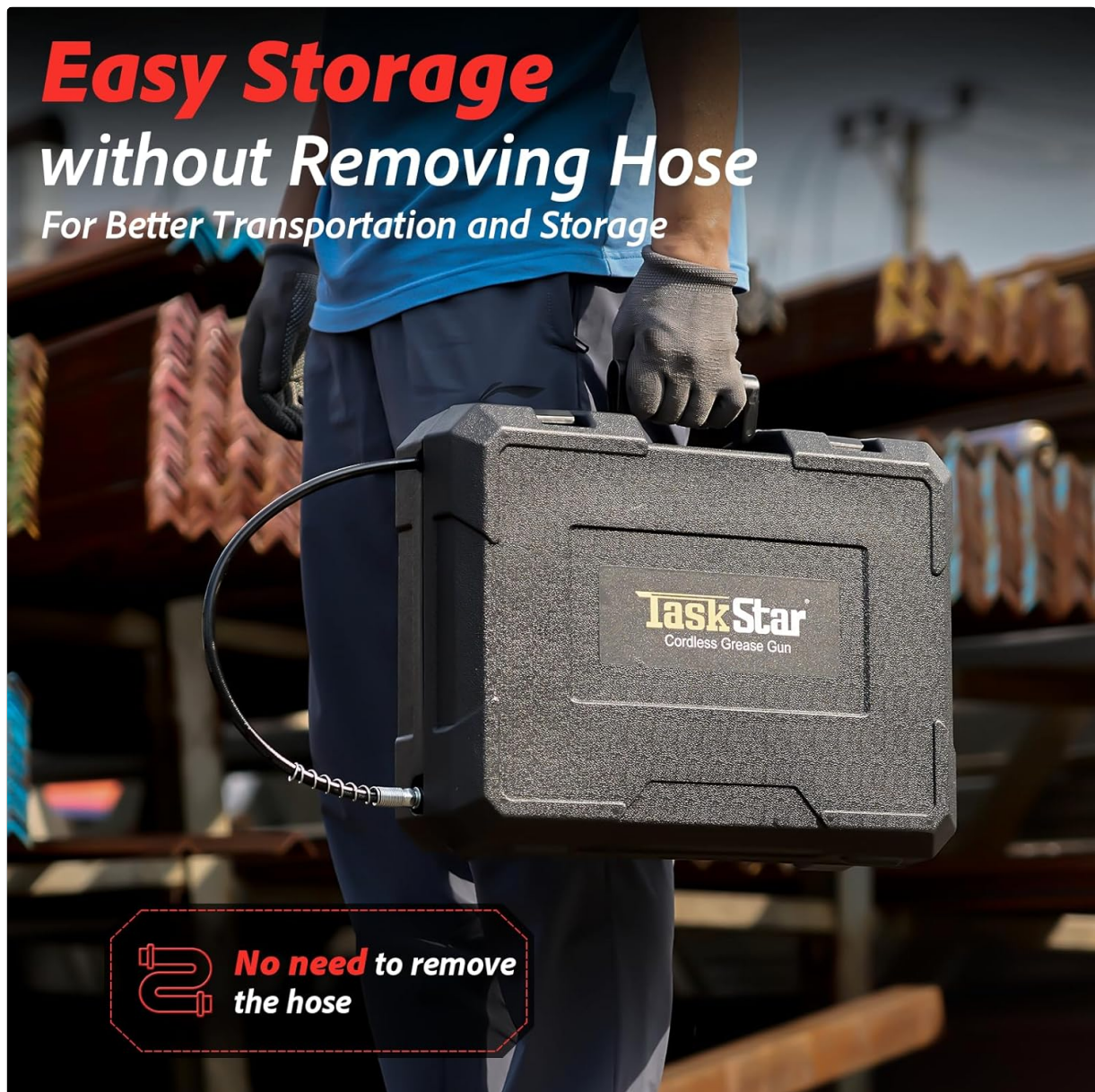
Figure 8: Convenient storage in the carrying case with hose attached.