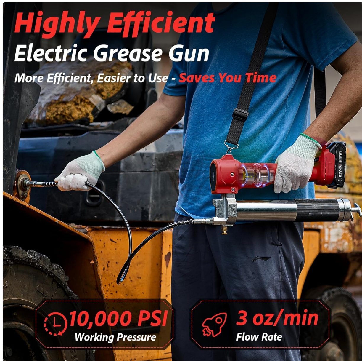
Figure 5: High-efficiency greasing with the TaskStar gun.