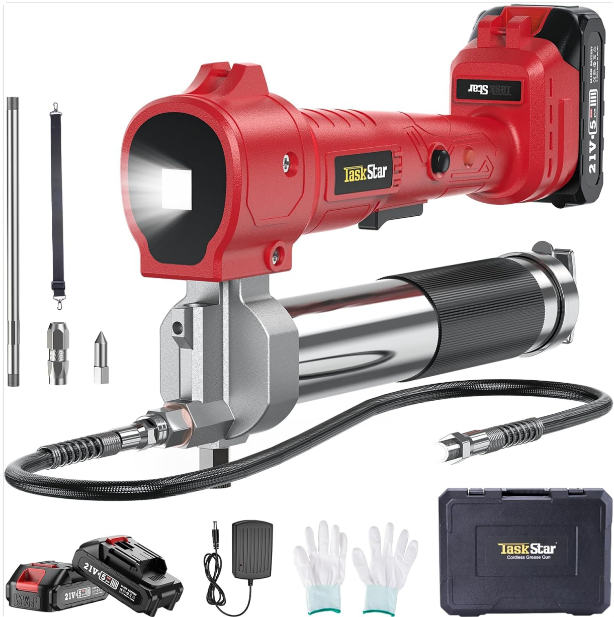
Figure 1: All components included in the TaskStar Cordless Electric Grease Gun kit.