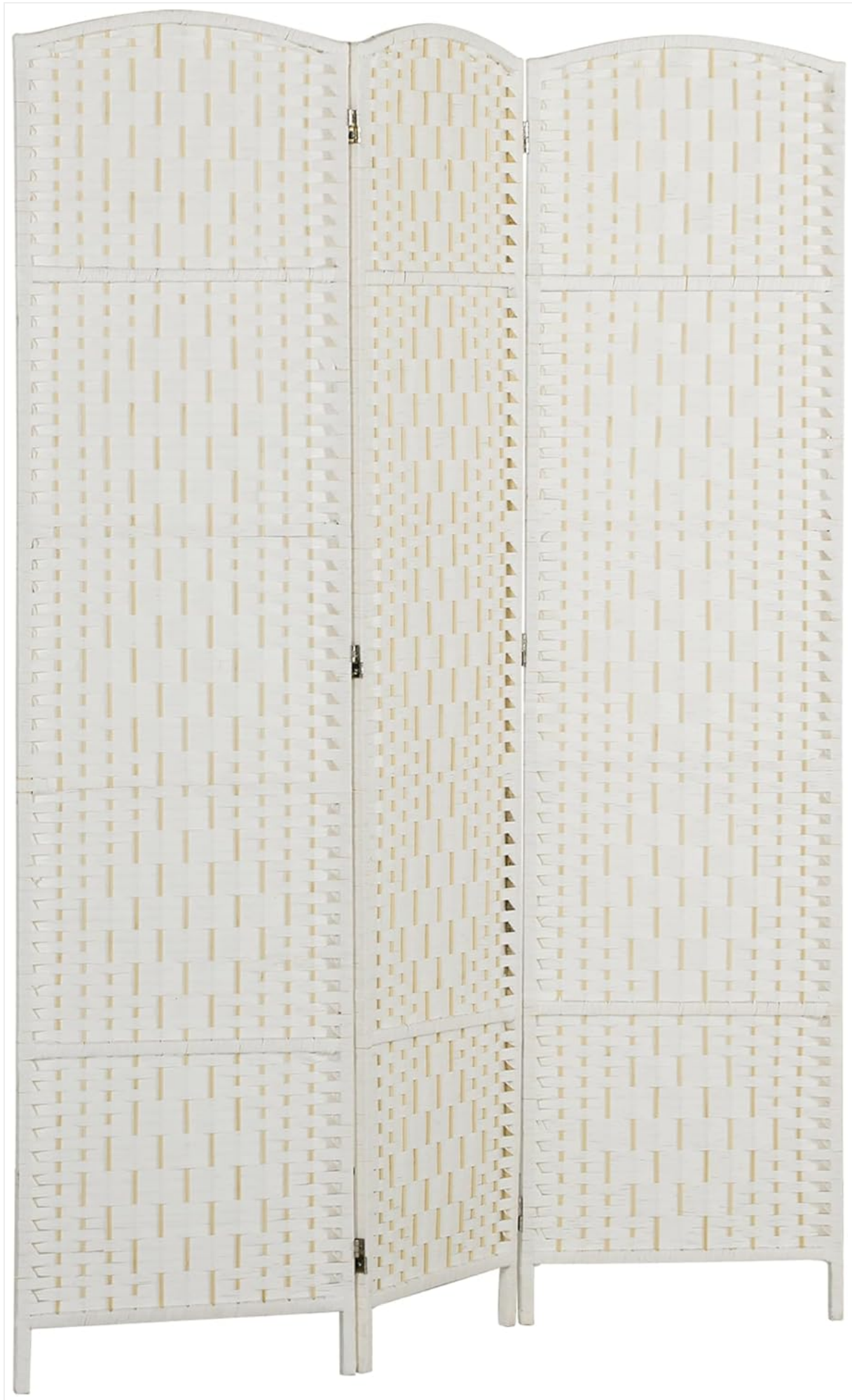
Figure 1: The HOMCOM 3-Panel Folding Room Divider, showcasing its design and full extension.