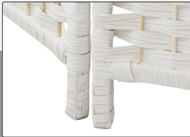
Figure 4: Detailed view of the hand-woven design and elevated base for ventilation.