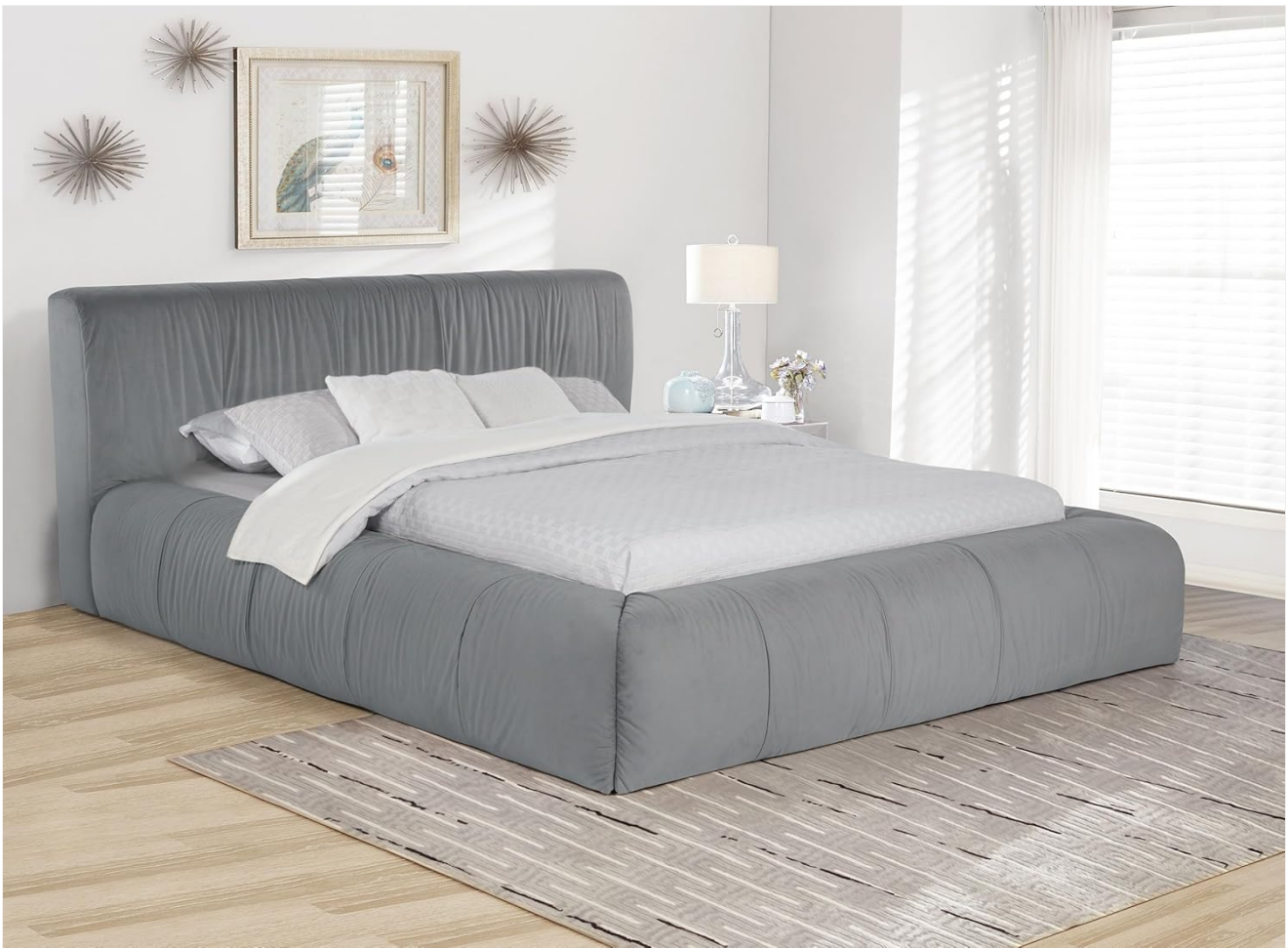
Figure 4.1: The Wilshire Platform Bed with mattress and bedding, ready for use.