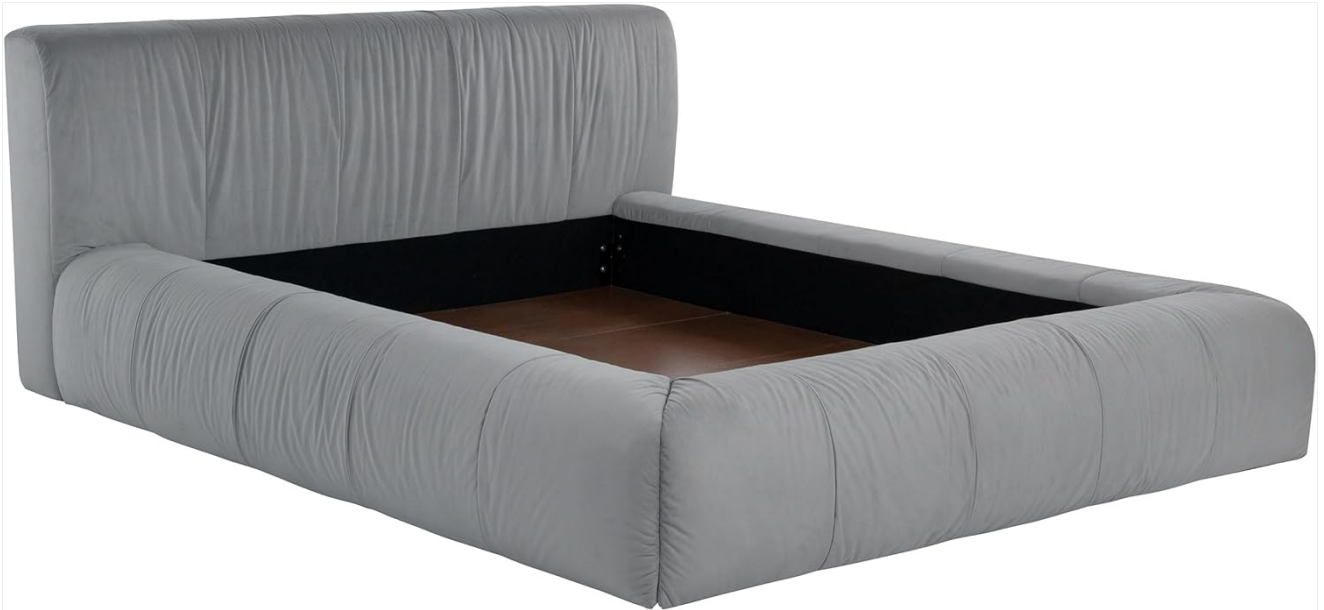
Figure 2.1: Coaster Wilshire Eastern King Platform Bed Frame, fully assembled.