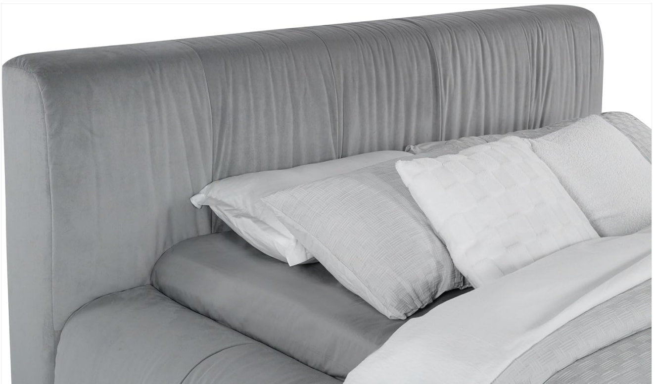
Figure 2.2: Close-up view of the upholstered headboard with pleated fabric detail.