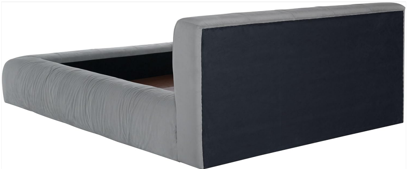
Figure 3.1: Rear view of the headboard, showing attachment points for side rails.