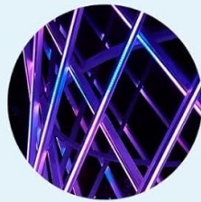
LED Strip Lights