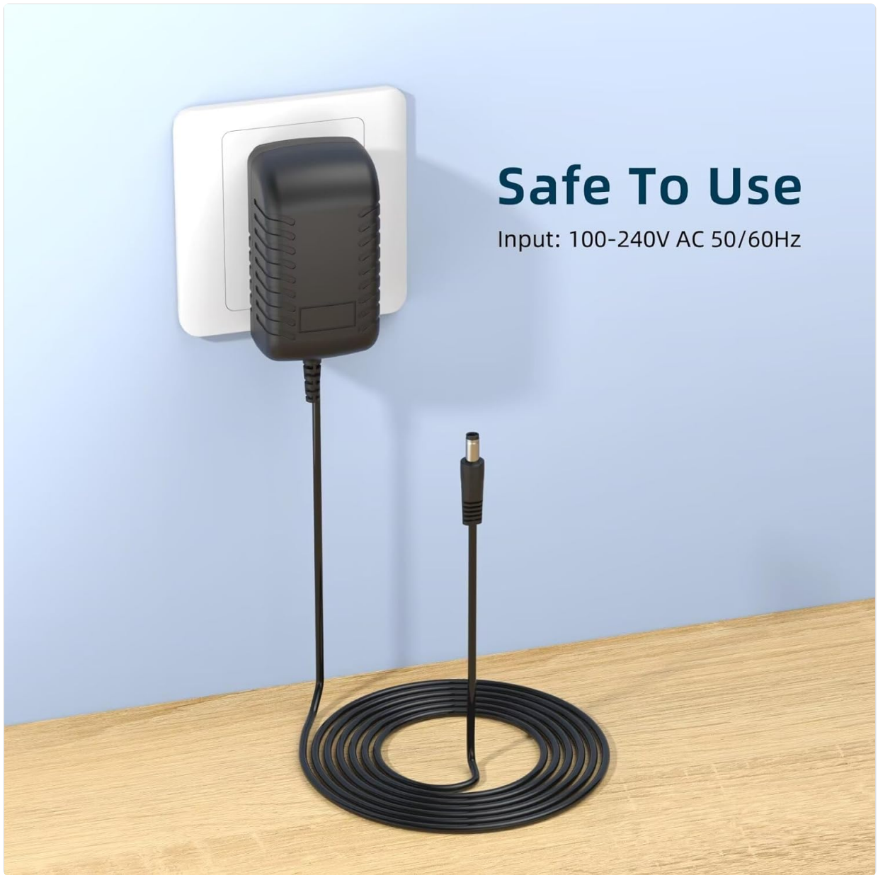
The adapter is shown plugged into a standard wall outlet, demonstrating its readiness for use and its wide input voltage compatibility (100-240V AC).