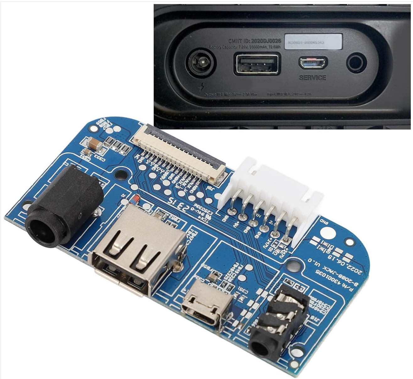
Image 2: The replacement board shown alongside the original speaker's port area, illustrating compatibility.

Your browser does not support the video tag.