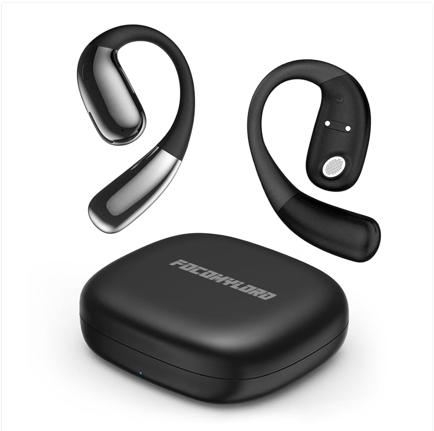
Image: The FocoMyLord AI Translation Earbuds, showing both earbuds and their compact charging case.