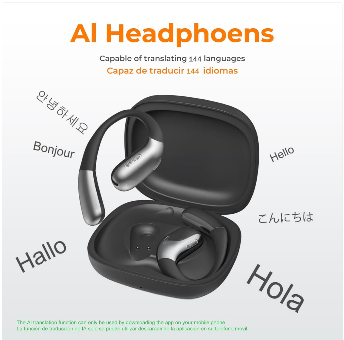
Image: The earbuds in their charging case, surrounded by various greetings in different languages, illustrating their translation capability.

To utilize the real-time translation features, you must download and install the dedicated FocoMyLord translation application on your smartphone. Search for "FocoMyLord Translator" (or similar, as per product instructions) in your device's app store (Google Play Store for Android, Apple App Store for iOS). Follow the on-screen instructions to complete the app installation and initial setup.