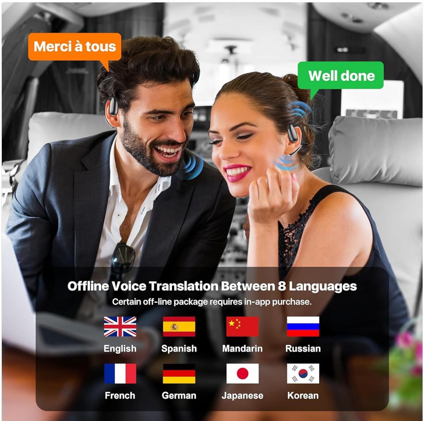
Image: Two individuals engaged in a conversation, each wearing an earbud, demonstrating the real-time translation feature with speech bubbles showing translation from French to English.