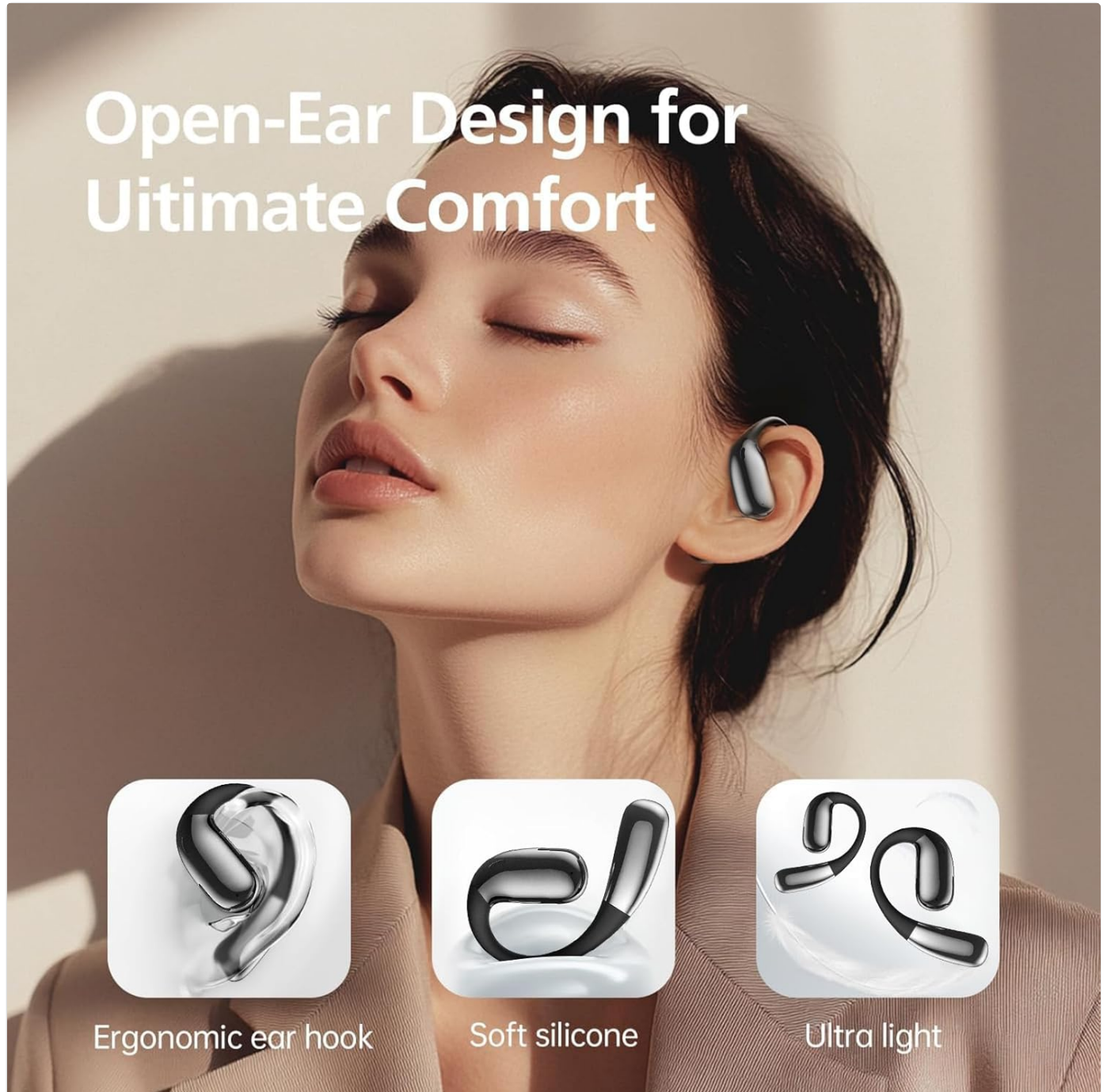
Image: Diagram illustrating the ergonomic ear hook, soft silicone, and ultra-light features of the open-ear design for maximum comfort.

The FocoMyLord A38-B earbuds feature an open-ear design for ultimate comfort and situational awareness. Gently place the earbud over your ear, ensuring the ear hook rests securely behind your ear. Adjust for a comfortable and stable fit. The soft silicone material and ultra-light design ensure prolonged comfort.