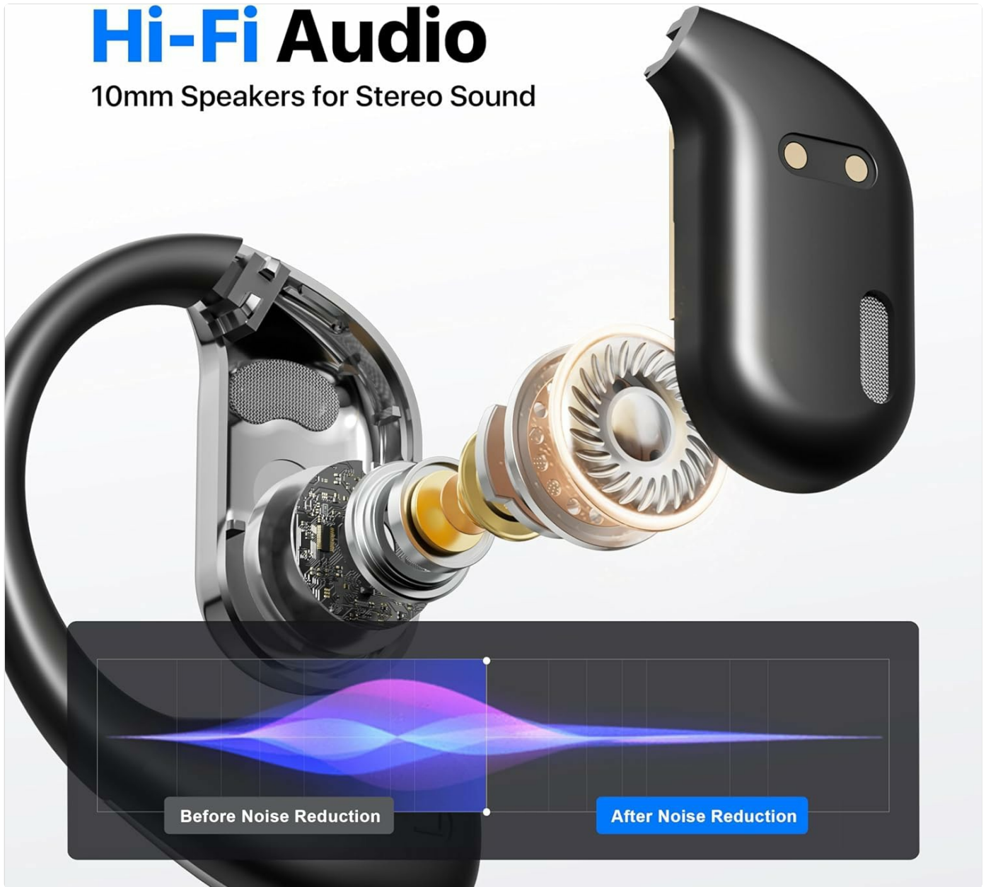
Image: An exploded view of an earbud highlighting its 10mm speaker for Hi-Fi stereo sound, accompanied by a graph illustrating the effect of noise reduction.