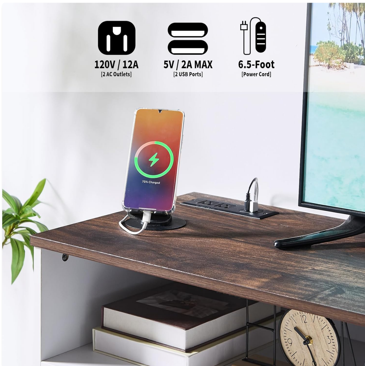
Image 4.3: Integrated charging station with AC outlets and USB ports.