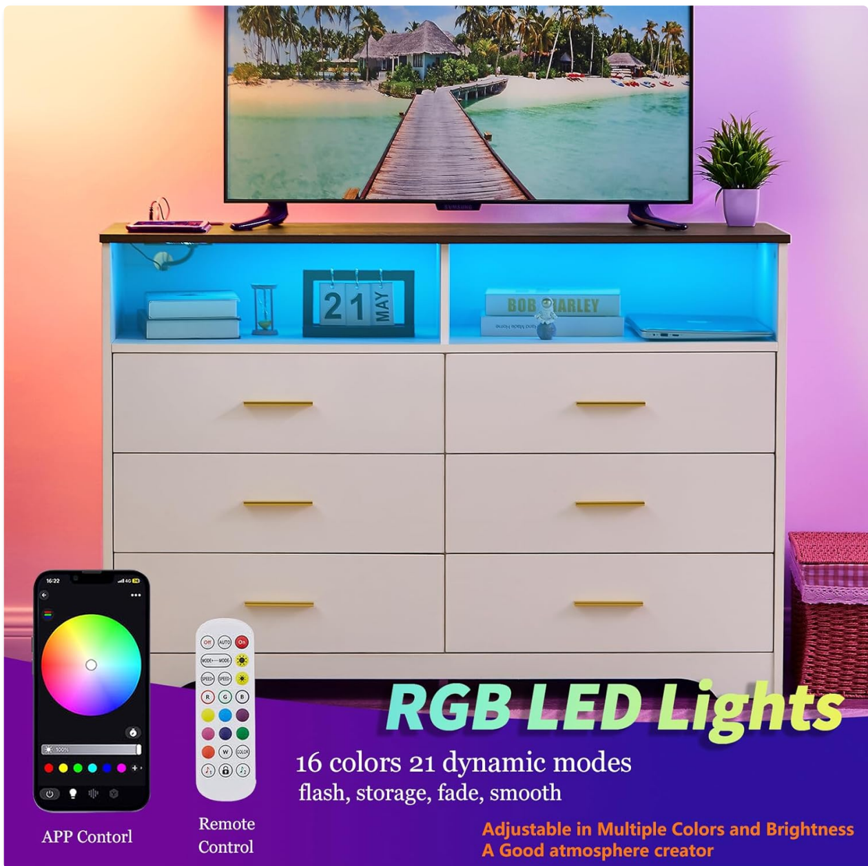
Image 4.5: LED lights in operation with remote and app control options.