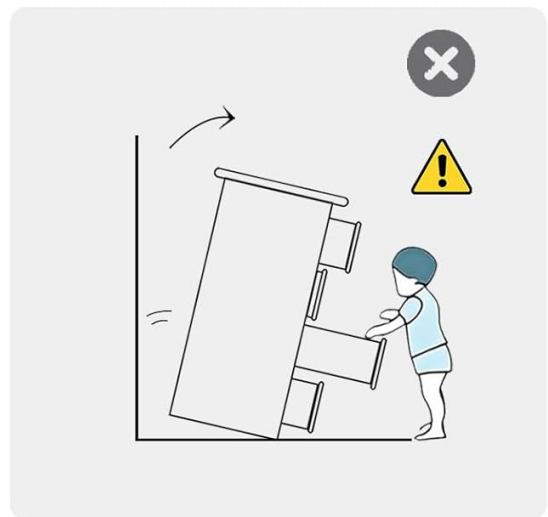
Image 2.1: Illustration of the anti-tip kit installation and the importance of securing the dresser.