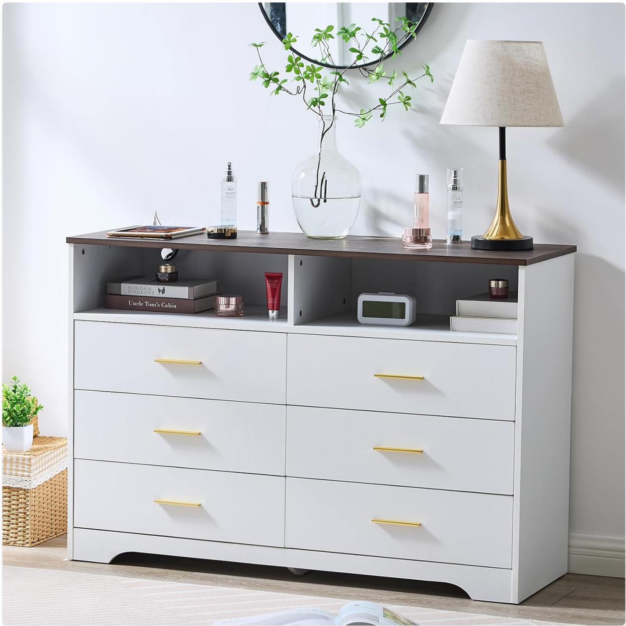
Image 1.1: The LIDYUK White 6-Drawer Dresser in a bedroom setting.