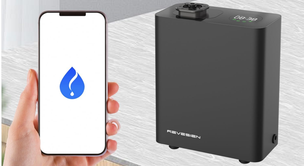
Image 4.2: Visual guide for quick setup using the mobile application.

3 CUSTOMIZE schedules for each day of the week