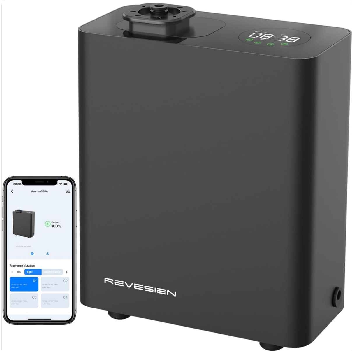
Image 3.1: Front view of the Revesien HVAC Scent Diffuser Machine in black.