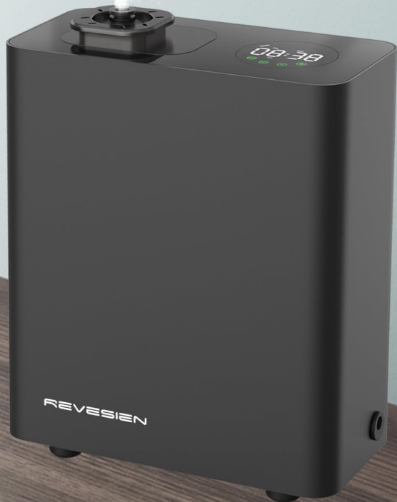
Image 3.2: Diagram illustrating key features such as 3000 sq. ft. coverage, waterless operation, smart app control, and low noise.