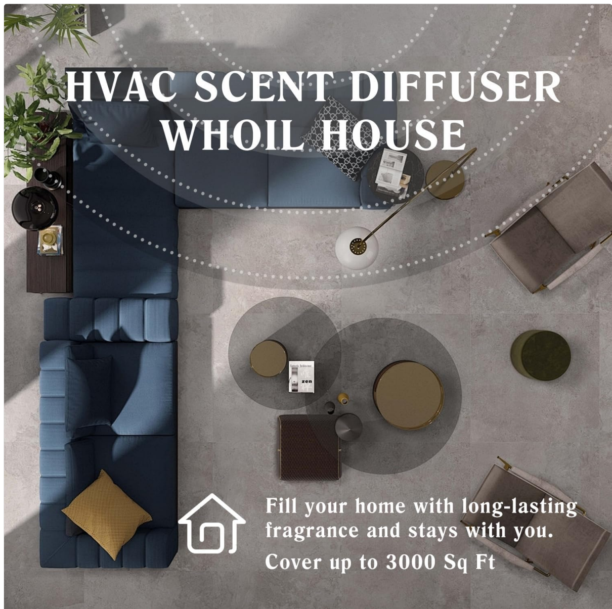
Image 4.1: Illustration of scent distribution through an HVAC system in a large room.