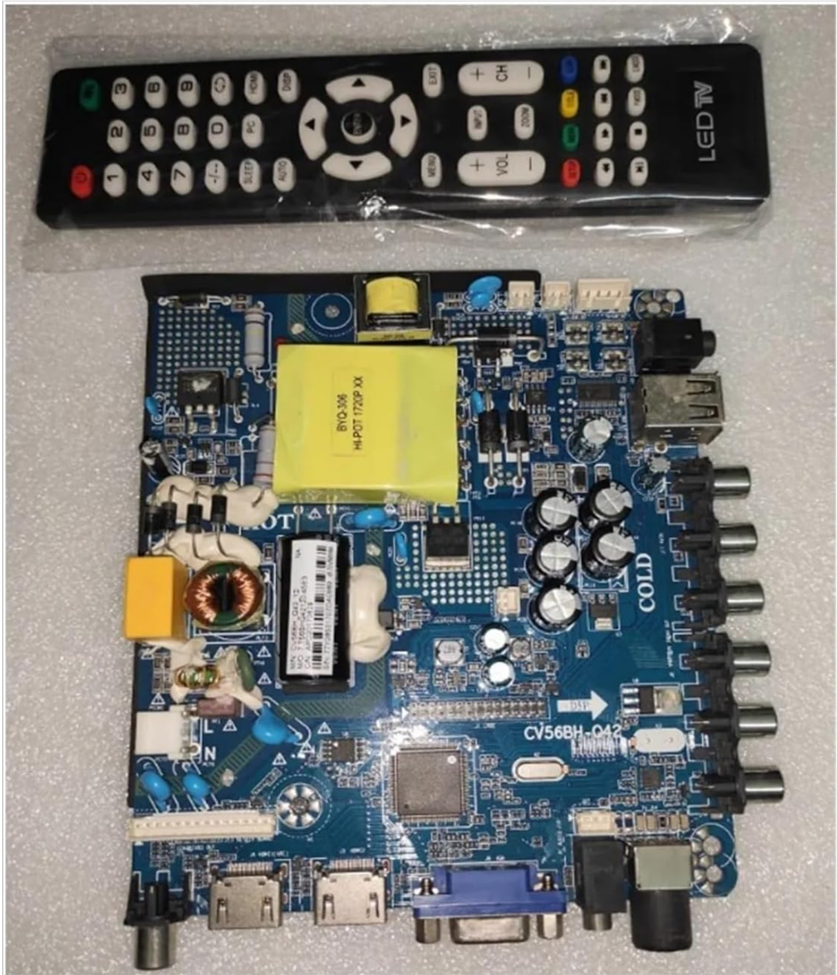
Figure 1: Front view of the CV56BH-Q42 Universal TV Motherboard, showing various input/output ports (HDMI, VGA, USB, AV) and the main processing unit. A remote control is also visible, indicating compatibility.