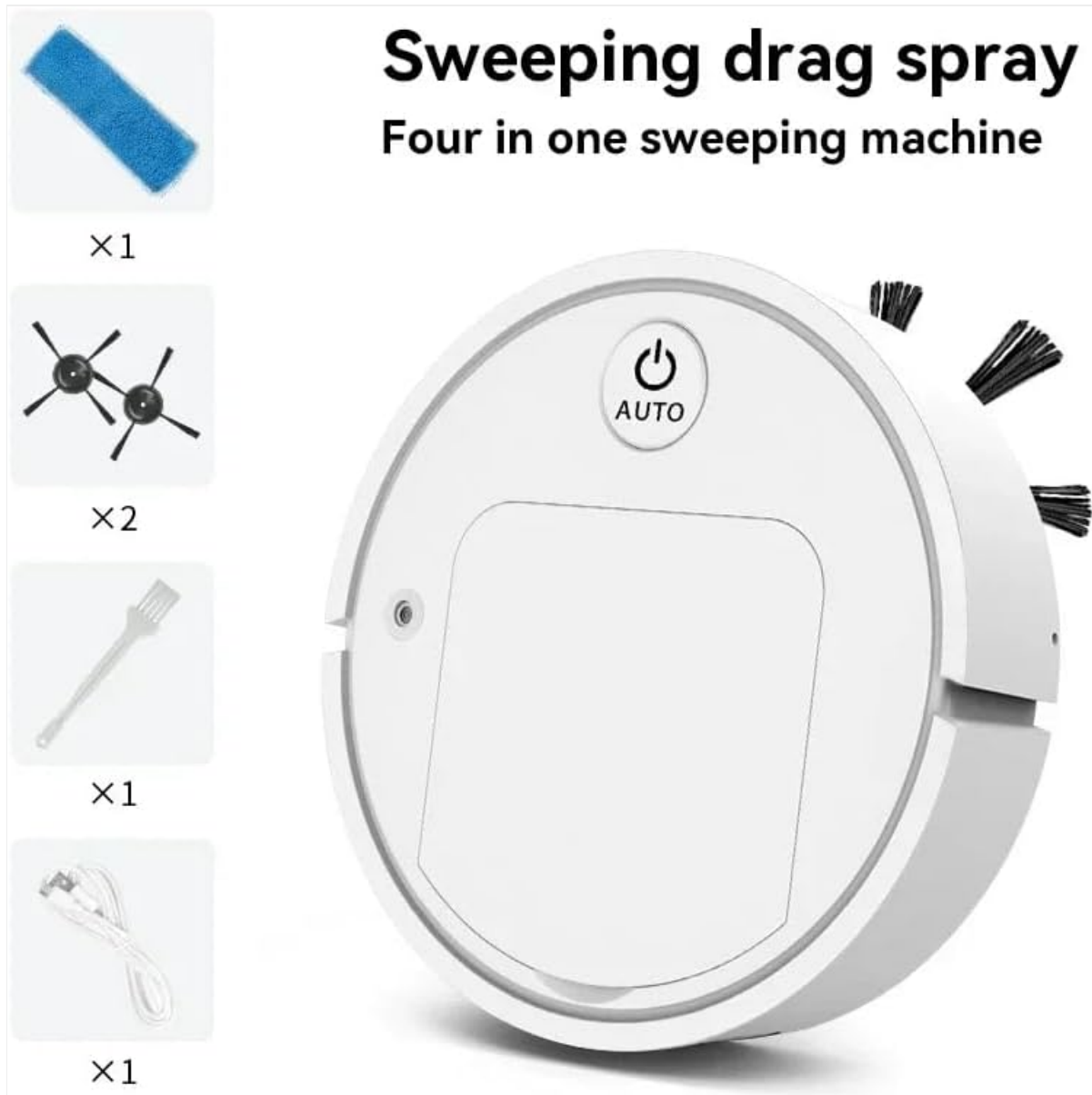
Image 3.1: Visual representation of the package contents, including the robot, USB cable, cloths, water bottle, and side brushes.