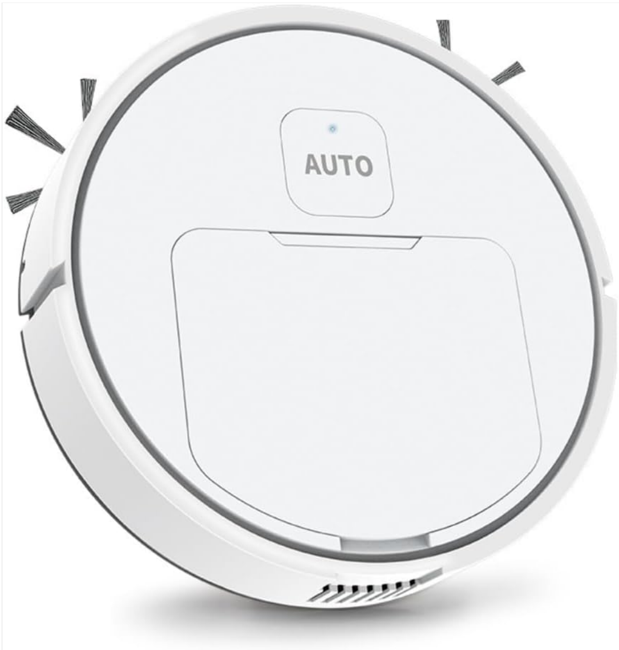
Image 1.1: The ALisasin 3-in-1 Smart Sweeper Robotic Vacuum Cleaner, a compact white circular device with an 'AUTO' button.