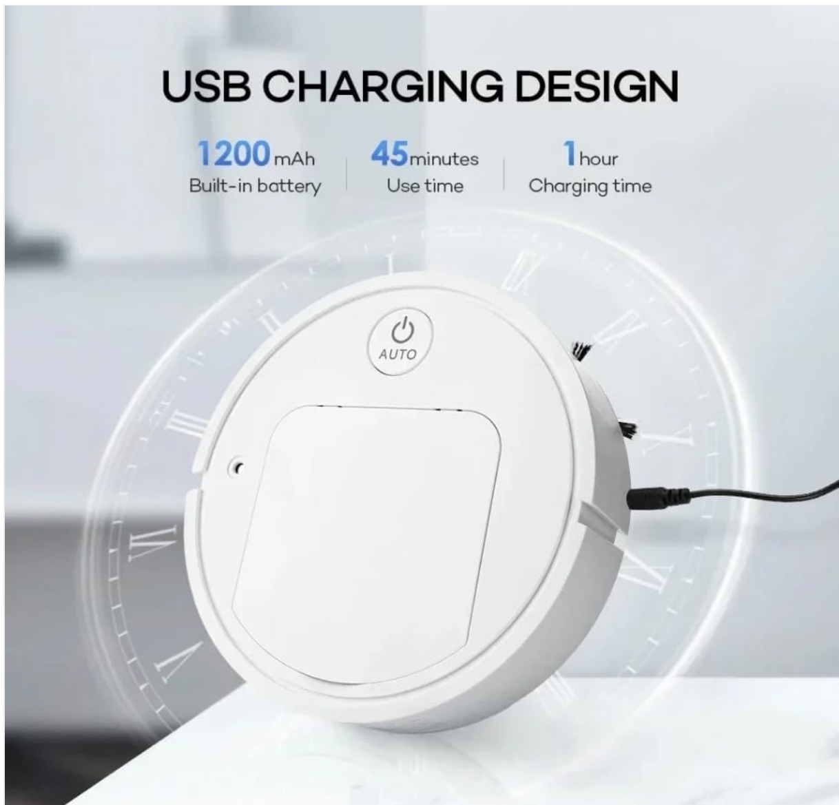
Image 4.1: The robotic vacuum cleaner connected to a USB charging cable, illustrating the charging process.