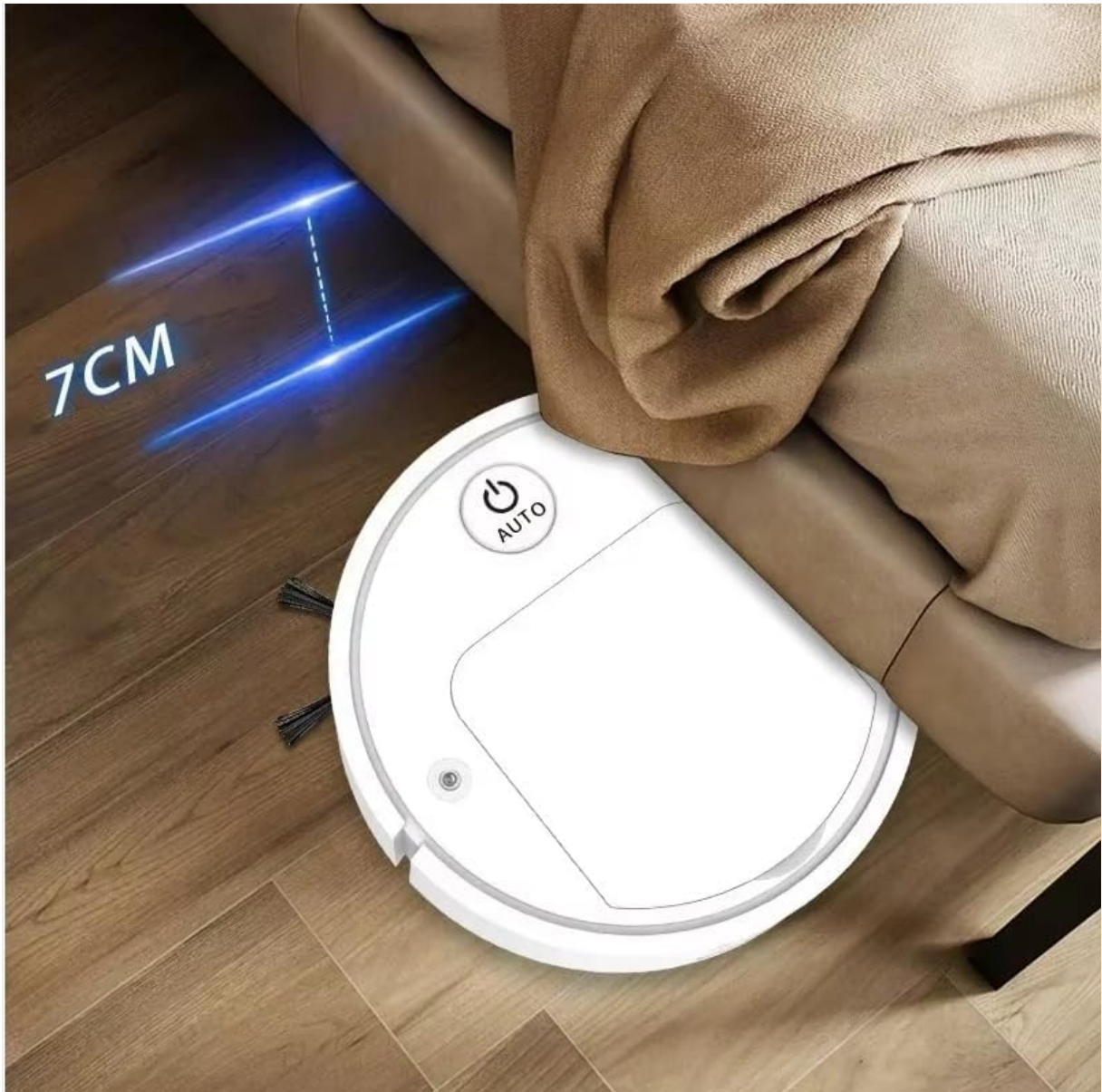
Image 5.2: The robotic vacuum cleaner demonstrating its ability to clean under low-clearance furniture, specifically showing a 7cm clearance.