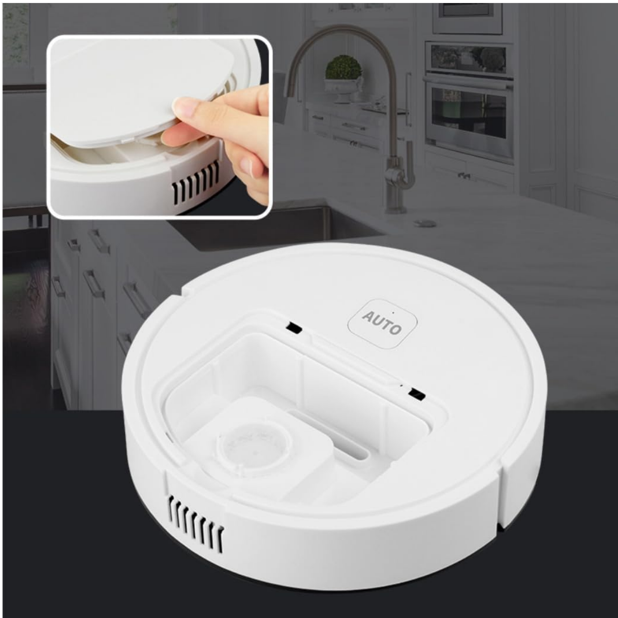
Image 6.1: A hand demonstrating how to open the dustbin compartment on the robotic vacuum cleaner for emptying.