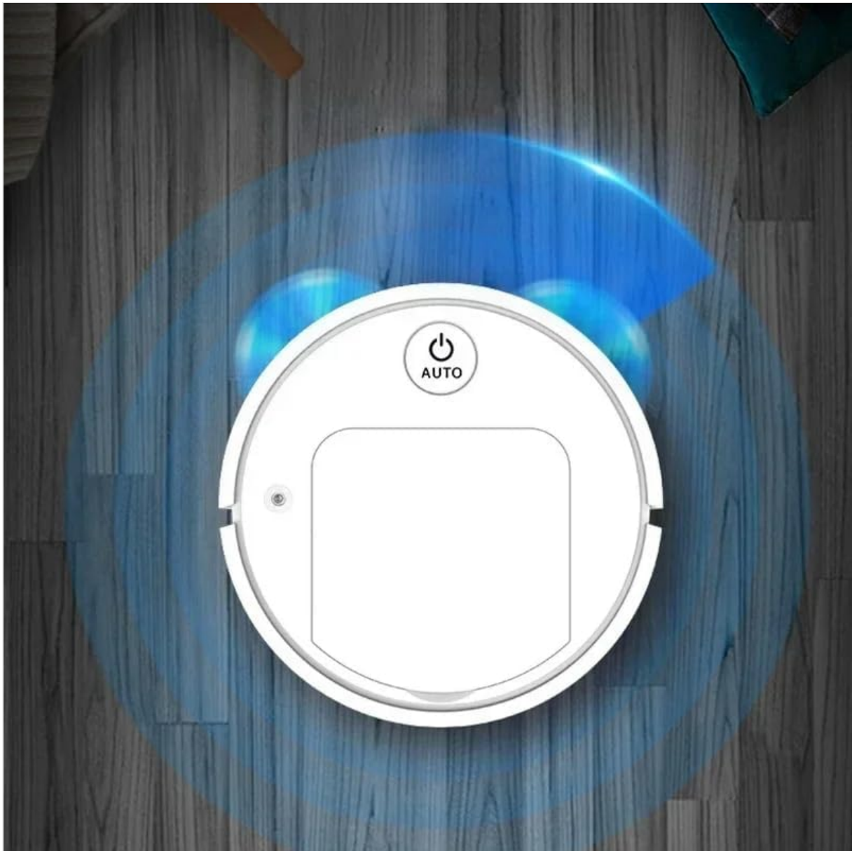
Image 5.3: The robotic vacuum cleaner in operation, with a blue light indicating its cleaning path on a wooden floor.