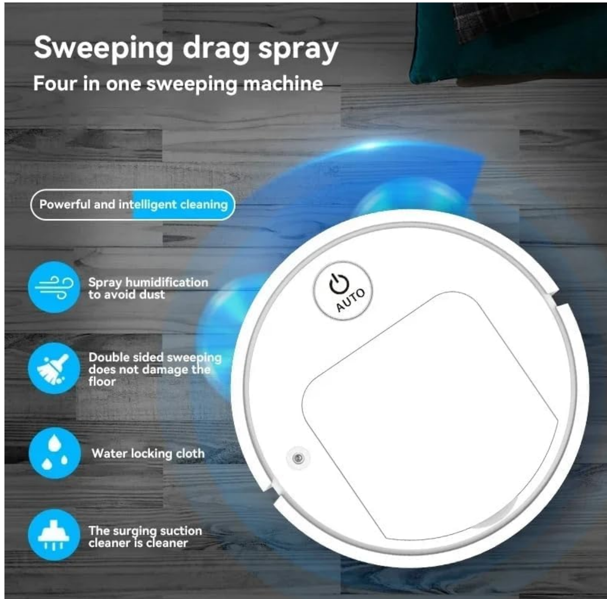
Image 5.1: Illustration of the robot's multi-functionality, including spray humidification, double-sided sweeping, water locking cloth, and suction.