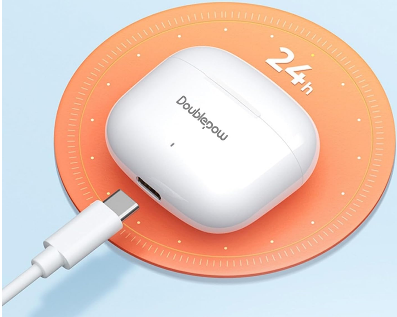
Image: The LP40 Pro charging case connected to a USB-C charging cable, illustrating the charging process and indicating a 24-hour long-lasting battery life with the case.

Type-C interface is fast charging and accelerating, and it only takes 1.5 hours to fully charge