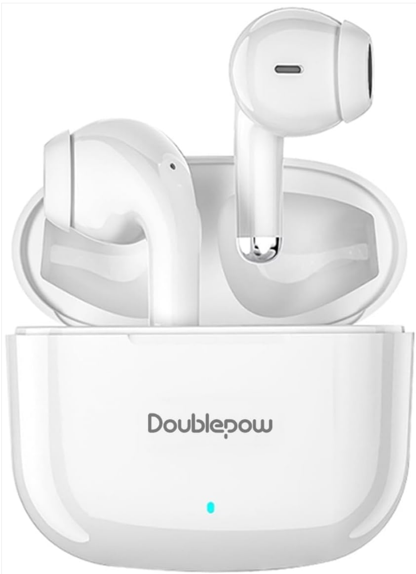
Image: The LP40 Pro wireless earbuds resting inside their white charging case, with the Doublepow logo visible on the front and a small blue indicator light.