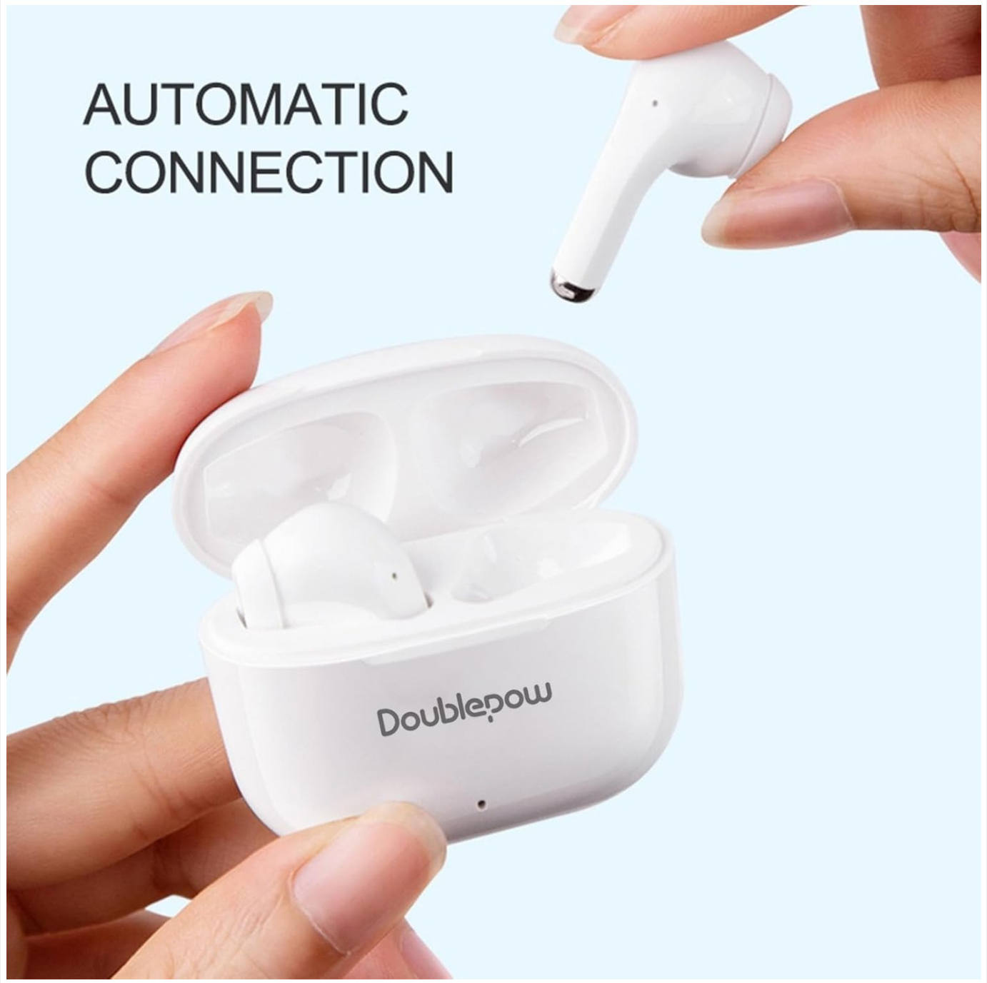
Image: A hand taking an earbud out of the charging case, with text indicating "AUTOMATIC CONNECTION", demonstrating the ease of pairing.