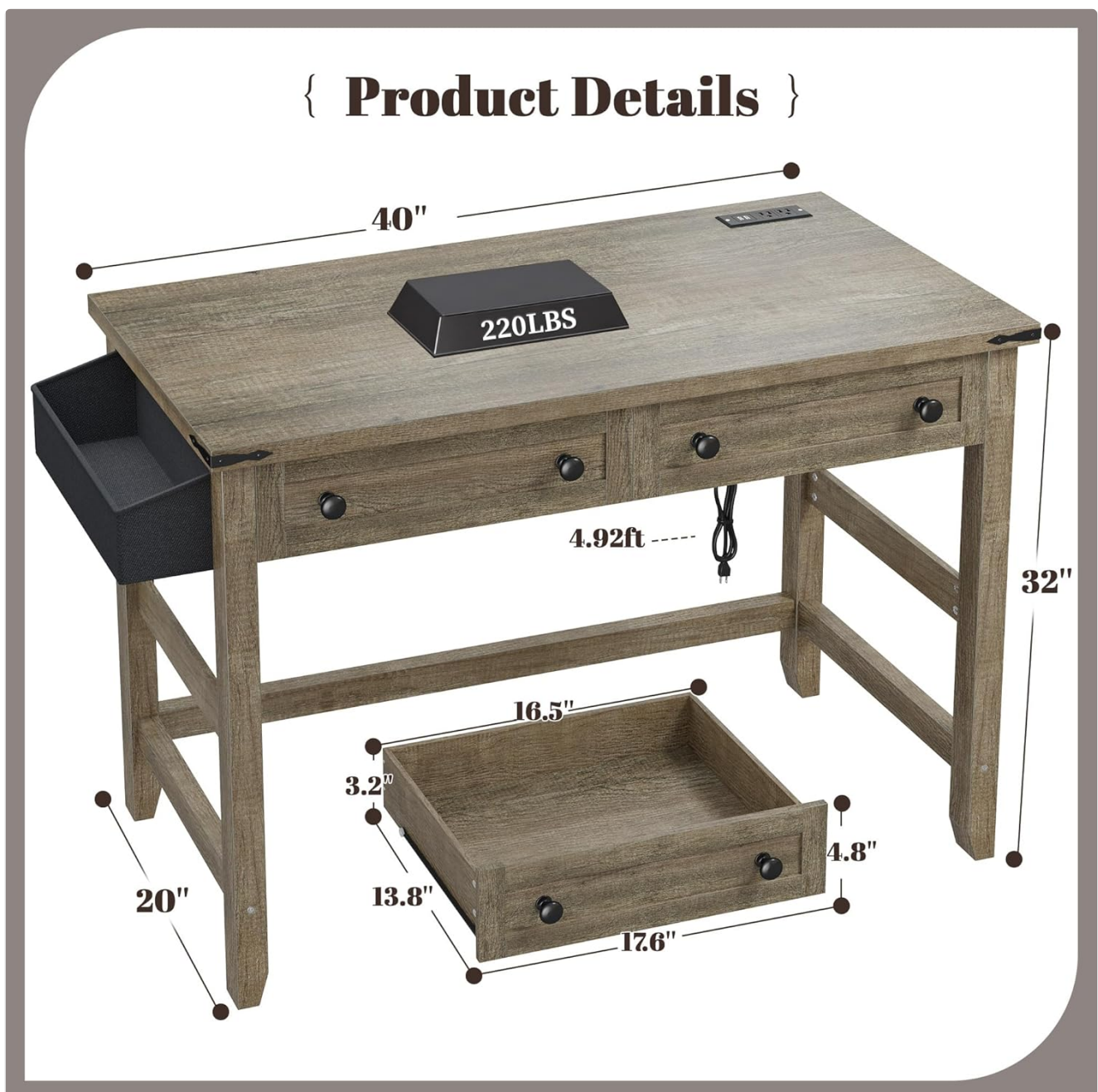
Figure 2: Product dimensions for the EnHomee 40-Inch Computer Desk, including overall size and individual drawer measurements.