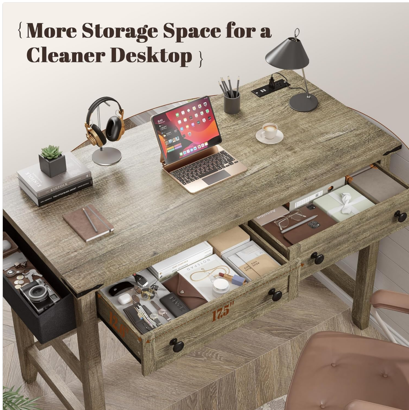
Figure 3: The desk's storage solutions, including two spacious drawers and a convenient side pocket, designed to keep your workspace tidy.

The desk features two smooth-gliding wood drawers and a fabric side pocket for organized storage. The drawers are ideal for stationery, documents, or small personal items. The side pocket offers convenient access for items like notebooks, tablets, or charging cables.