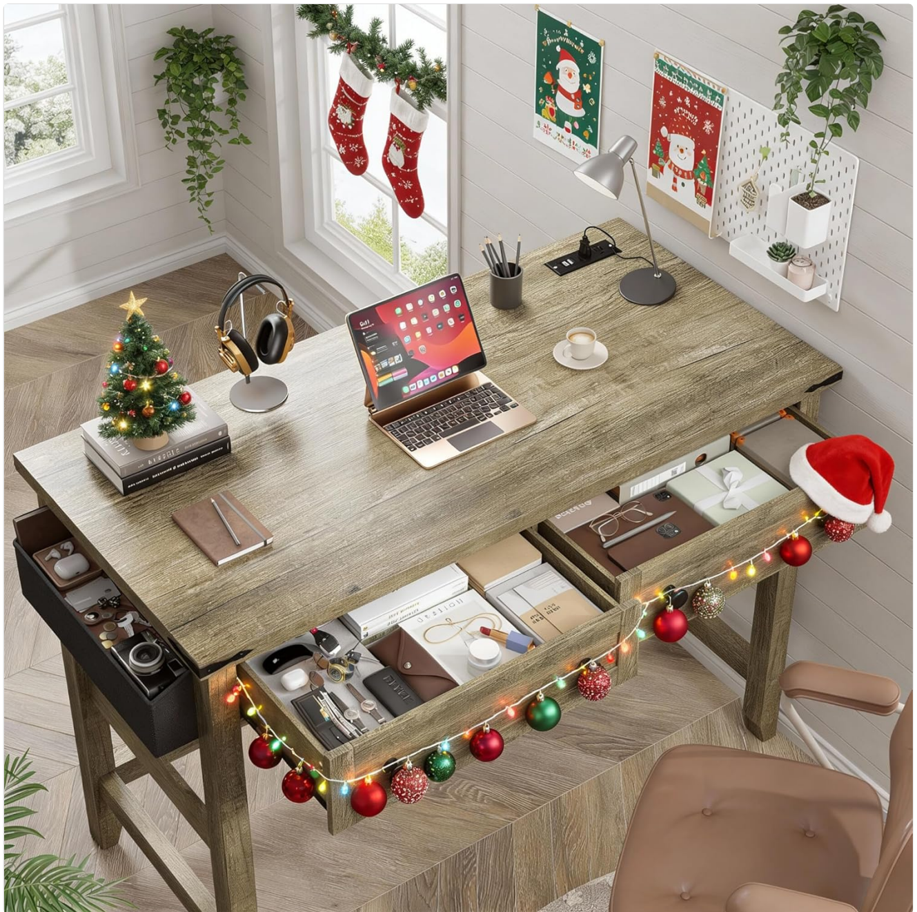
Figure 1: Overview of the EnHomee 40-Inch Computer Desk with Power Outlets, highlighting its functional design and storage capabilities.