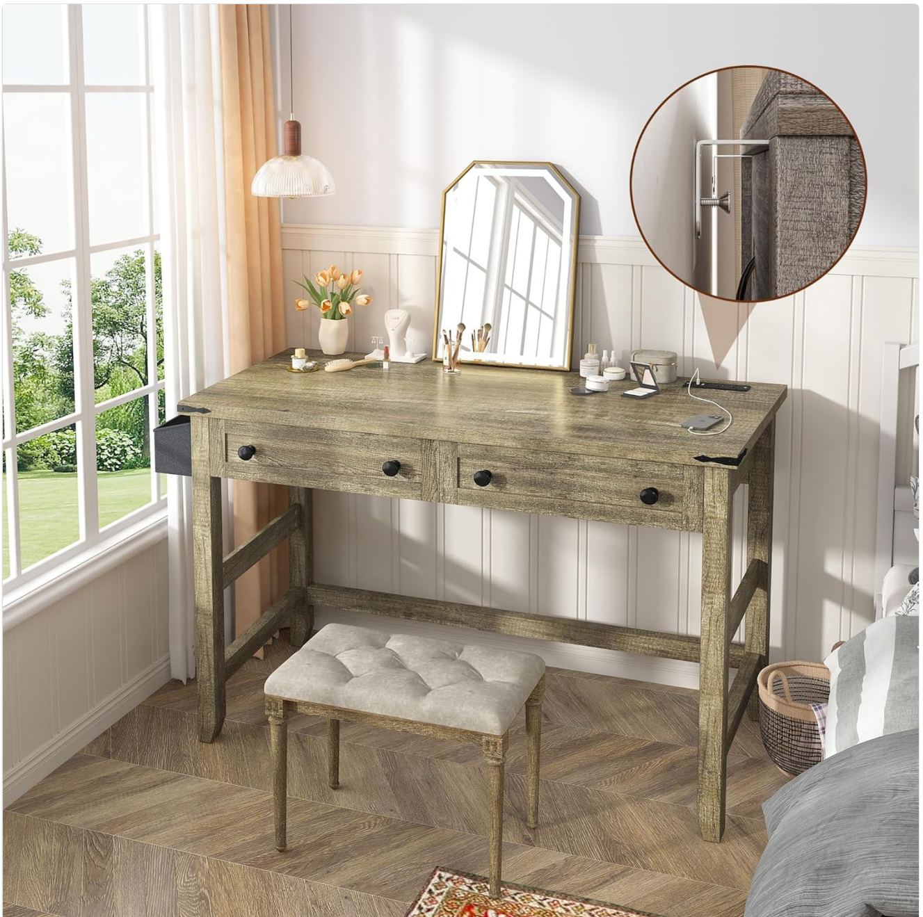
Figure 5: The desk's farmhouse style and compact size make it suitable for use as a vanity or in various small living spaces.