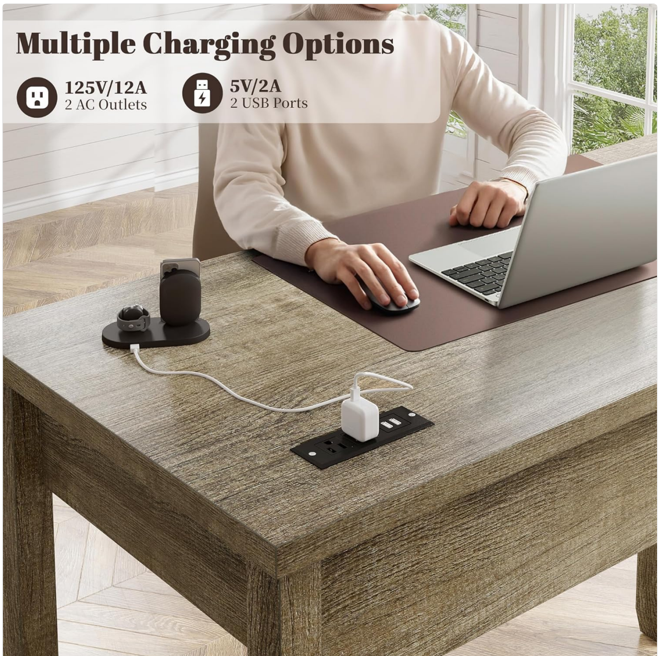
Figure 4: The integrated power hub offers convenient charging options for multiple devices directly on the desk surface.