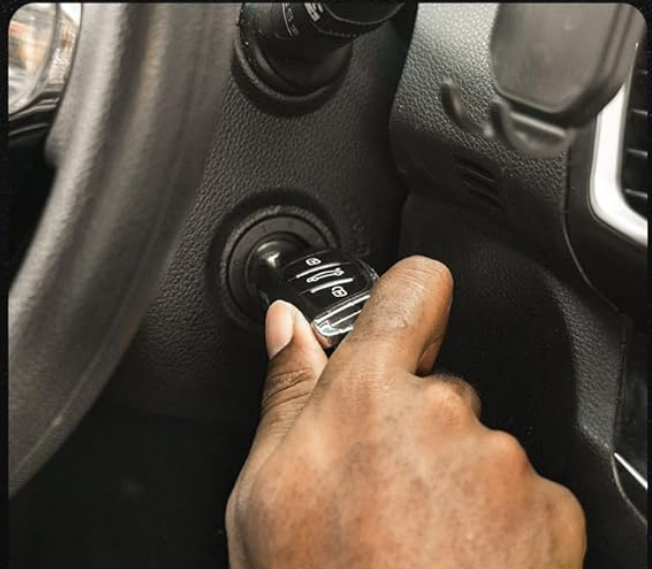
Step4 - Start the vehicle

Image: A visual step-by-step guide showing how to use the jump starter: inserting the cable, connecting clamps, checking the green light/boost button, and starting the vehicle.