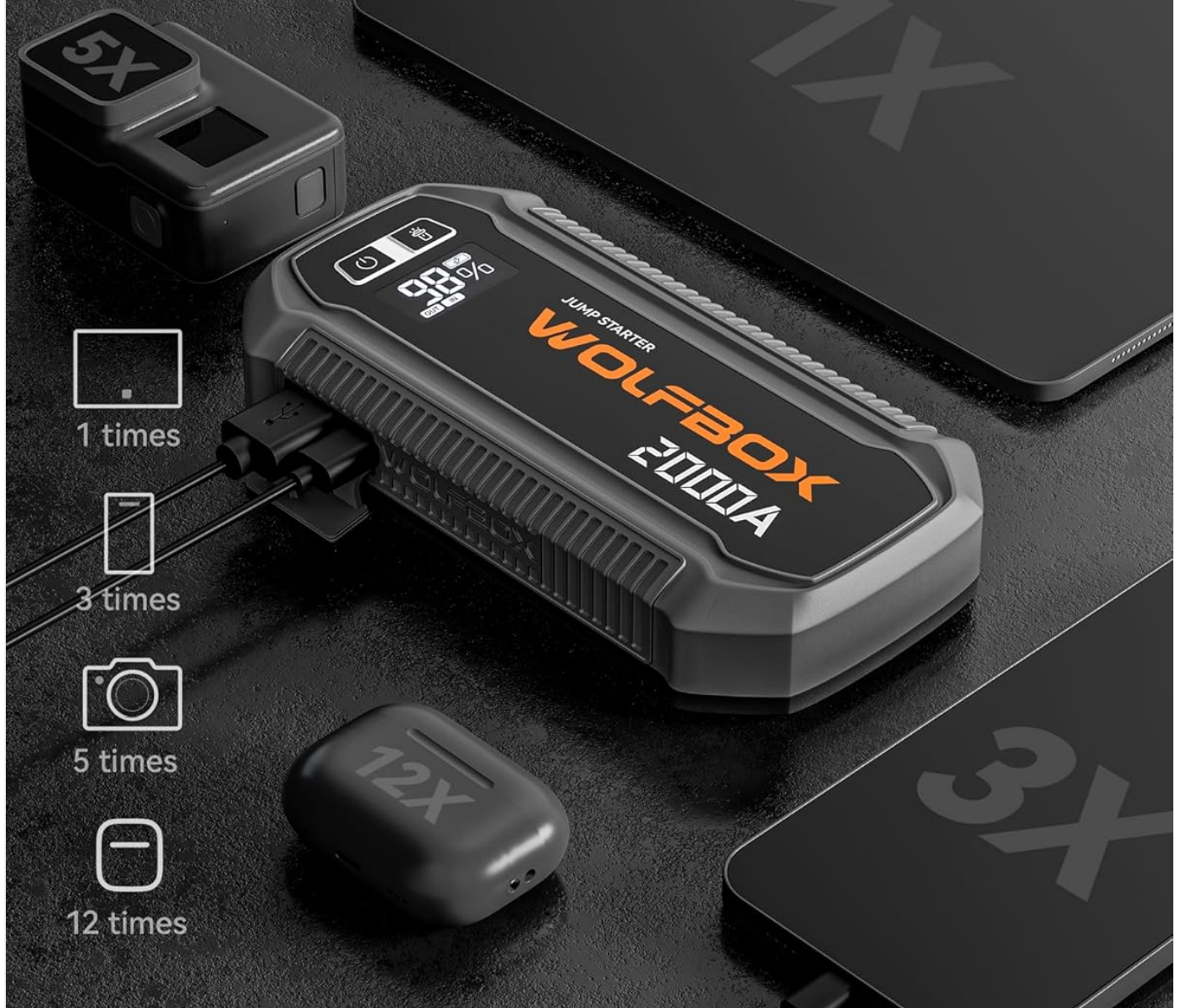
Image: The WOLFBOX 2000A Jump Starter connected via its USB-C port, illustrating its fast charging capability for multiple devices.

A full charge can be achieved in approximately 1.5 hours. The unit can charge up to 80% in just one hour. The jump starter can also charge other electronic devices like phones and tablets via its USB-C and USB-A ports.