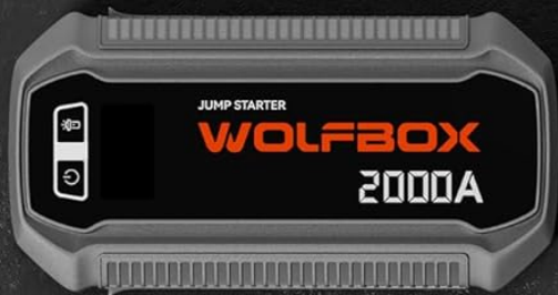
2000A Jump Starter