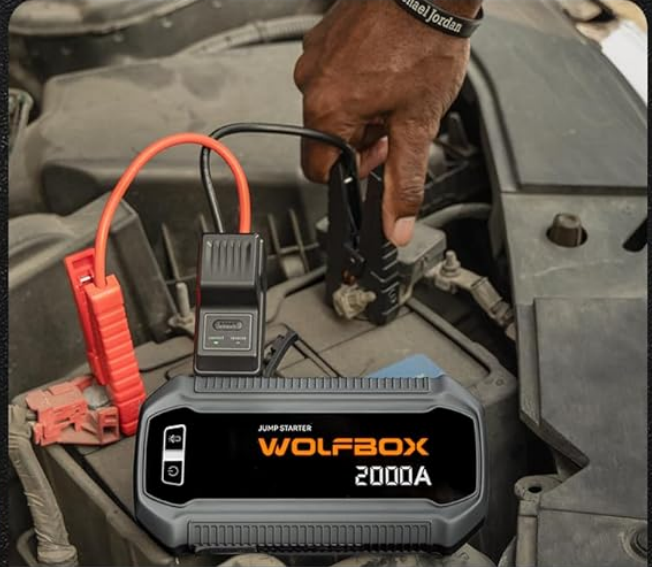
Step2 - Connect clamps to car battery