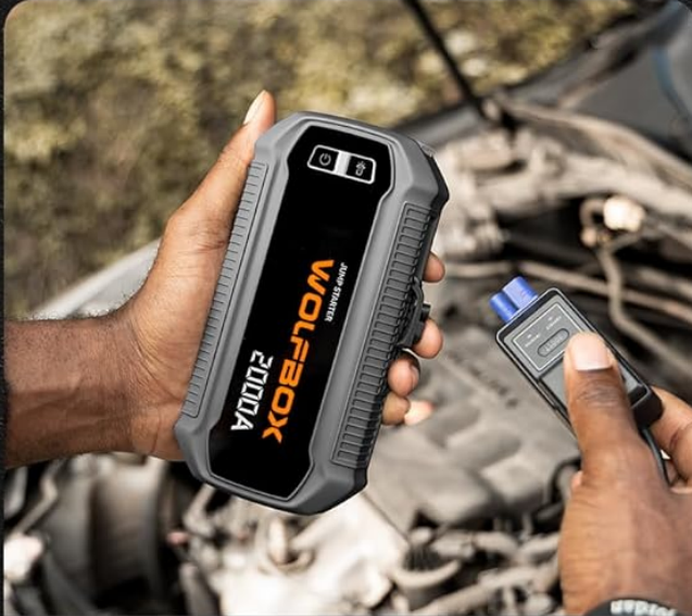
Step1 - Insert jumper cable