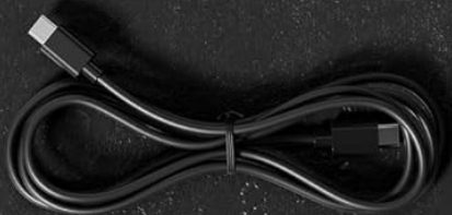
C to C Fast Charge Cable