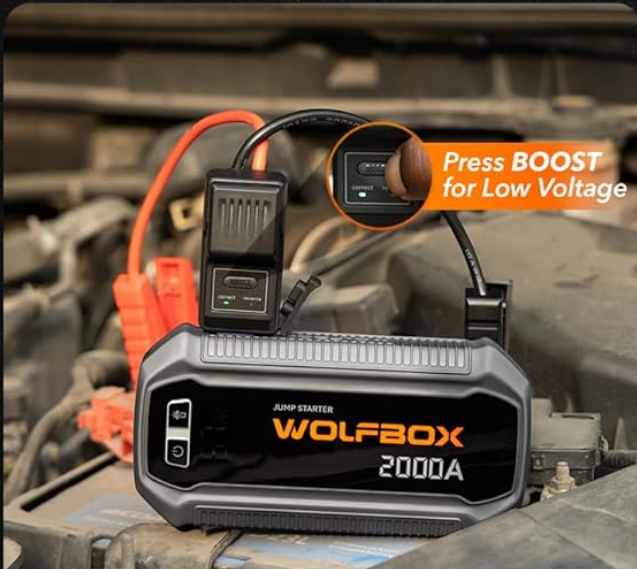
Step3 - Green light on "correct"