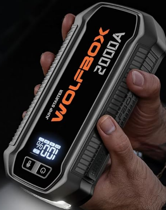
Image: The WOLFBOX 2000A Jump Starter held in hands, with its bright 300-lumen LED flashlight illuminated, highlighting its lighting, SOS, and strobe functions.