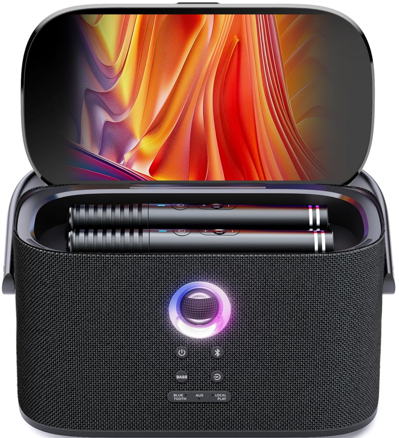
Image: The Ikarao Shell S2 karaoke machine with its included accessories.