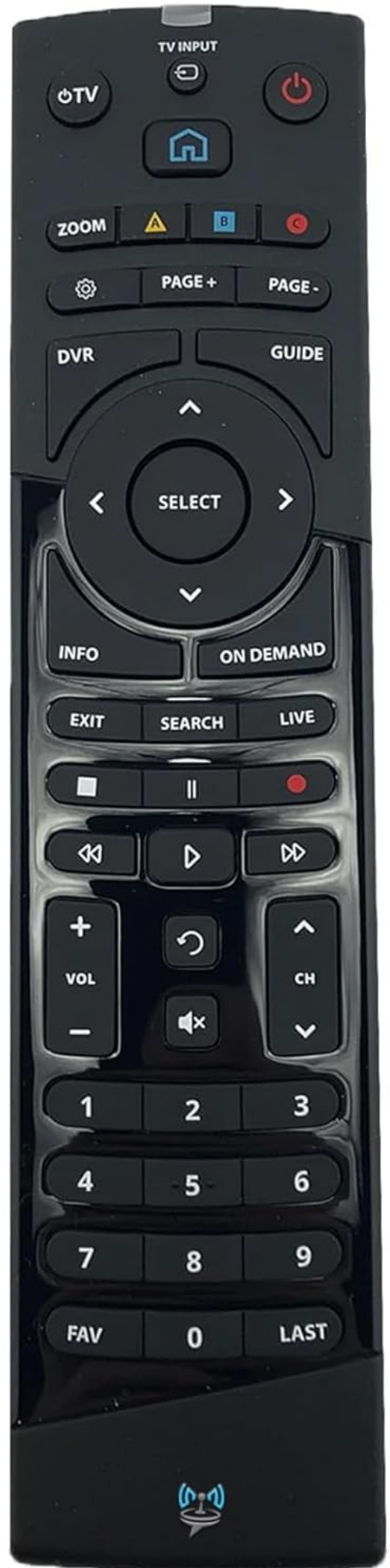
Image 2.1: Contents of the SatelliteSale Remote Control package, including the remote, a user guide (not included with this specific