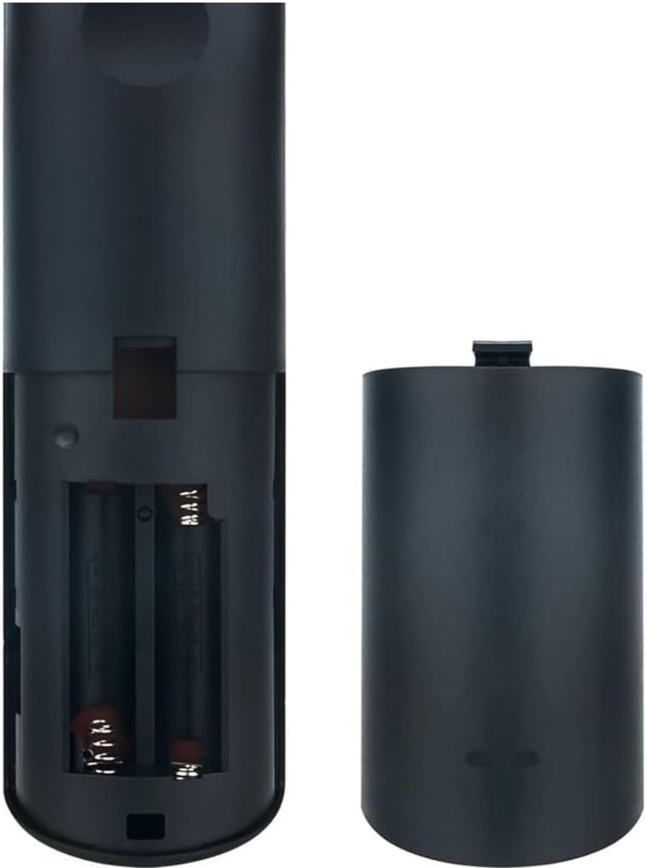
Image 4.1: Rear view of the remote control with the battery compartment open, showing the correct orientation for battery insertion.