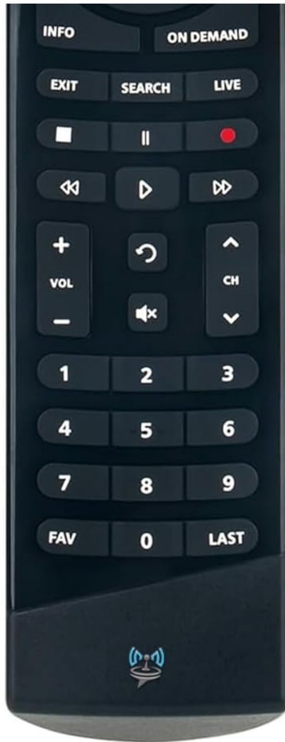
Image 1.1: Front view of the SatelliteSale Replacement Remote Control. This image displays the full layout of the remote's buttons and its ergonomic design.