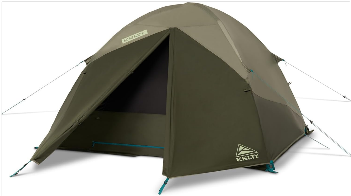
Image: Kelty Daydreamer 4 Person Tent fully set up with rainfly in a natural outdoor setting.