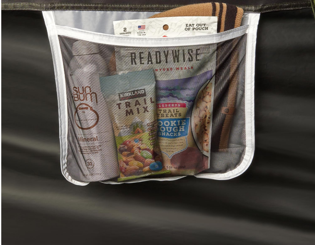
Image: An interior shot of the Kelty Daydreamer tent, highlighting the Nightlight gear loft which diffuses light from a placed light source.

Two easy to find white pockets stand out in the darkness