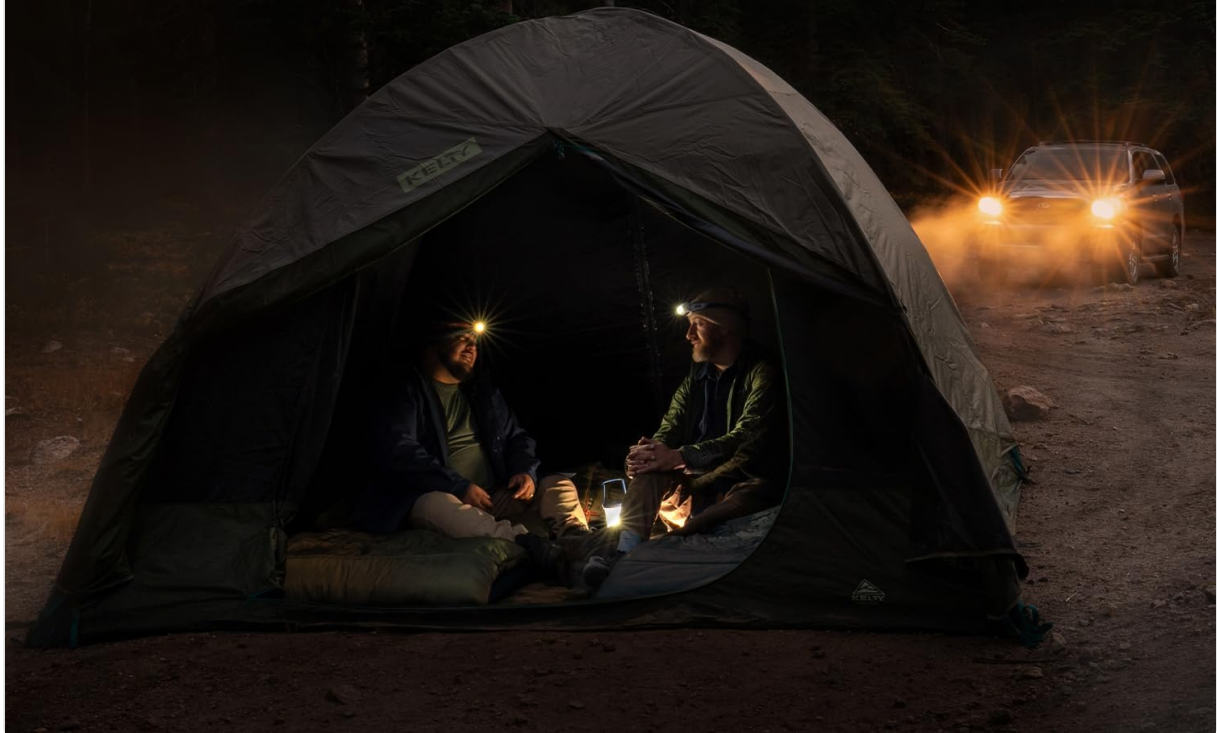
Image: The Kelty Daydreamer tent at dusk, with two people inside, illustrating how the Twilight Tech rainfly effectively blocks light from external sources like car headlights.