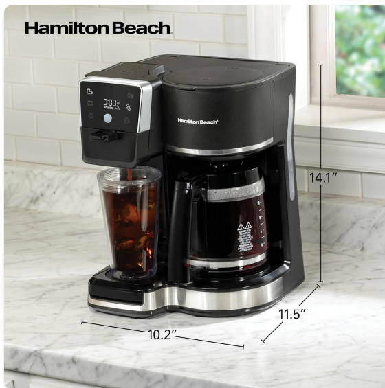
Image 7: Compact Design. The coffee maker's dimensions are 11.5"D x 10.2"W x 14.1"H, designed to fit easily on most countertops.

The coffee maker automatically turns off after 4 hours, providing peace of mind.