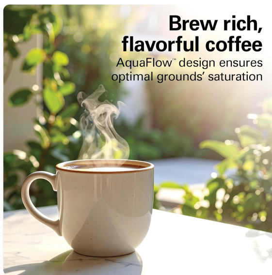
Image 1: AquaFlow Showerhead. The unique AquaFlow showerhead ensures optimal saturation of coffee grounds for a rich, flavorful brew.