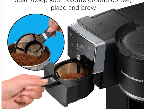
Image 5: Simple Single-Serve Brewing. Just scoop your favorite ground coffee into the reusable mesh filter, place, and brew.

Just scoop your favorite ground coffee, place and brew