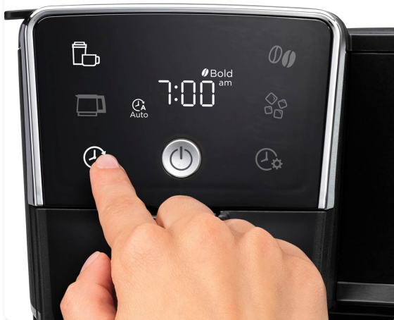
Image 4: Intuitive Touch Display. The easy-to-use touchscreen allows for programming up to 24 hours in advance.