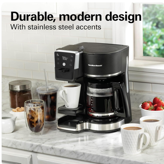
Image 9: Durable, Modern Design. The coffee maker features a sleek black finish with stainless steel accents, complementing any kitchen decor.