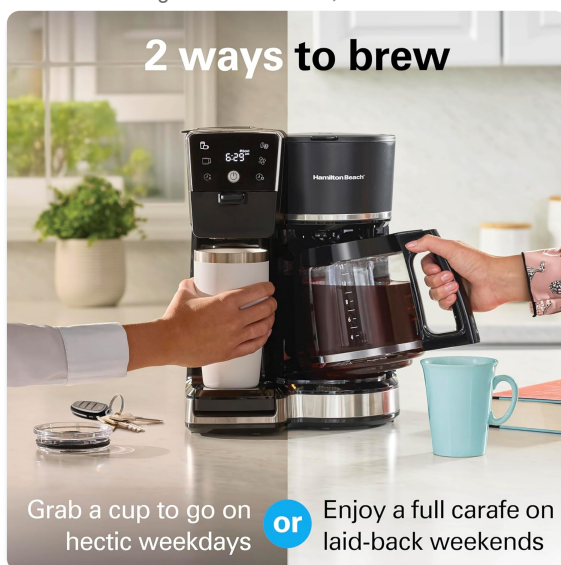
Image 2: Two Ways to Brew. Easily switch between brewing a single cup for on-the-go or a full carafe for multiple servings.