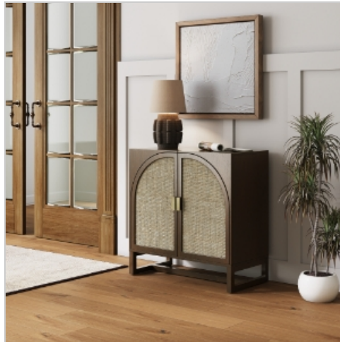
Figure 3: Detailed view of the cabinet's construction, emphasizing the arch door design and quality wood veneer frame.