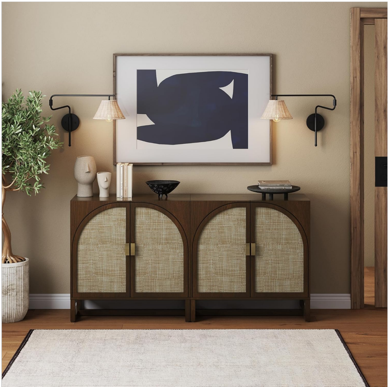
Figure 1: The Nathan James Paxton Boho Wood TV Stand (Set of 2) in a typical home environment.