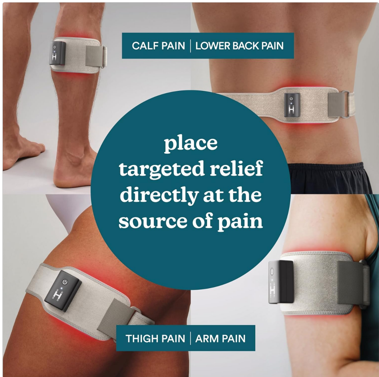
Image: The HoMedics Therapy Wrap shown applied to different body areas including the calf, lower back, thigh, and arm, demonstrating its versatility for targeted pain relief.