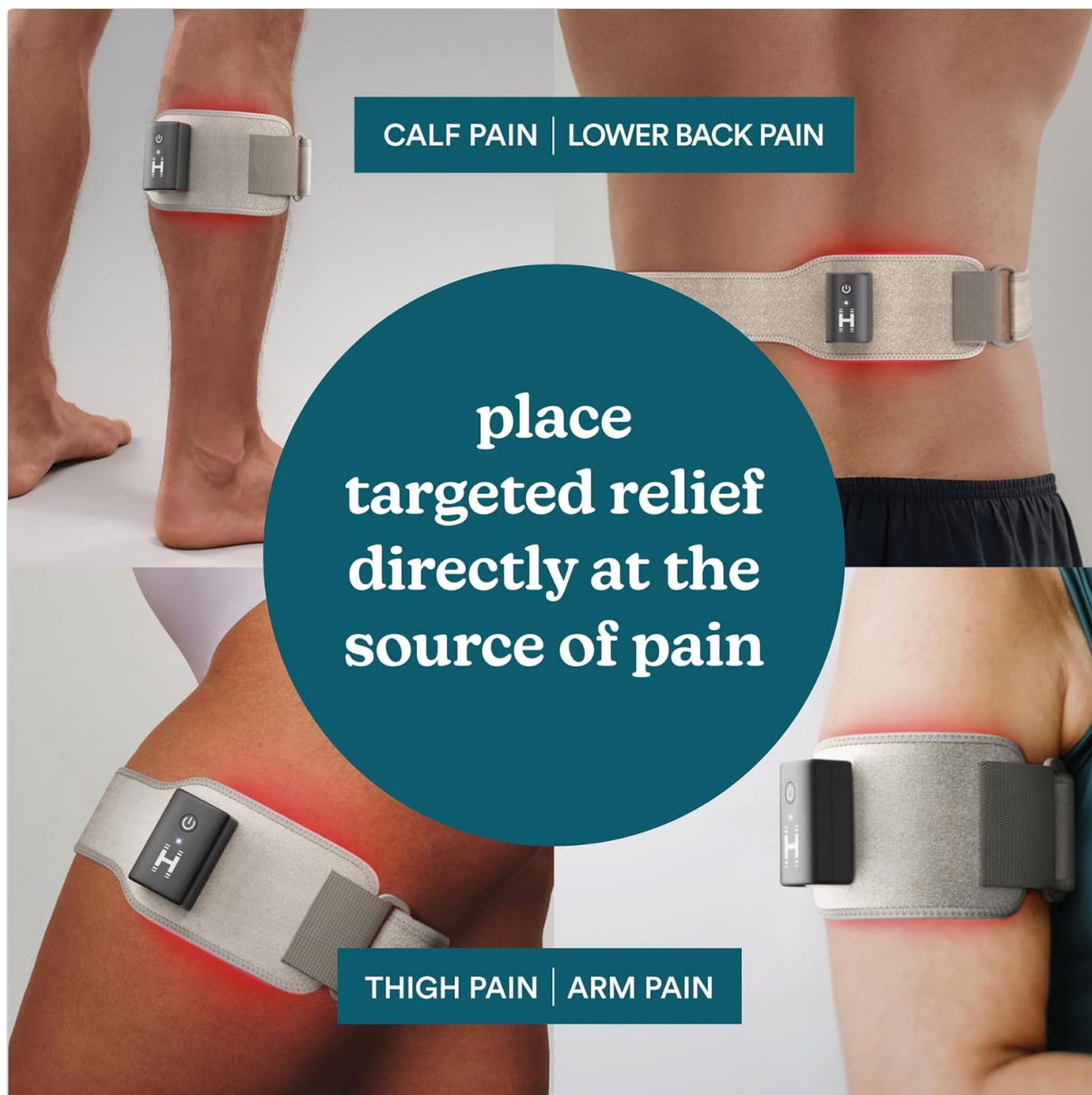
Image: The HoMedics Infrared + Red Light Pain Therapy Wrap shown securely fastened around a person's calf, demonstrating its adjustable design for targeted application.