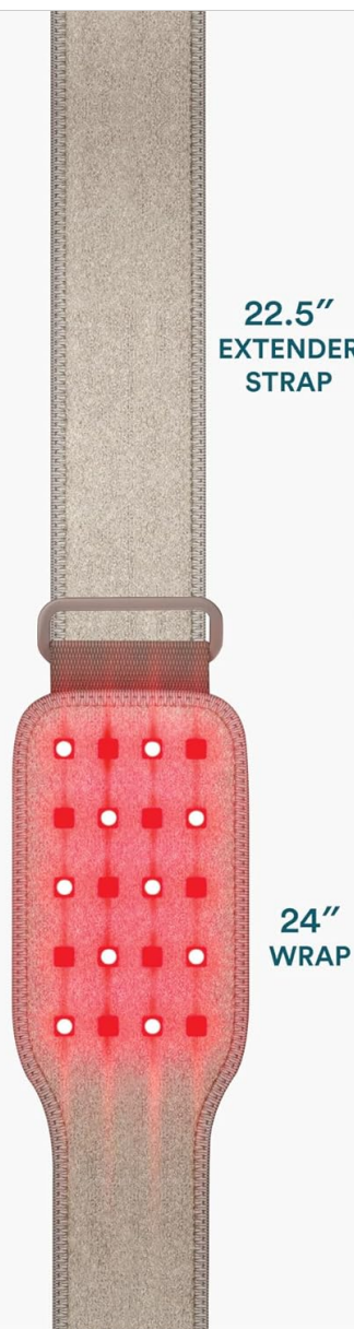
Image: A detailed diagram illustrating the key features of the HoMedics Therapy Wrap, including 20 high-powered LEDs, soothing heat, a rechargeable battery with 2.5-hour runtime, and an adjustable wrap with a 22.5-inch extender strap.

MEASURES 24" & INCLUDES A 22.5" EXTENDER STRAP FOR ADDITIONAL LENGTH & FLEXIBLE SIZING