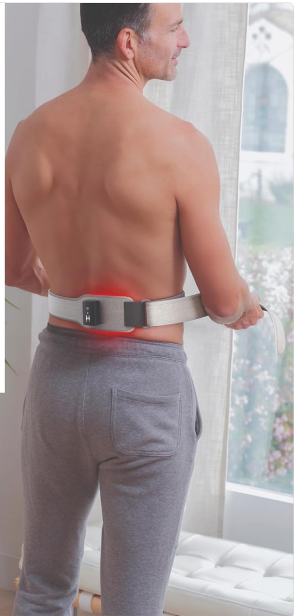
Image: A man wearing the HoMedics Therapy Wrap around his lower back, secured with an extender strap, illustrating its use for larger body areas.

DESIGNED TO PROVIDE TARGETED RELIEF FOR LARGER AREAS, LIKE THE LOWER BACK & ABDOMEN