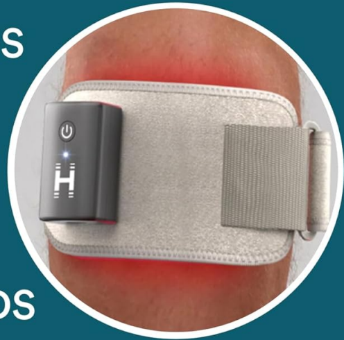
Image: A close-up view of the HoMedics Therapy Wrap, highlighting the arrangement of 10 infrared (850 nm) and 10 red light (660 nm) LEDs, which work together for effective therapy.

TARGETS SURFACE LAYERS OF SKIN & UNDERLYING TISSUE