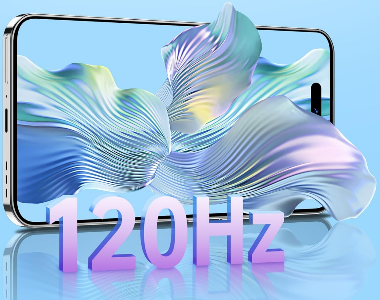
Figure 2: Display Specifications (Resolution, Size, Brightness, Aspect Ratio)

Your browser does not support the video tag.