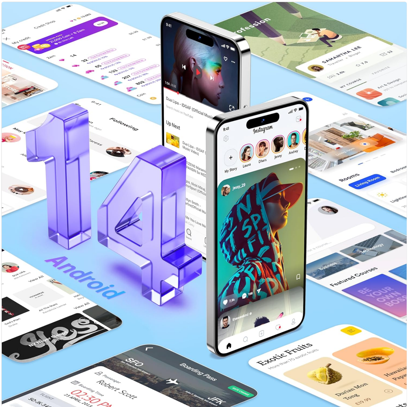
Figure 8: Android 14 Operating System

3. The OUKITEL P1 runs on Android 14, offering an intuitive and customizable user experience.