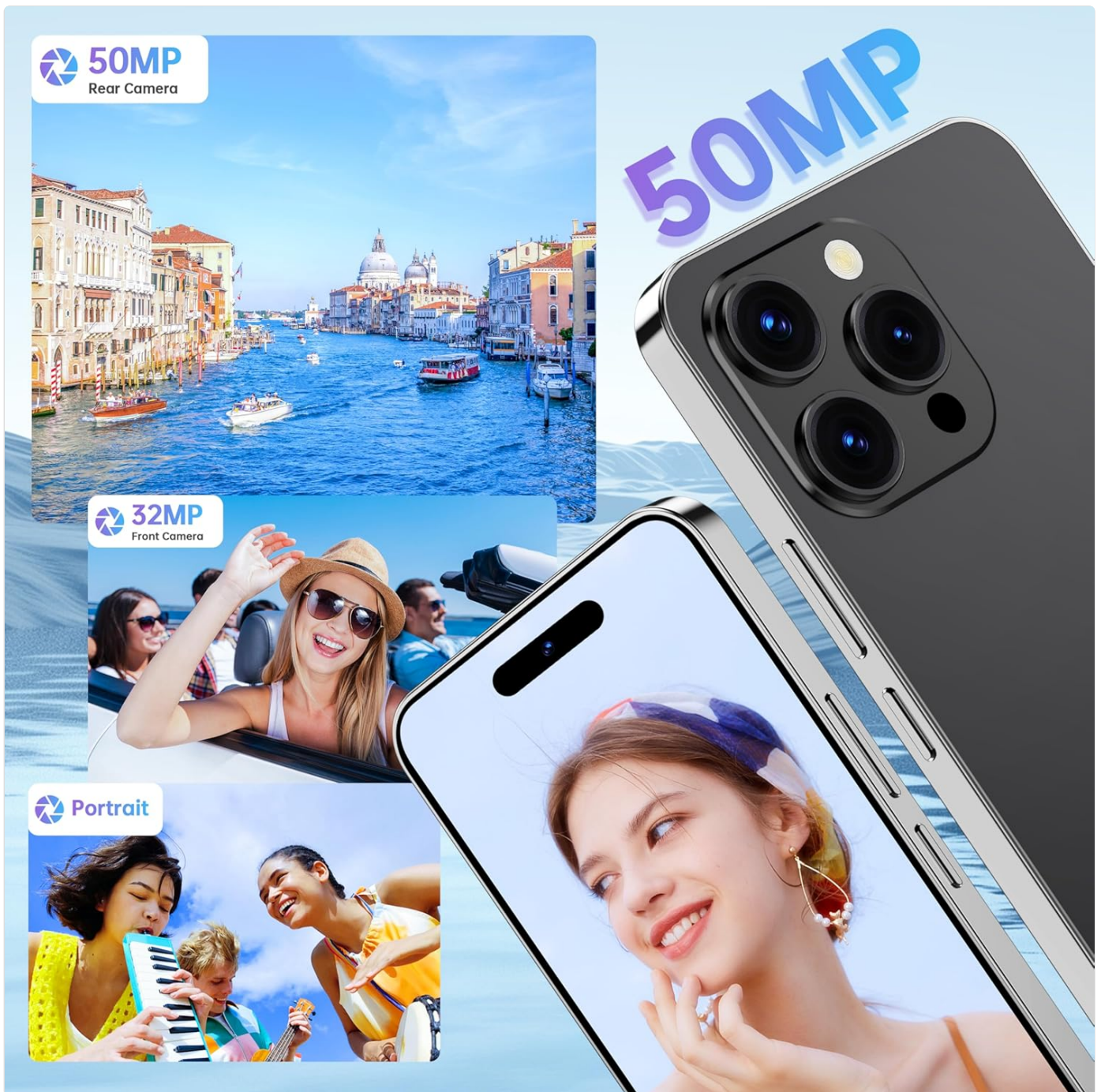
Figure 5: Camera System Overview