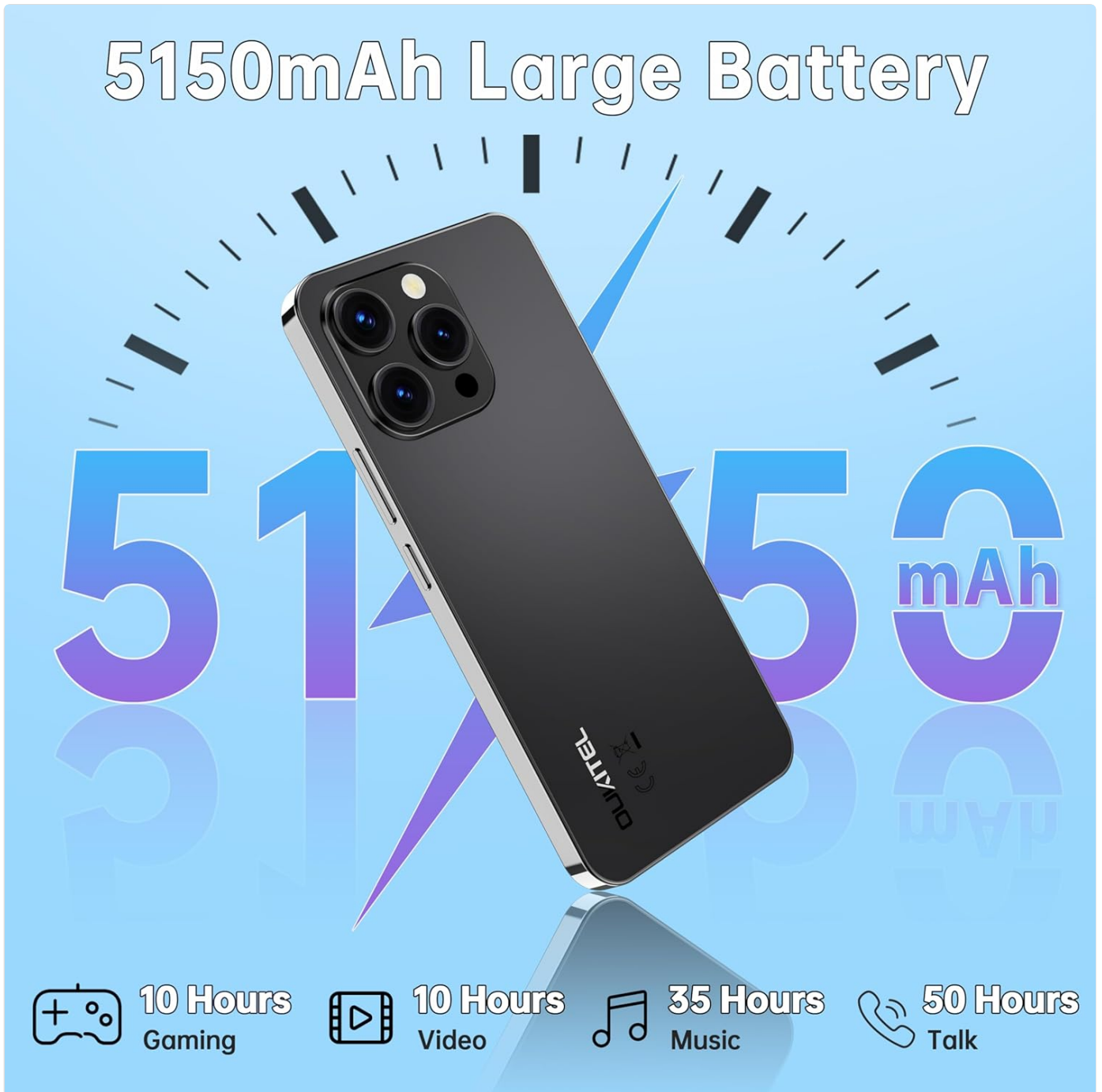
Figure 6: Battery Performance