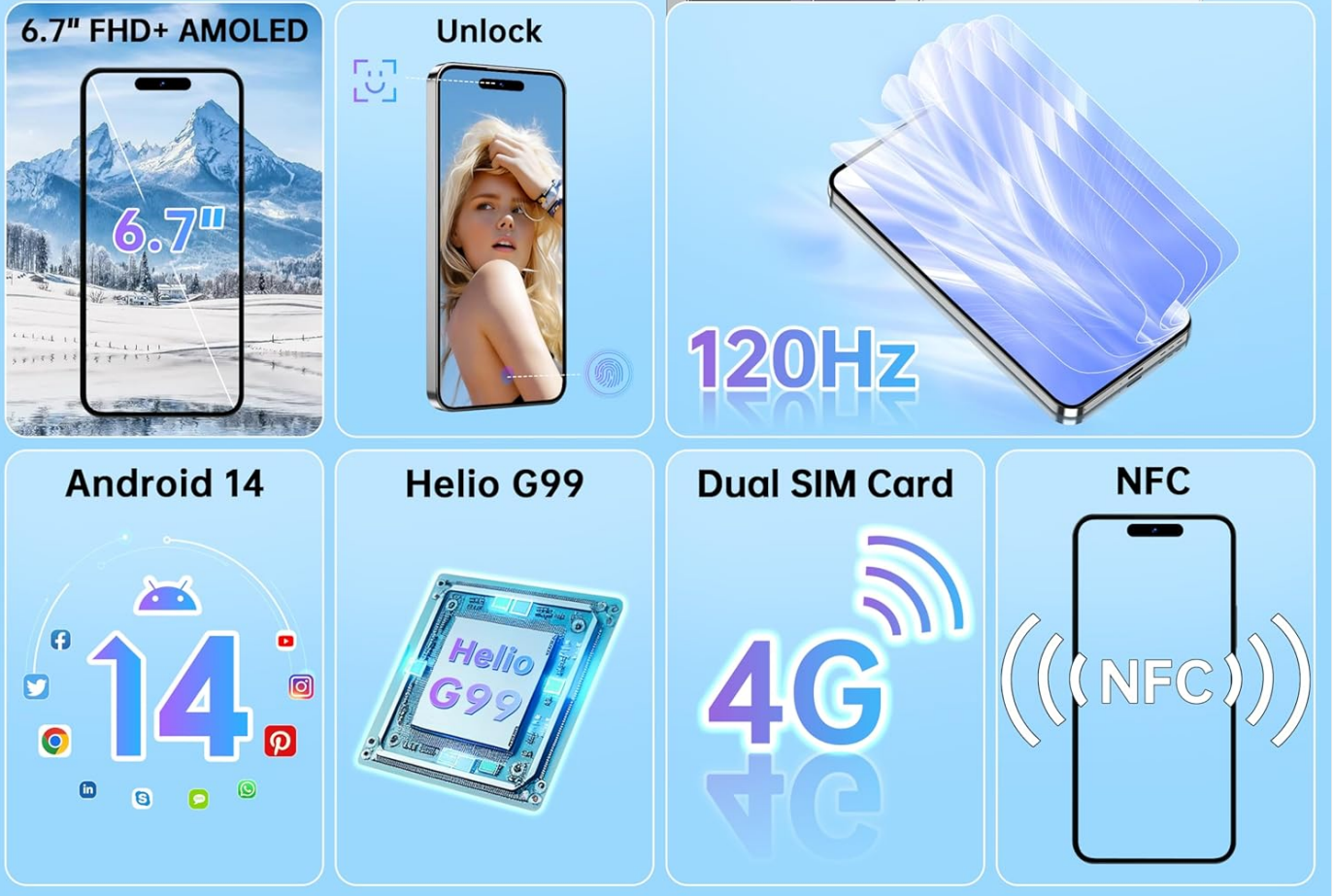
Figure 7: Key Features Summary