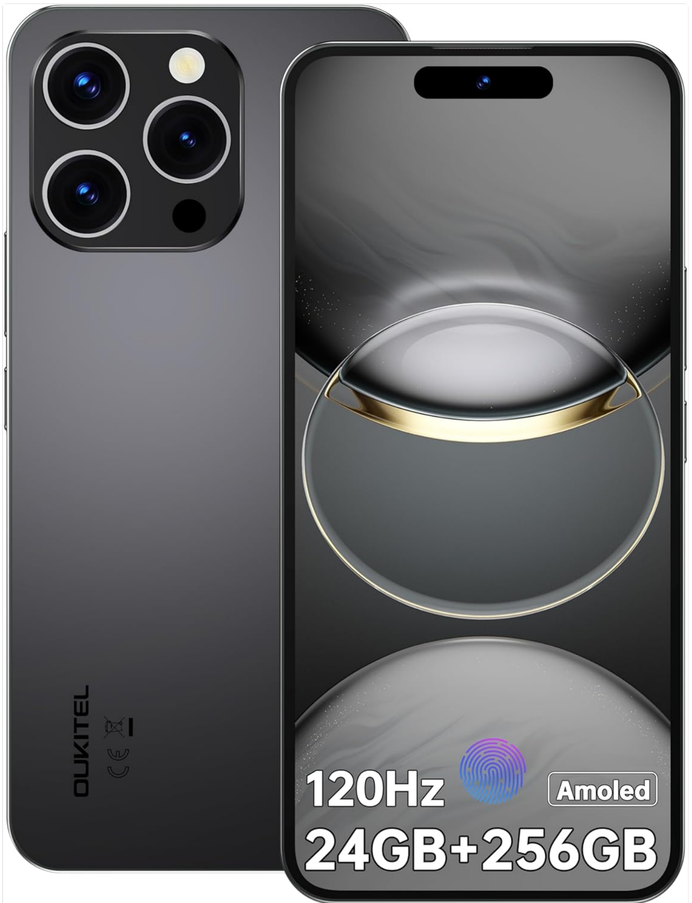
Figure 1: OUKITEL P1 Smartphone