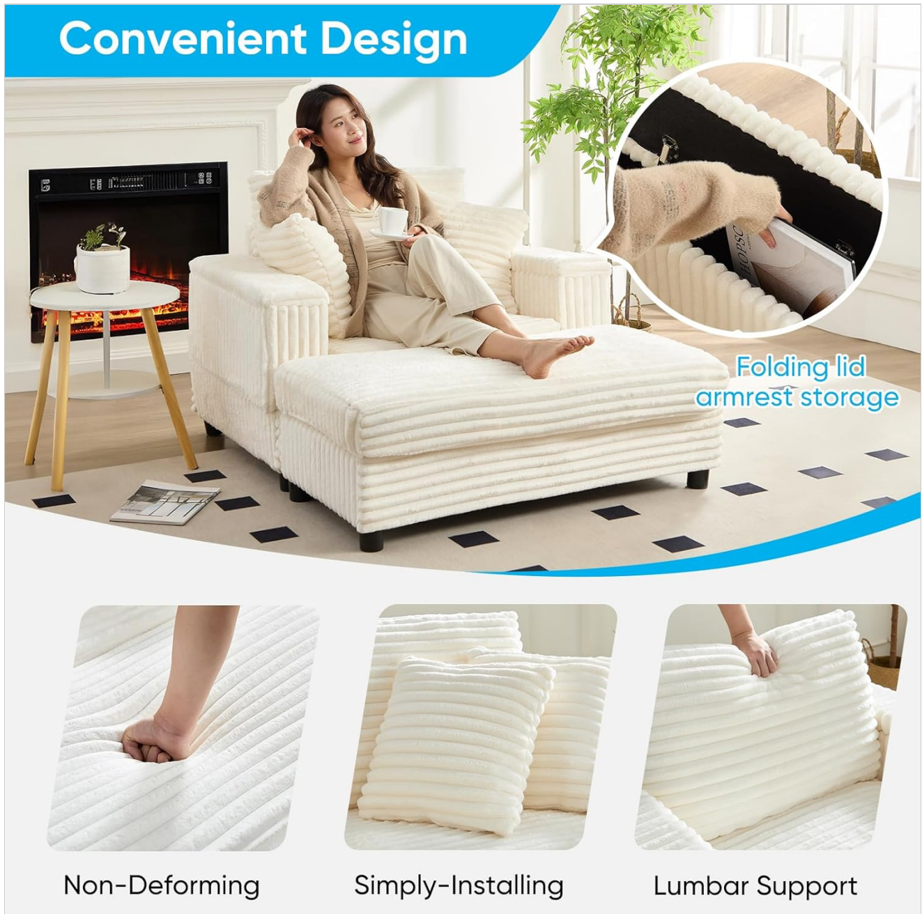
Figure 3: Convenient design with armrest storage and comfortable seating.