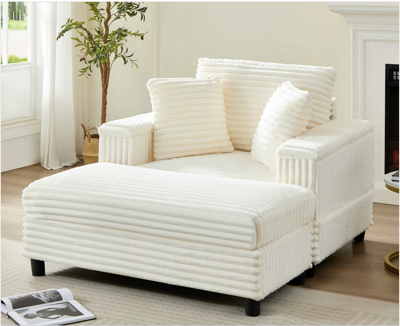
Figure 1: Mjkone 43" W Oversized Chaise Lounge Chair with Ottoman in Beige.