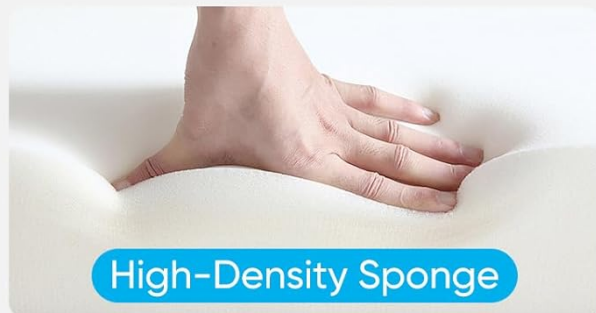
Figure 5: Ergonomic design with corduroy fabric and high-density sponge.