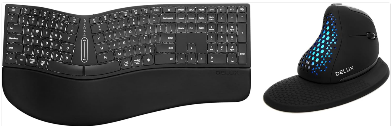
Image: The DeLUX Wireless Ergonomic Keyboard and Vertical Mouse Combo, showcasing the split keyboard design and the unique vertical mouse.

The DeLUX Wireless Ergonomic Keyboard and Mouse Combo is designed to provide a comfortable and efficient computing experience. This combo includes a full-size backlit split keyboard and a vertical mouse with an integrated OLED screen, offering advanced features for enhanced productivity and user comfort.