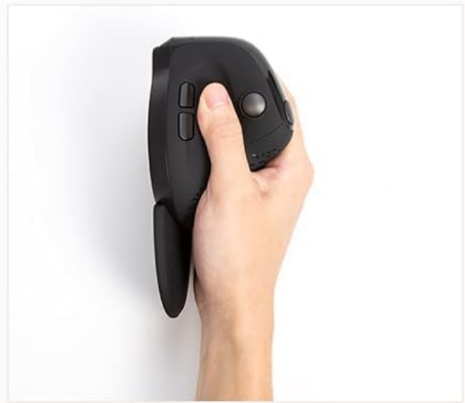
Image: A hand using the DeLUX vertical mouse on a mousepad, with a graph illustrating the benefit of higher DPI in reducing hand movement and fatigue.