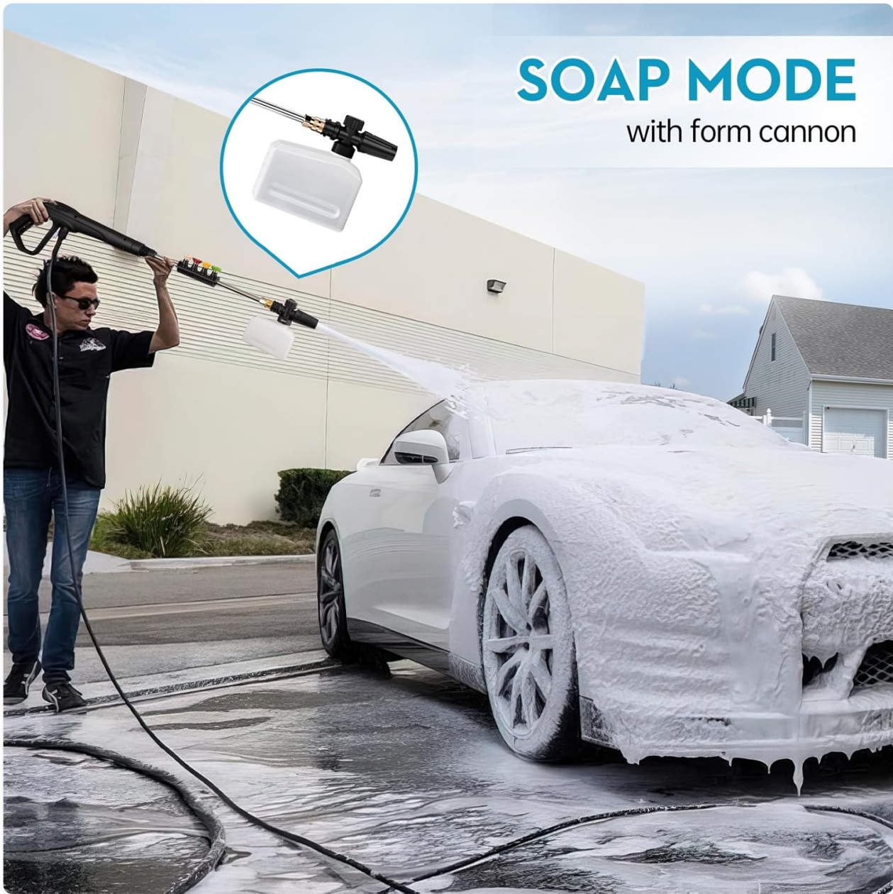
Figure 5.2: Applying foam with the soap mode and foam cannon.