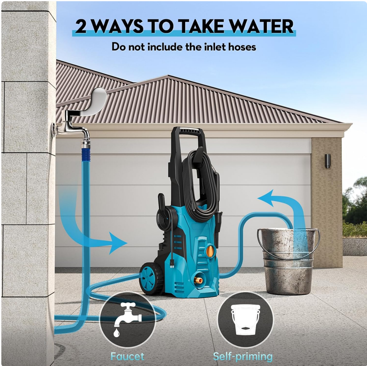
Figure 4.1: Visual guide for easy installation of the pressure washer components.