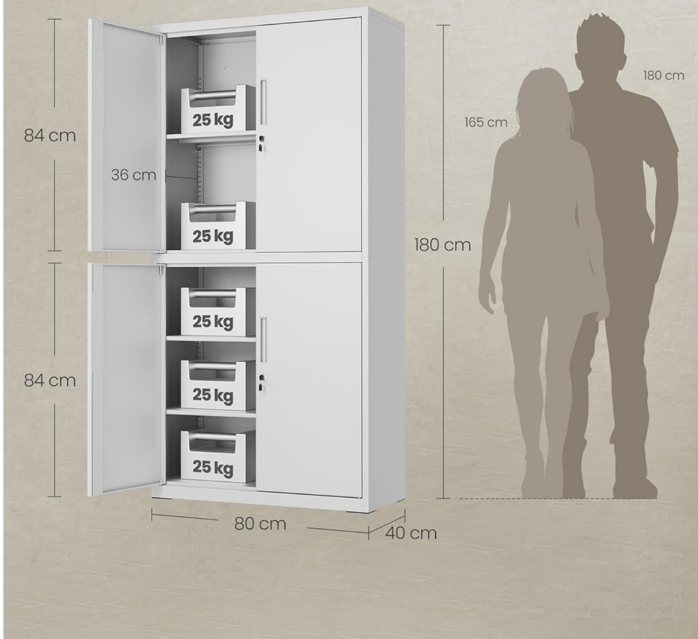
Image: A detailed diagram illustrating the cabinet's dimensions (40x80x180 cm) and its impressive total load capacity of 125 kg, with each shelf supporting up to 25 kg.