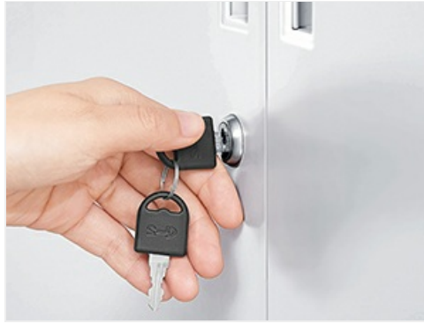
Image: A close-up shot of a hand using a key to operate the cabinet's locking mechanism, highlighting the security feature.