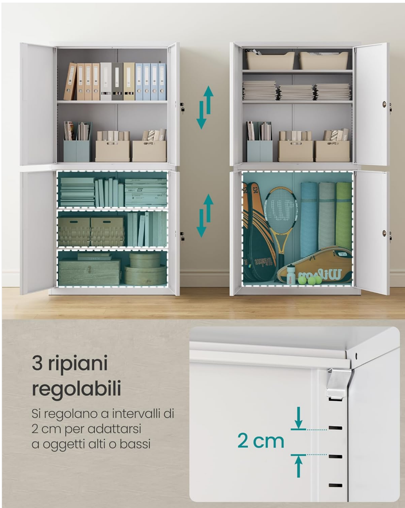
Image: An illustration demonstrating the adjustable nature of the shelves, showing how they can be moved to different heights to optimize storage space for various items.