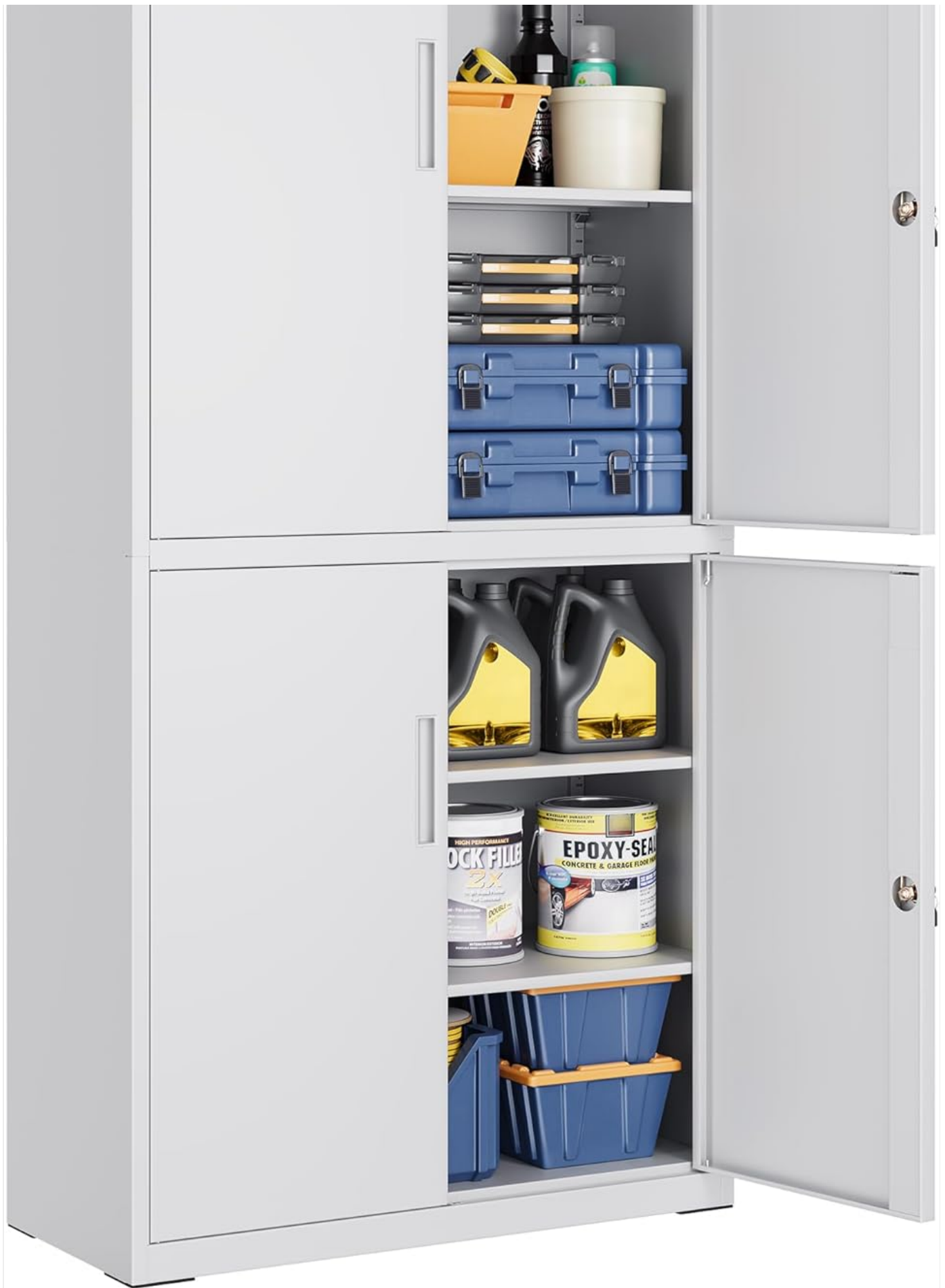
Image: The SONGMICS metal storage cabinet with its four doors open, showcasing its spacious interior and organized shelves filled with various items.