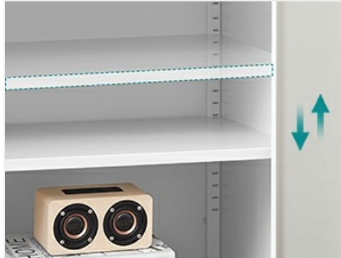
Image: A detailed view of the adjustable shelf mechanism, illustrating how shelves can be repositioned to accommodate items of varying sizes.