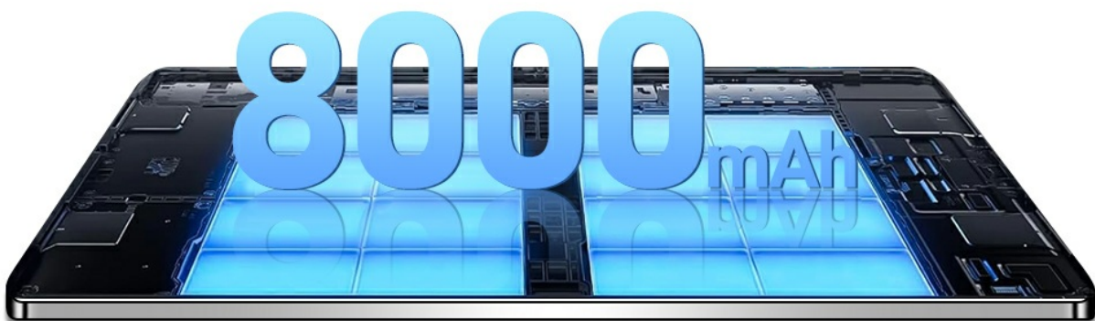
Figure 3.4: Long-lasting Battery. Equipped with an 8000 mAh battery, the tablet provides extended usage times, estimated at 7 hours for gaming, 8 hours for movies, and 16 hours for music playback.