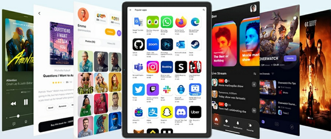
Figure 3.3: Memory and Storage. The tablet boasts 12GB of operating memory (RAM) and 256GB of internal storage (ROM), ensuring smooth multitasking and ample space for applications and media.