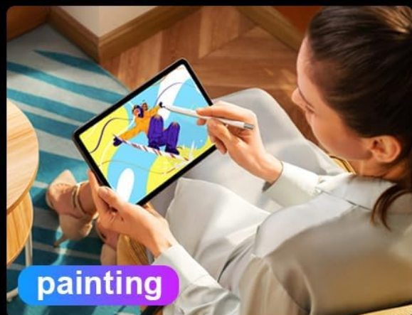
Figure 3.6: Versatile Usage Scenarios. This image illustrates the tablet's adaptability for various activities, including professional work, academic study, immersive gaming, and creative digital painting.