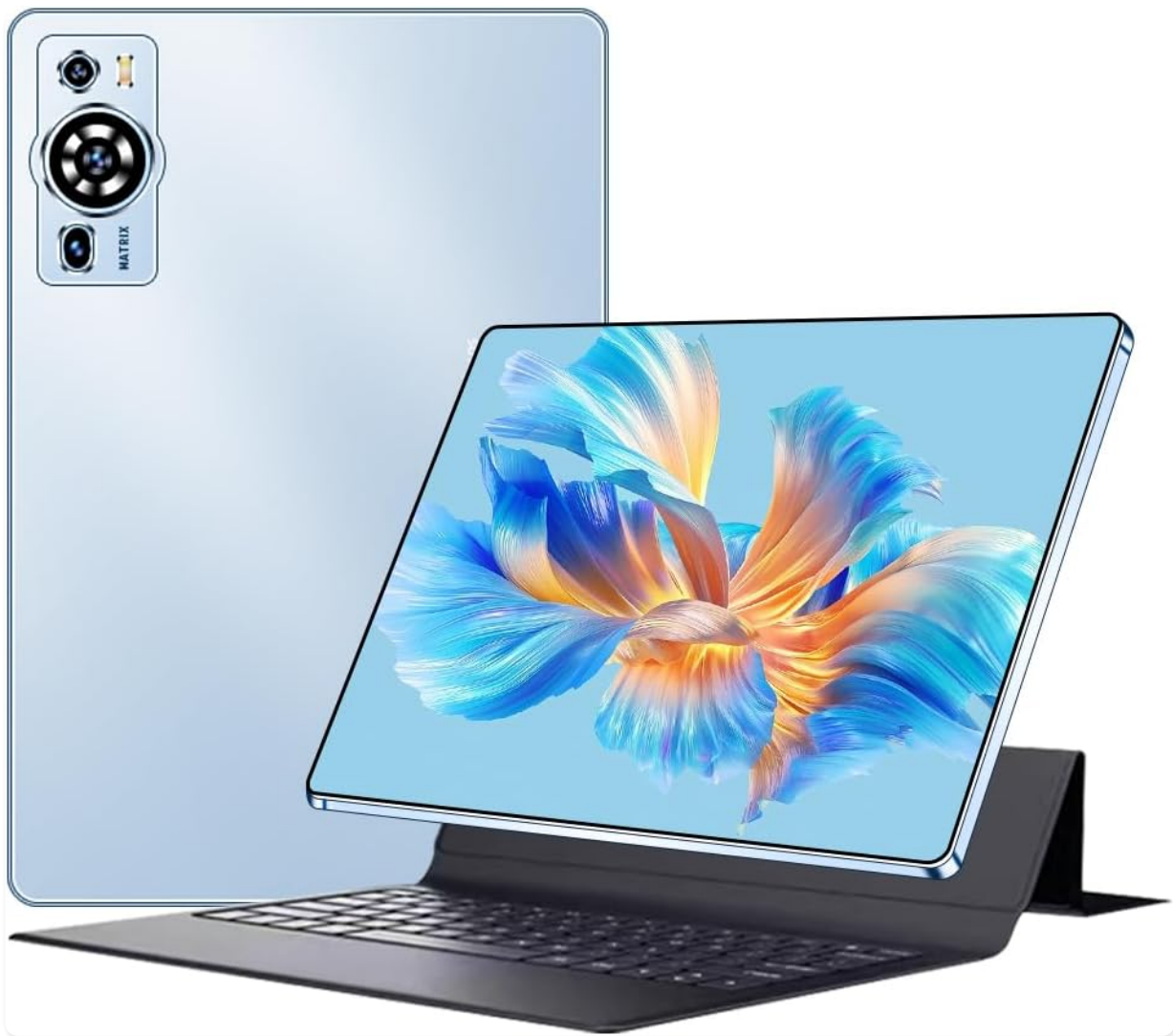
Figure 3.1: UXD 10-inch Android 13.0 Tablet. This image displays the tablet from the front, showcasing its vibrant display, and from the rear, highlighting the camera module. An optional keyboard case is also visible, suggesting versatility for productivity.