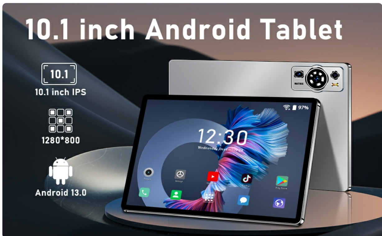
Figure 3.2: Key Features of the UXD Tablet. This image highlights the 10.1-inch IPS display, 1280x800 resolution, and