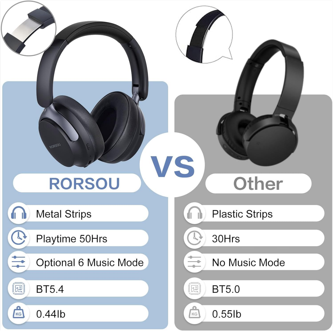
Image Description: A comparison graphic highlighting the features of RORSOU B8 headphones versus another brand. It emphasizes RORSOU's metal strips, 50 hours playtime, 6 music modes, Bluetooth 5.4, and lighter weight (0.44lb) compared to the other brand's plastic strips, 30 hours playtime, no music mode, Bluetooth 5.0, and heavier weight (0.55lb).