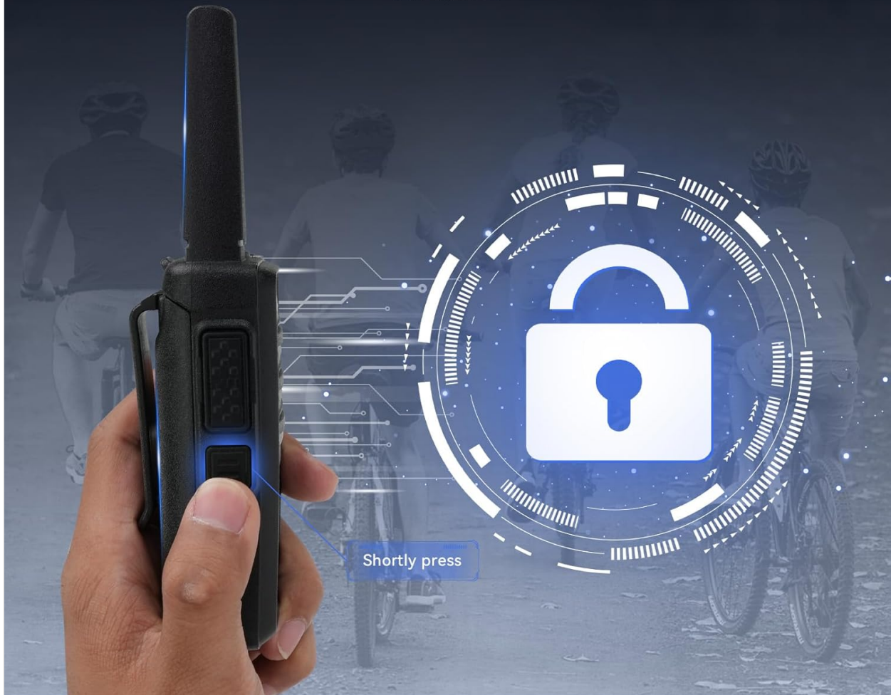
Image: This image demonstrates the Key Lock feature of the Retevis RT68H walkie-talkie. A hand is shown pressing a side button, indicating how to lock the current channel for uninterrupted communication.