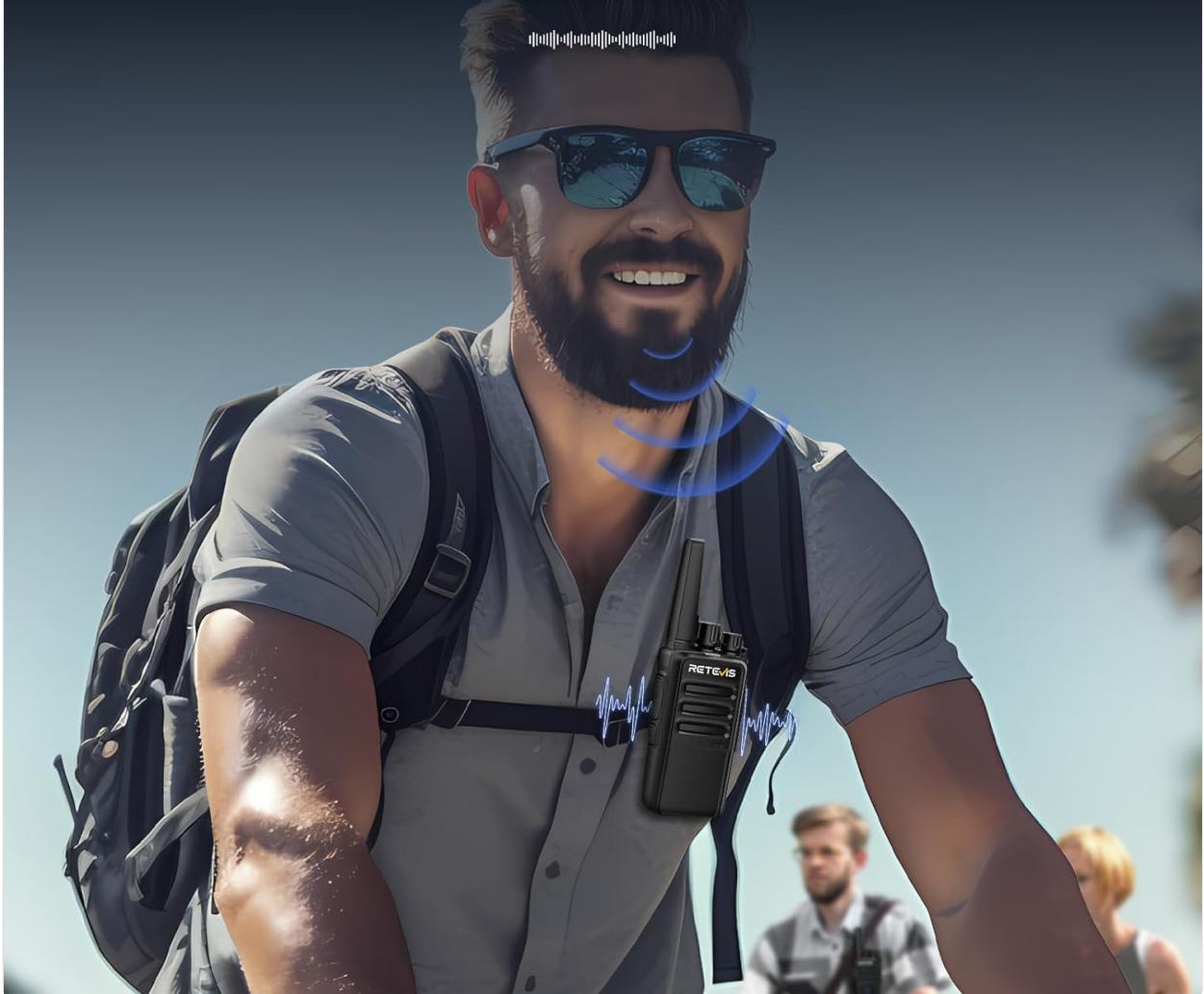
Image: A person is shown using the Retevis RT68H walkie-talkie hands-free, demonstrating the VOX function. The radio is clipped to their backpack strap, allowing for communication without manual operation.

Talk directly without pressing the PTT key