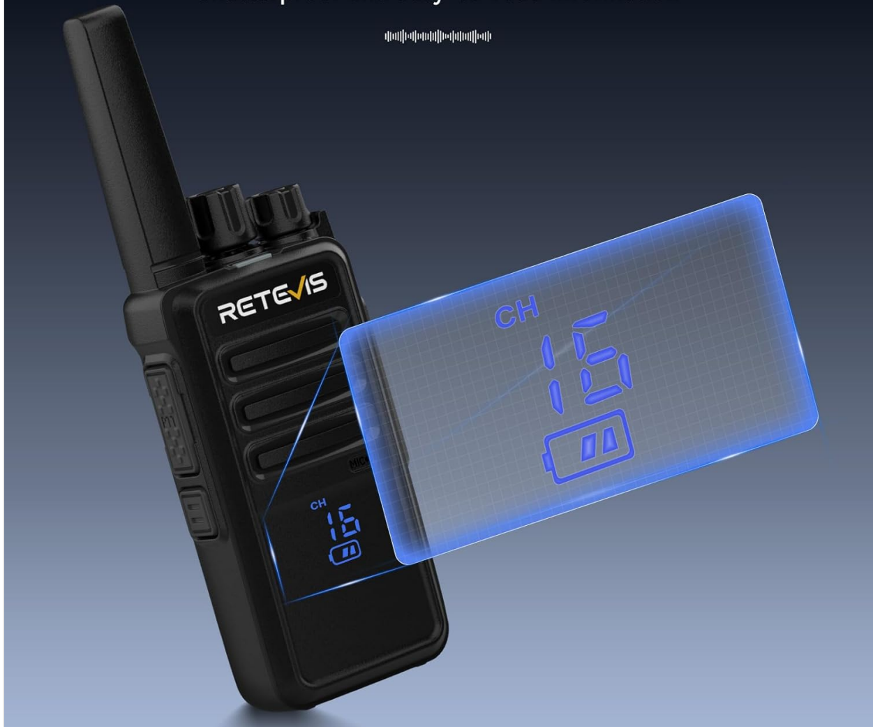
Image: The Retevis RT68H walkie-talkie is displayed, showcasing its Active View Display. The screen clearly shows the current channel and battery level, designed for easy readability.