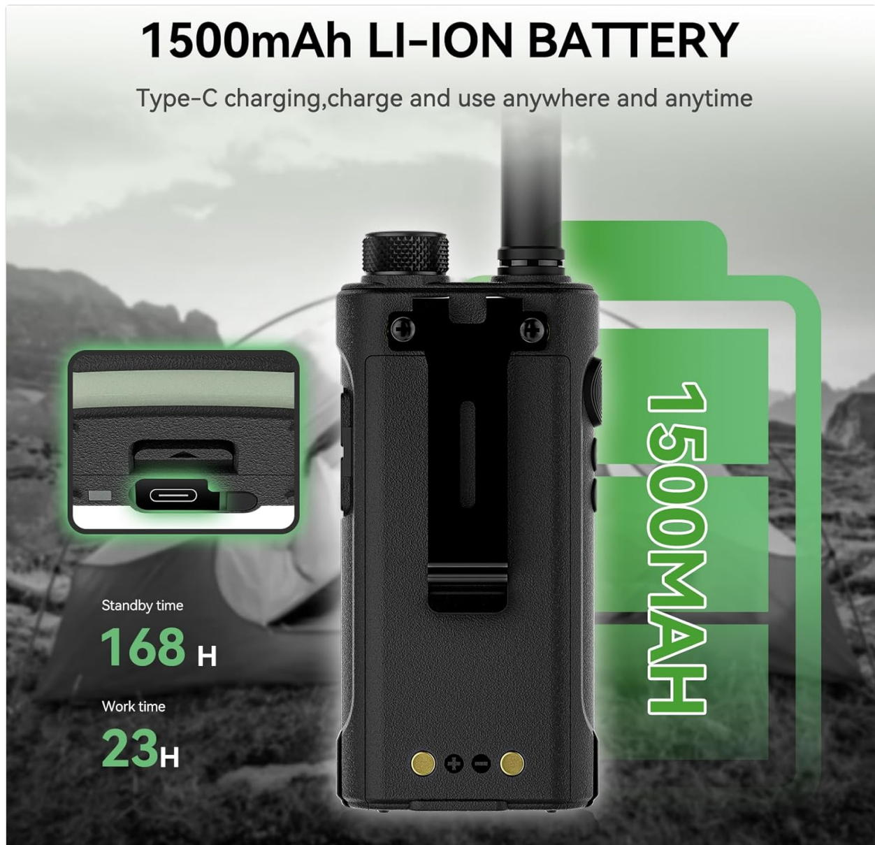
Image: This image showcases the RB66P walkie-talkie's 1500mAh Li-ion battery, emphasizing its long standby time of 168 hours and work time of 23 hours. The Type-C charging capability is also visible.

Image: The RB66P walkie-talkie is shown charging, illustrating its fast charging feature. It indicates that the RB66P charges to 100% in 1.5 hours, significantly faster than other models which take 3-4 hours.