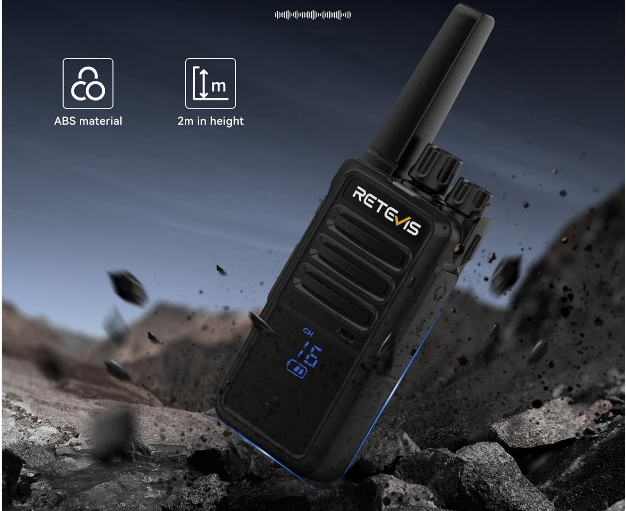
Image: The Retevis RT68H walkie-talkie is highlighted for its solid and durable construction from ABS material, designed to be wear-resistant and withstand drops from up to 2 meters.