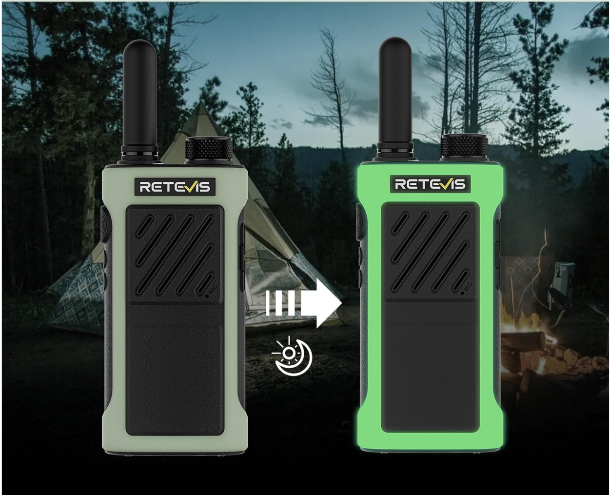
Image: This image demonstrates the fluorescent design of the Retevis RB66P walkie-talkie. It shows the radio's green casing glowing in the darkness, aiding in quick location during low-light conditions.

Help you quickly find the walkie talkie in the darkness