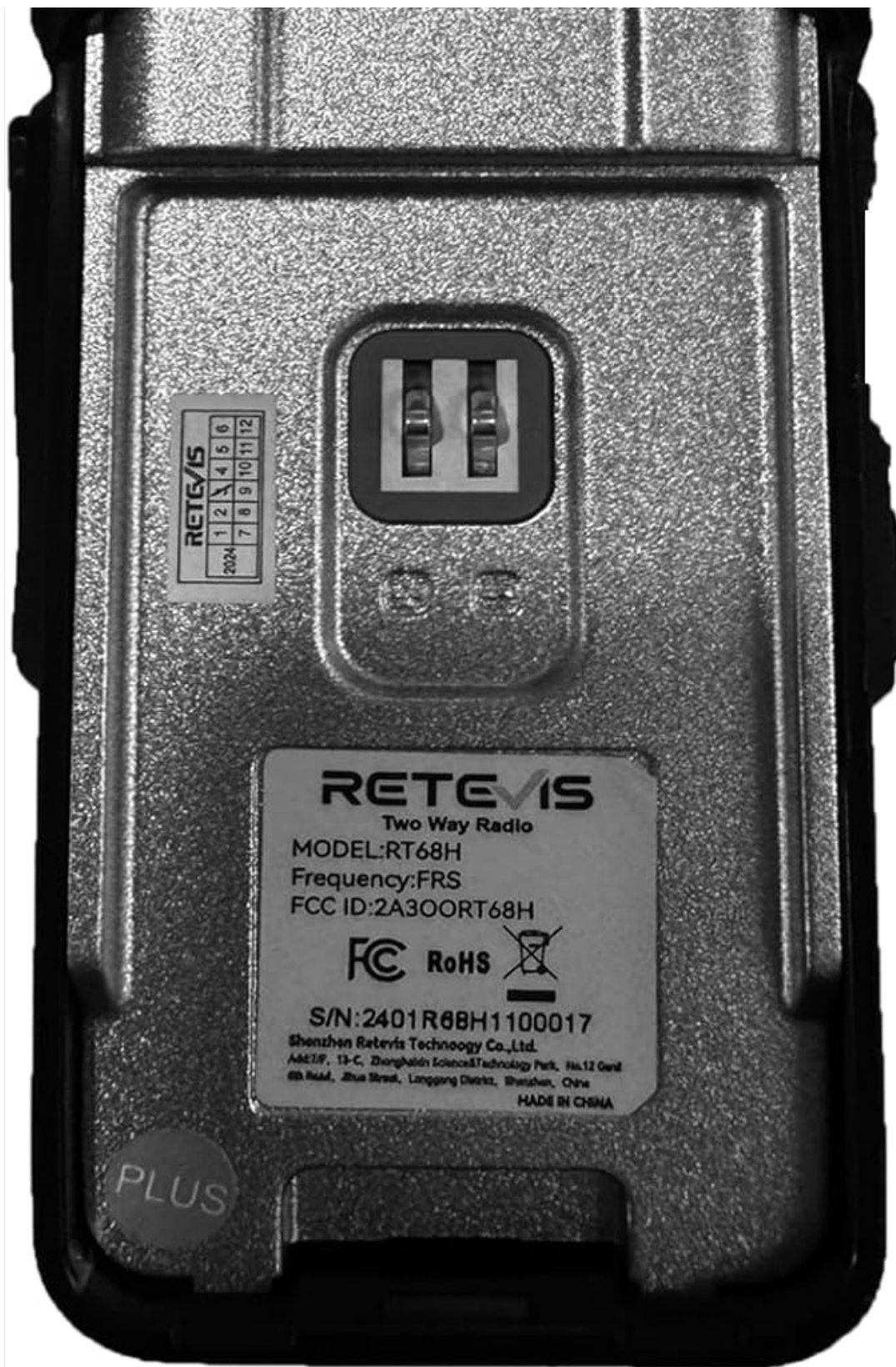
Image: A detailed view of the back of the Retevis RT68H walkie-talkie, clearly showing the model number (RT68H), frequency (FRS), FCC ID (2A3OORT68H), and manufacturing information.