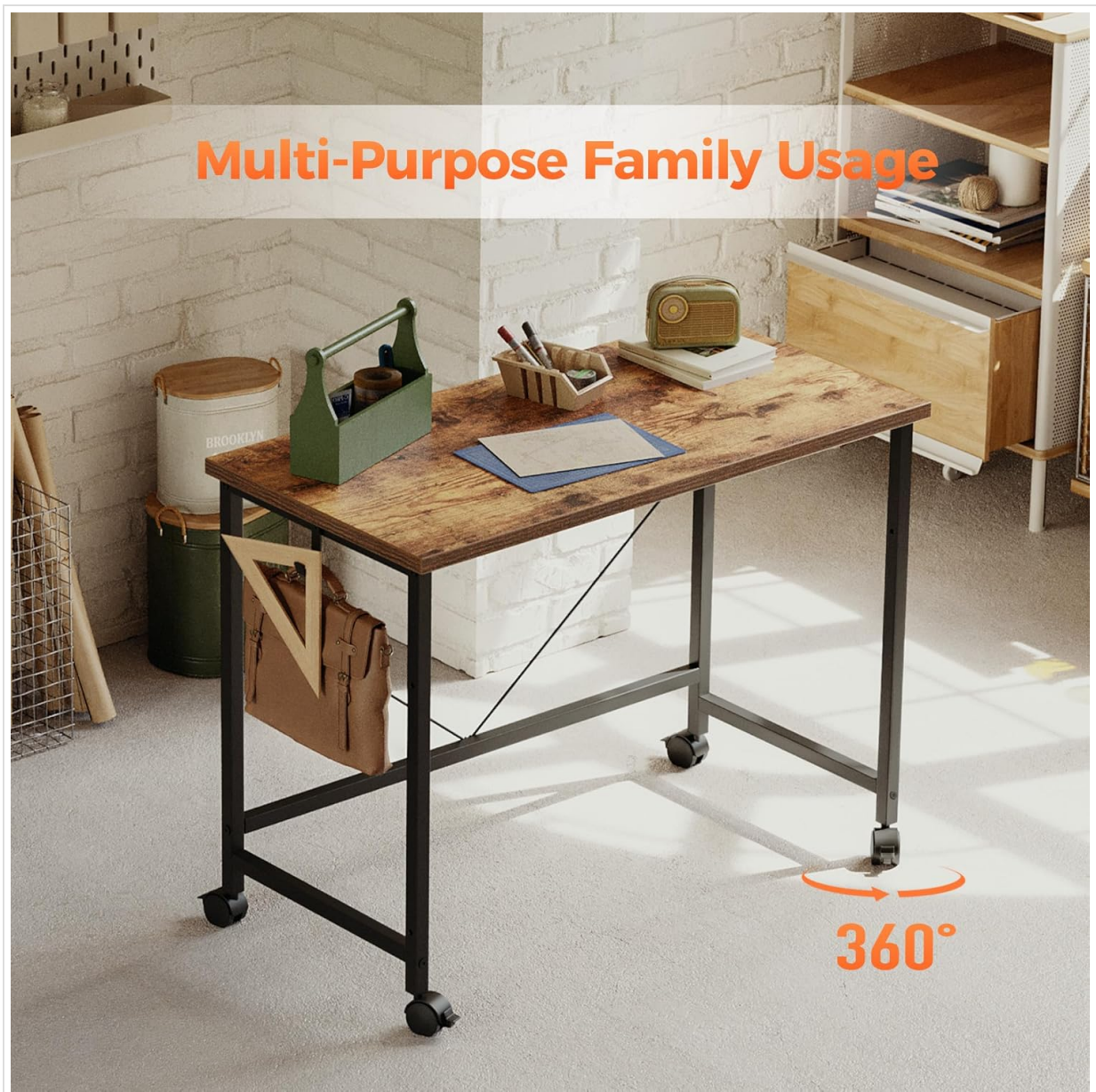
Image 3: The desk's 360-degree swivel casters allow for flexible placement and movement.