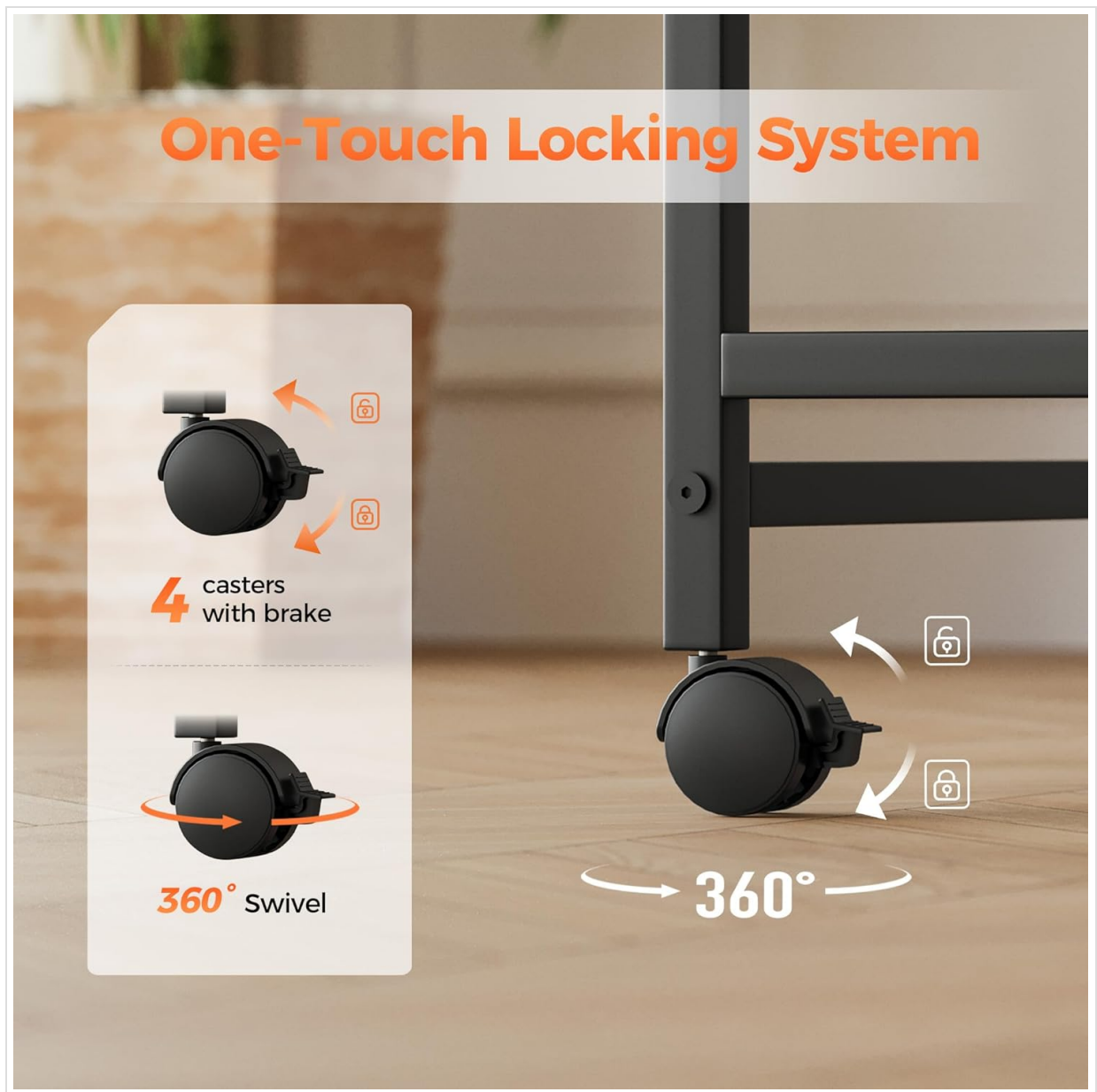
Image 2: Detail of the caster wheel with its one-touch locking system.