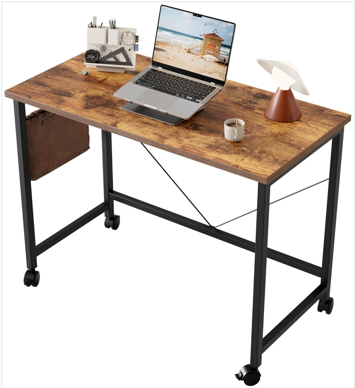
Image 1: Mericonia Rolling Computer Desk (32-inch, Rustic Brown) in a home office setting.