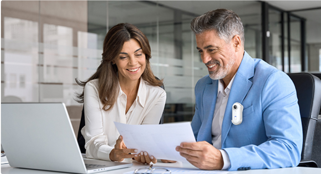
Image: A person wearing the BOBLOV W4 camera using the back clip, demonstrating its rotatable feature.