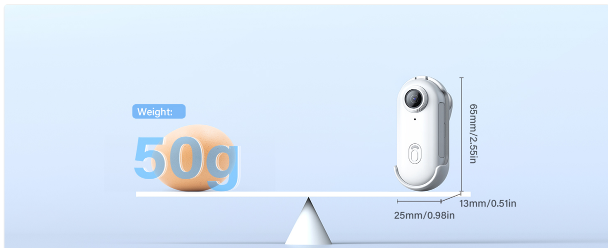
Image: Diagram showing the compact size and lightweight design (50g) of the BOBLOV W4 camera.