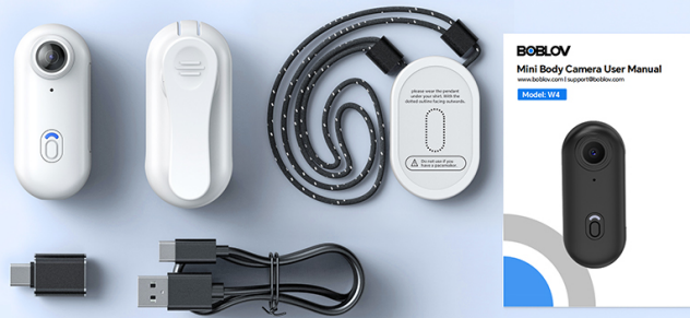
Image: All components included in the BOBLOV W4 package, including the camera, clips, cables, and manual.