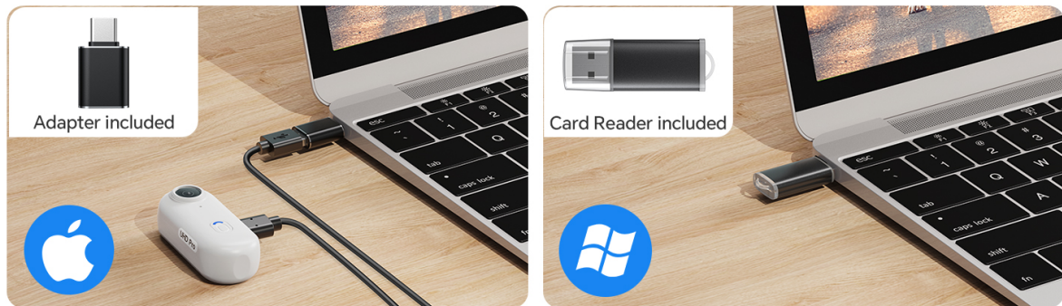
Image: The BOBLOV W4 camera connected to a laptop, demonstrating compatibility with both Windows and Mac systems for data transfer.