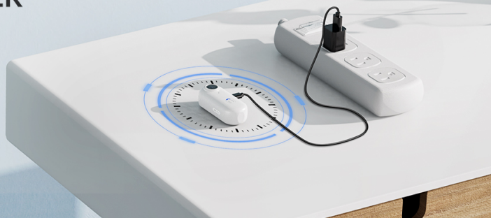
Image: The BOBLOV W4 camera connected via USB cable for charging, illustrating the charging process.

Experience 1.5-2 Hours of Continuous 2K Video Capture