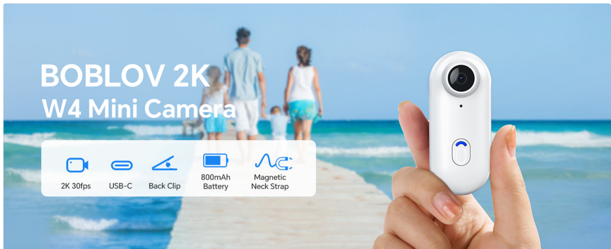
Image: The BOBLOV W4 2K Mini Body Camera, shown in a family setting, highlighting its use for capturing personal moments.

The BOBLOV W4 2K Mini Body Camera is a compact and lightweight wearable camera designed for capturing personal moments in high-resolution 2K video. Its user-friendly design, including one-click recording and versatile wearing options, makes it suitable for various daily activities. This manual provides essential information for setting up, operating, and maintaining your W4 camera.