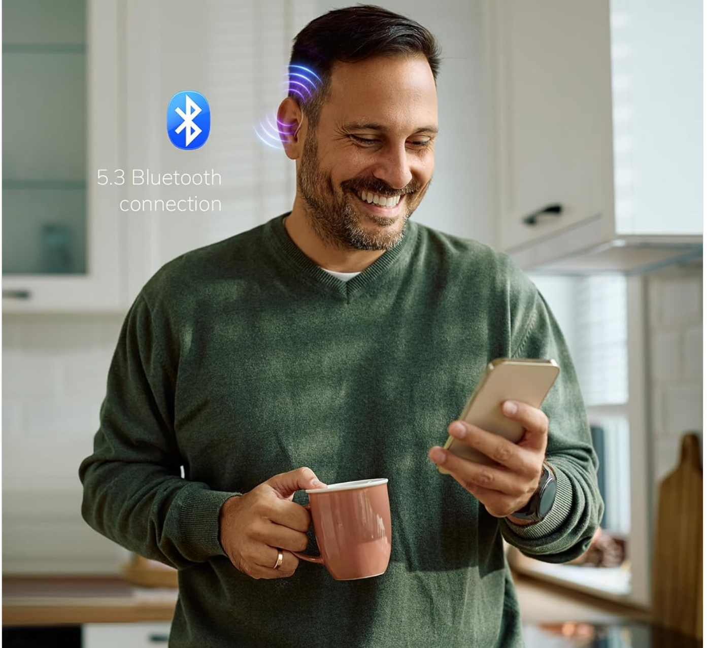
Image: A man smiling while holding a smartphone, with the ELEHEAR-Beyond hearing aids visible, demonstrating the ease of Bluetooth connectivity and app control.