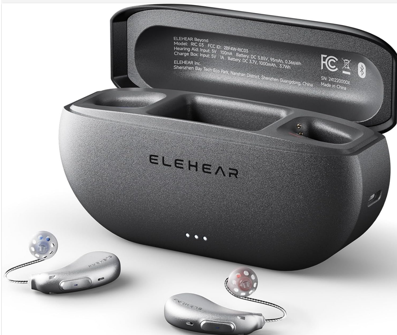
Image: The ELEHEAR-Beyond hearing aids neatly placed within their sleek, dark gray charging case, showcasing the compact design and

This manual provides comprehensive instructions for the setup, operation, and maintenance of your ELEHEAR-Beyond OTC Rechargeable Hearing Aids. Please read this manual thoroughly before using your device to ensure proper function and longevity.