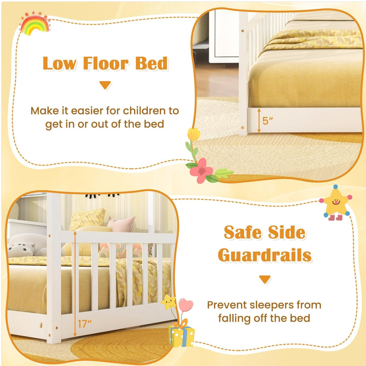
Image: Detail of low floor bed access and 17-inch safety guardrails.

The low-to-ground design makes it easier and safer for children to get in and out of bed independently, promoting Montessori principles of freedom of movement.