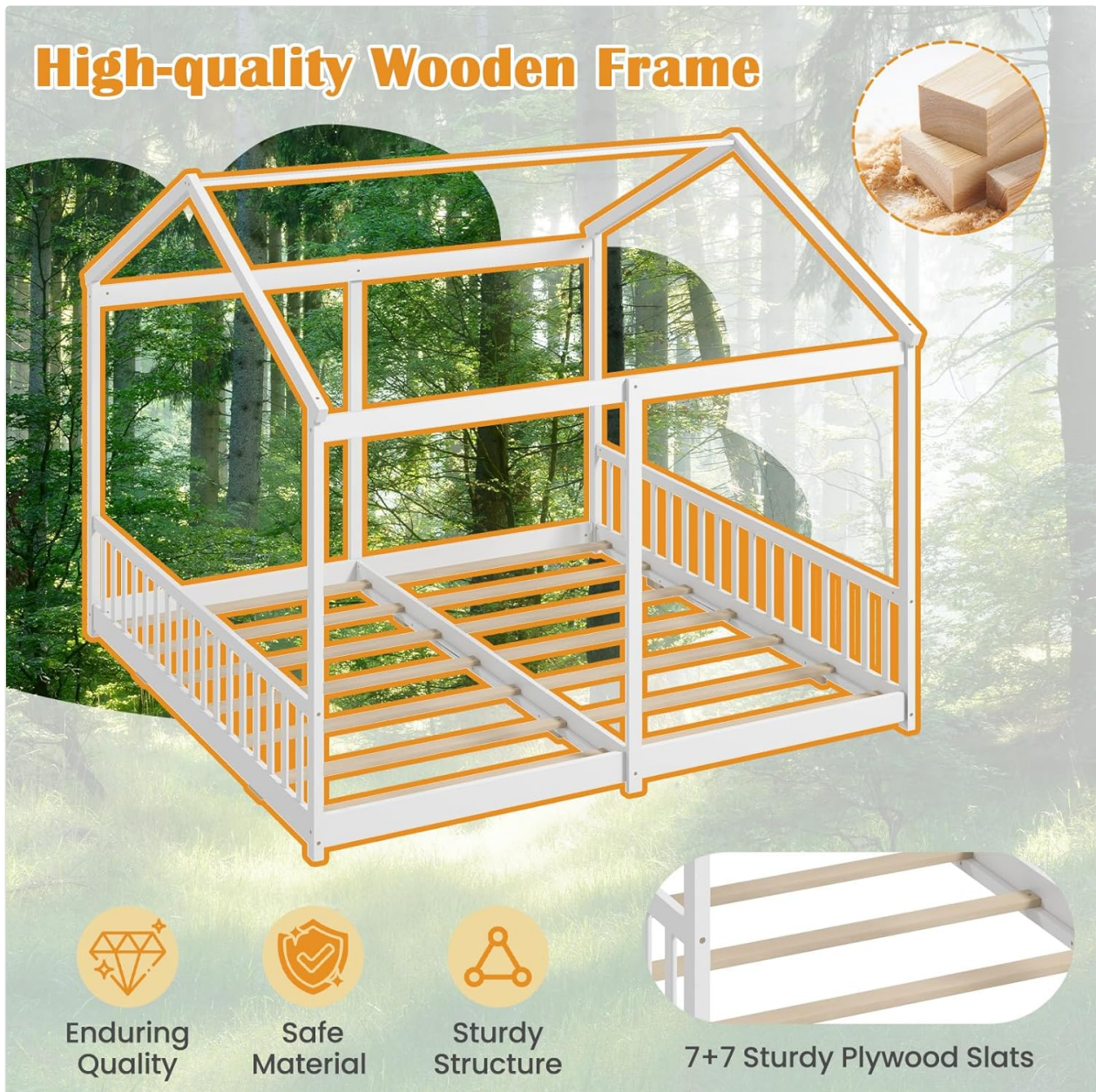
Image: High-quality wooden frame and slat support structure.

Assembly of the Giantex Double Twin Montessori Floor Bed is designed to be user-friendly. All necessary tools and clearly labeled parts are included in the package. Please refer to the separate detailed instruction manual provided with your product for step-by-step assembly guidance.