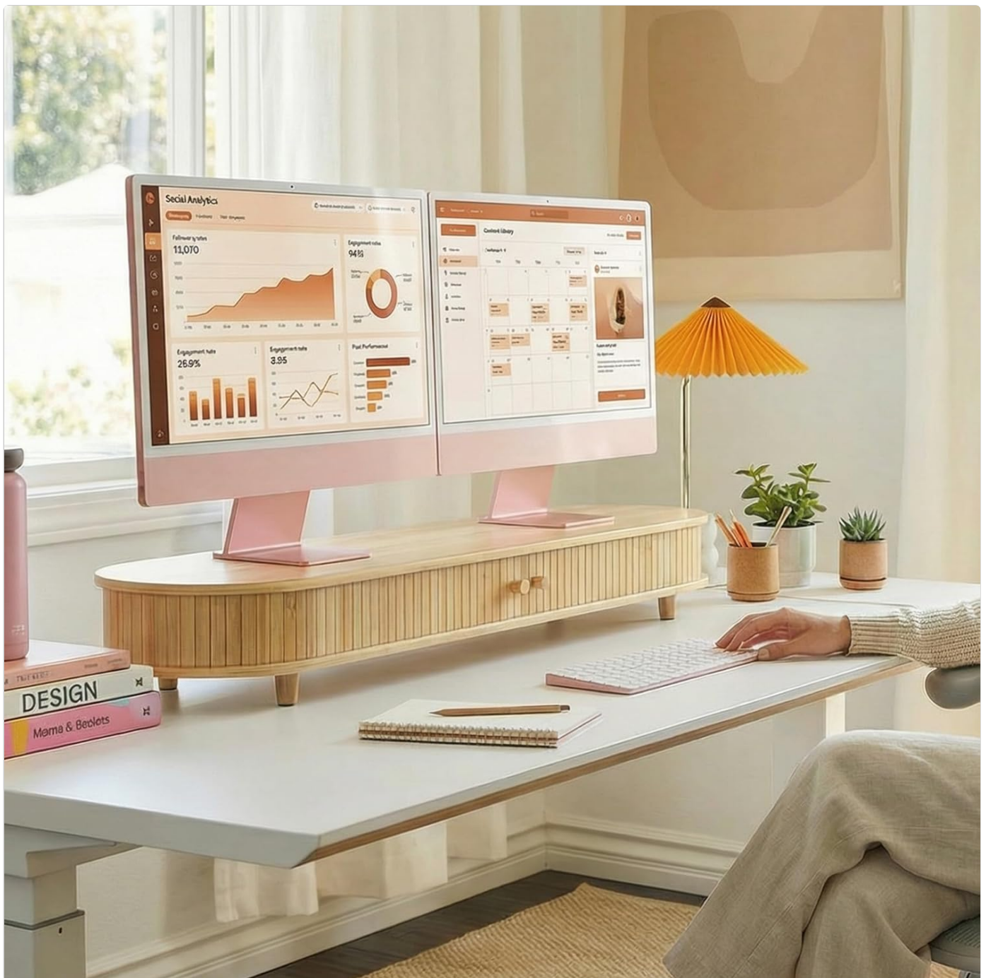
Image: The monitor stand in use, demonstrating its storage compartments and cable management features.