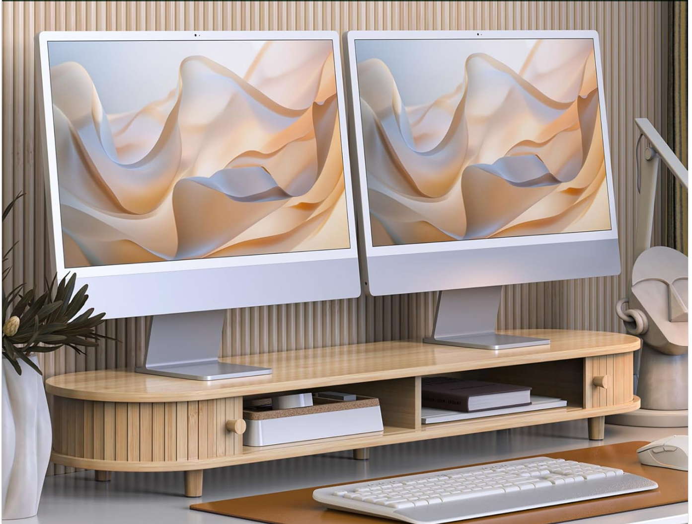
Image: All components included in the WELL WENG monitor stand package.

Modern sliding door provides ample storage space