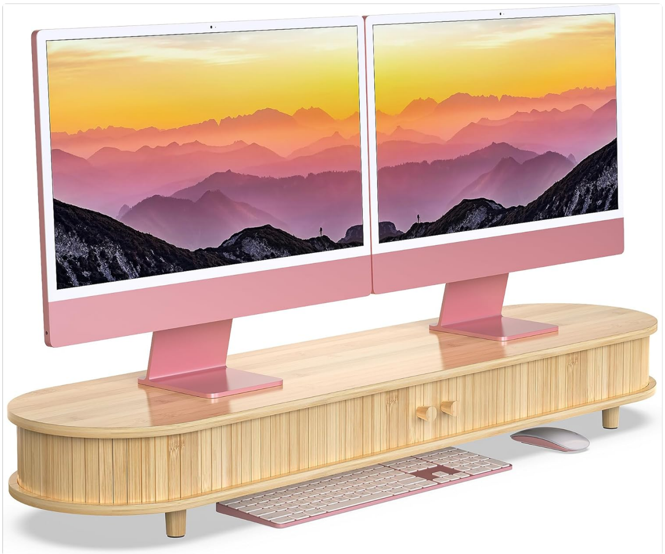
Image: The WELL WENG monitor stand fully assembled and placed on a desk, supporting two monitors.