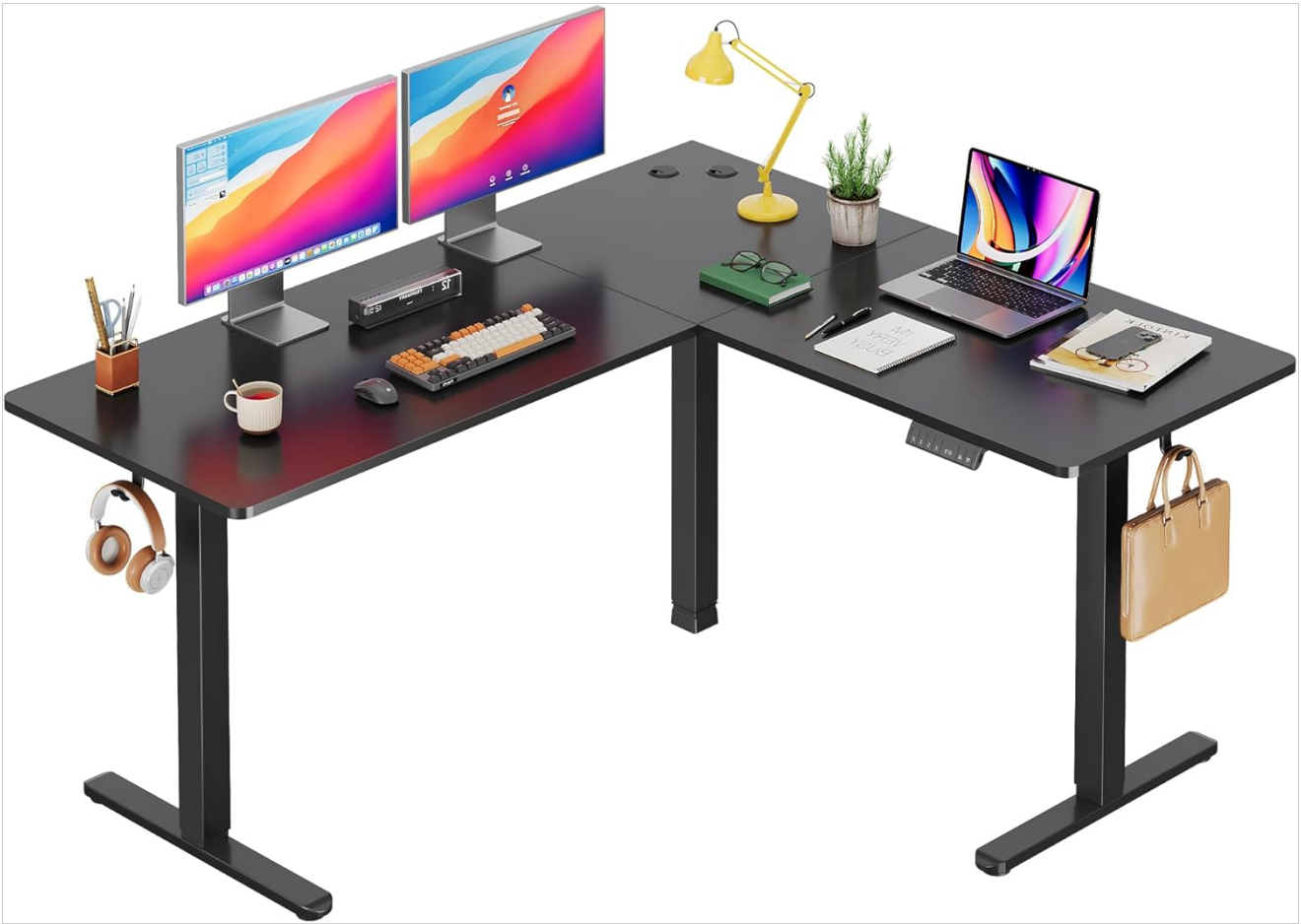
Image: The DEVAISE ASJZ026 L-Shaped Electric Standing Desk fully assembled in a modern home office environment, showcasing its spacious design and functionality.