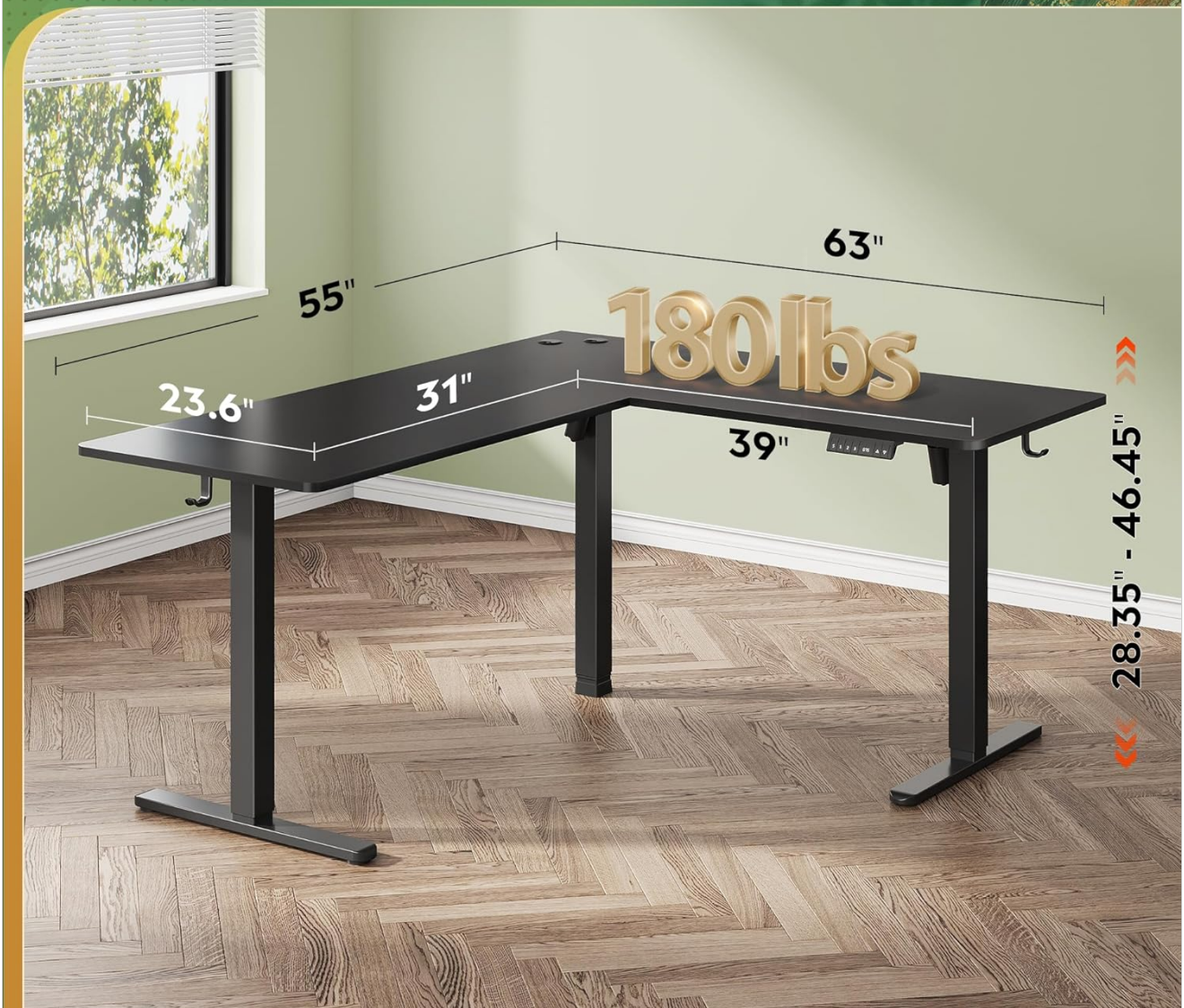
Image: A detailed diagram illustrating the desk dimensions (63x55 inches) and its load capacity of up to 180 lbs, highlighting the robust construction.