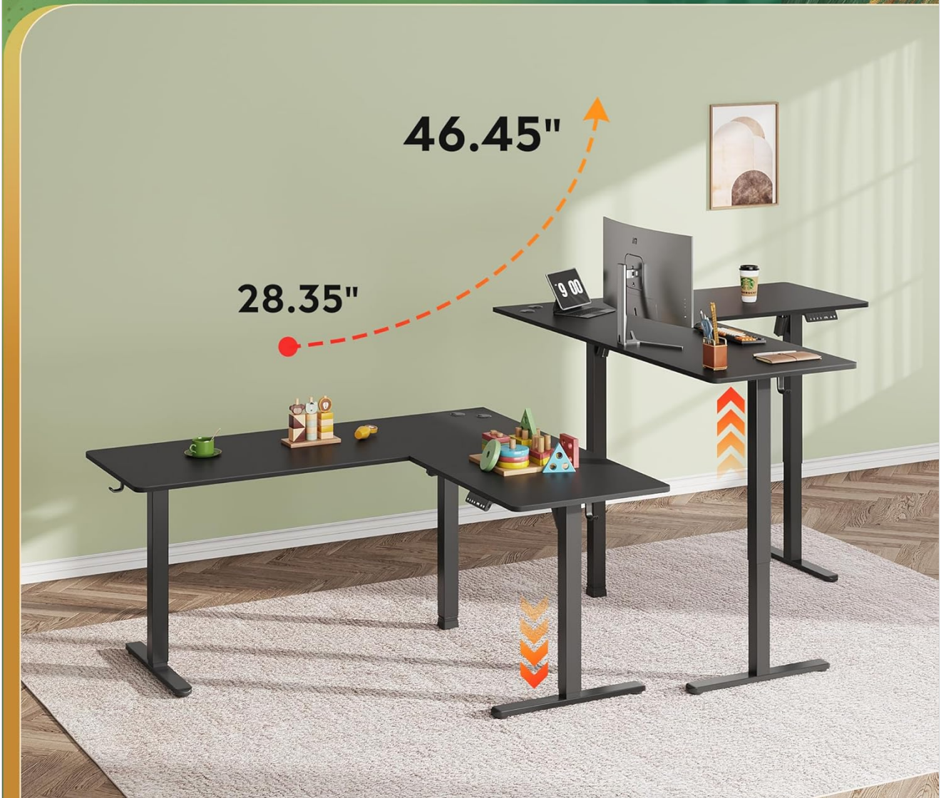
Image: Visual representation of the desk's adjustable height feature, showing the range from a minimum of 28.35 inches to a maximum of 46.45 inches, suitable for various user preferences.