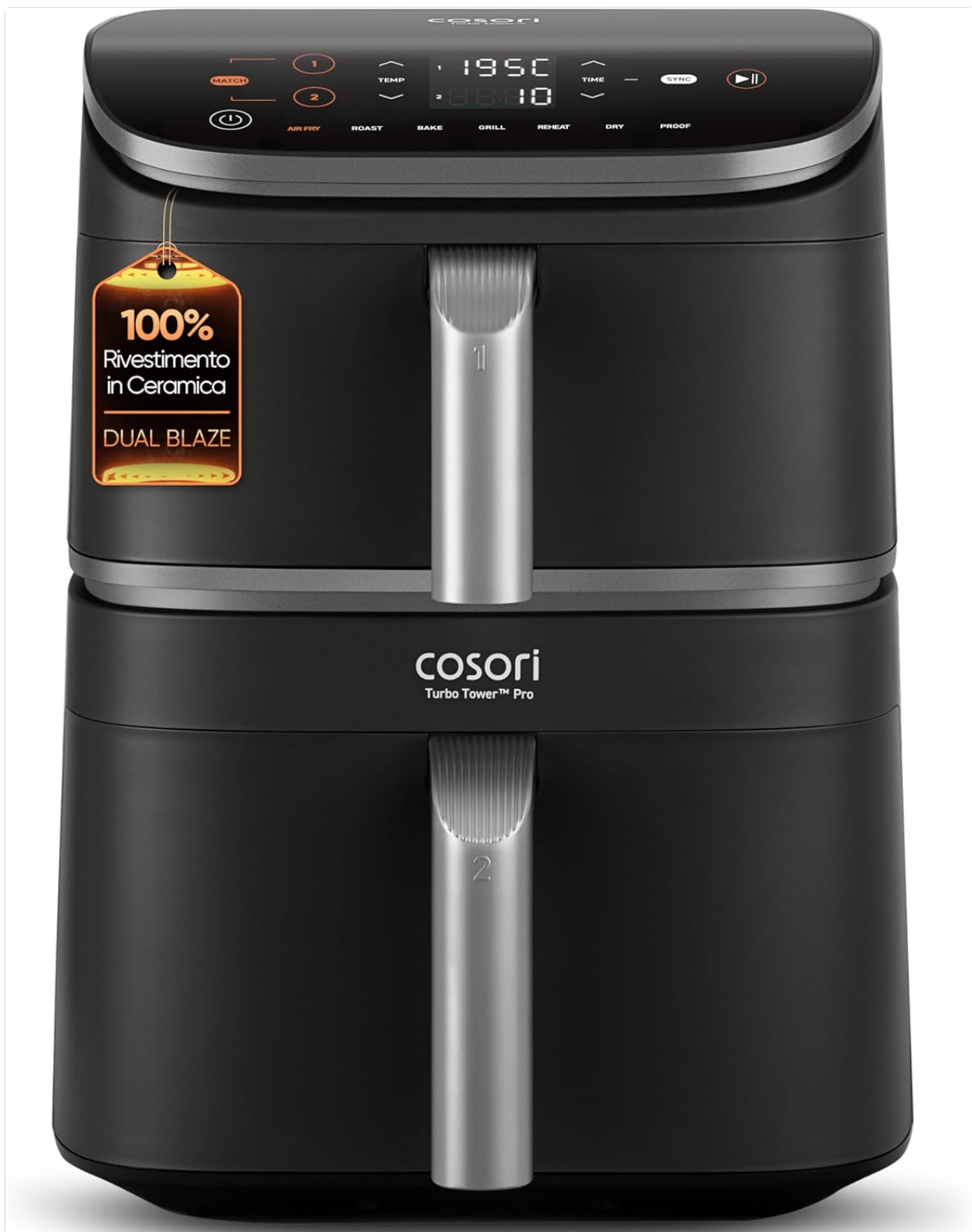
Image 1.1: COSORI Turbo Tower Pro Air Fryer CAF-DC112. This image displays the complete air fryer unit with its two stacked baskets and digital control panel.