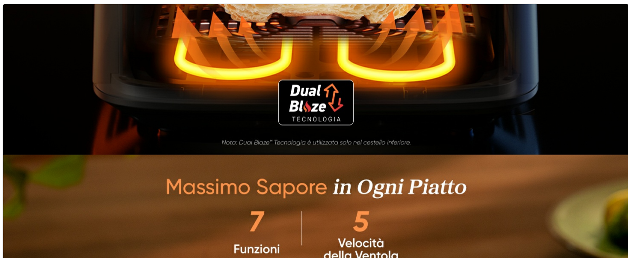
Image 3.1: This image highlights the DC motor with 5 fan speeds and the 7 versatile cooking functions of the air fryer, including Air Fry, Roast, Bake, Grill, Reheat, Dry, and Proof.