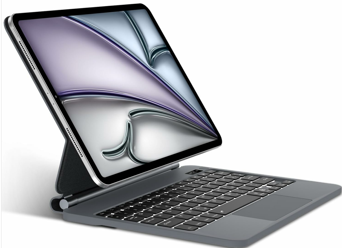
Image: The SENG BIRCH Magic Keyboard Case with an iPad, illustrating the product's overall appearance.