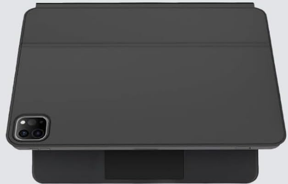
Image: Visual representation of the keyboard case's versatility, functioning as a stand, a keyboard, and a protective case.