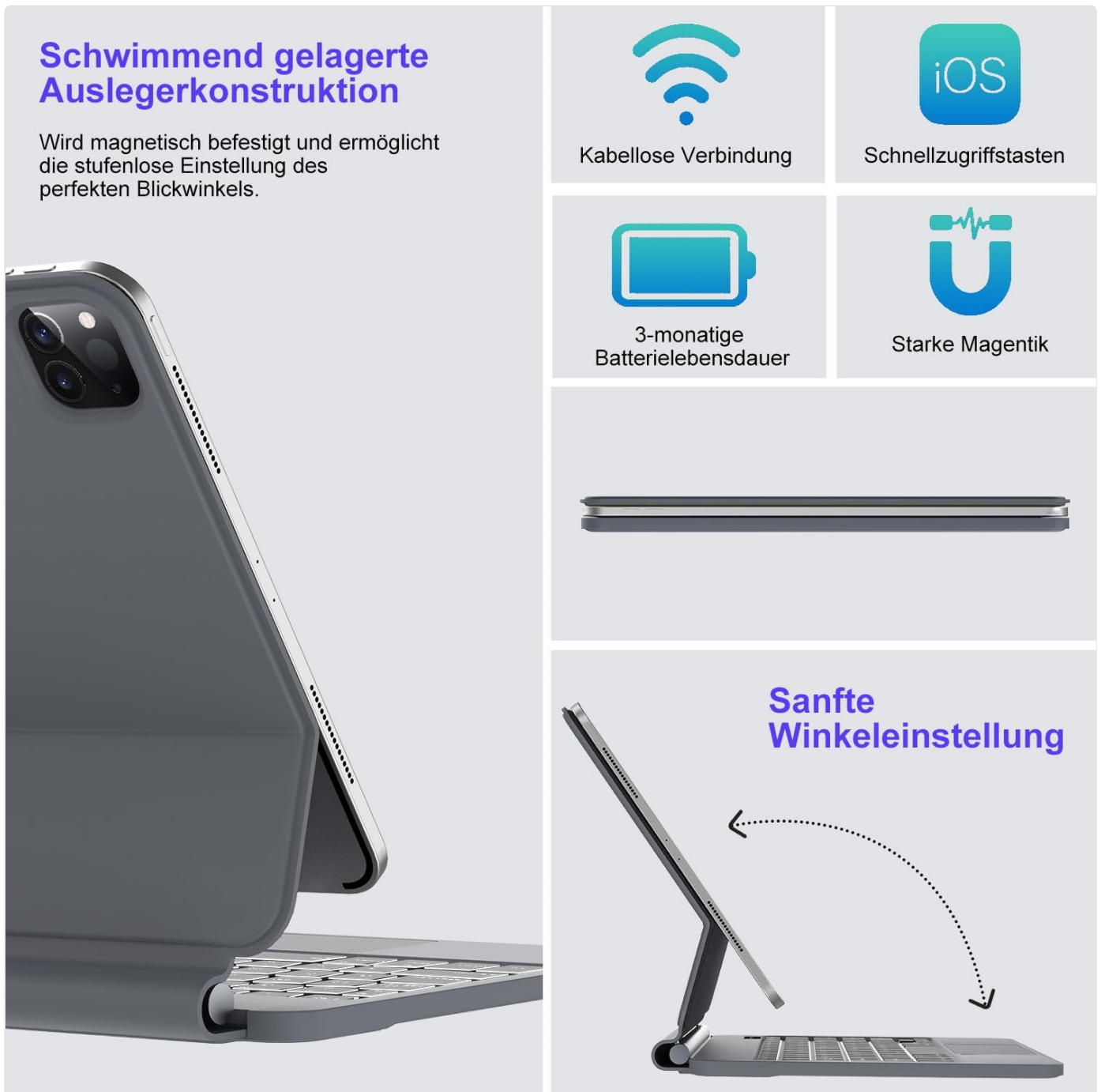
Image: The keyboard case in use, demonstrating its wireless connectivity, quick access keys, magnetic attachment, and flexible viewing angles.