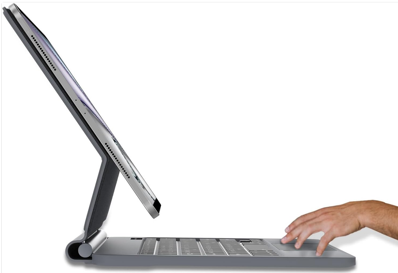
Image: A user typing on the keyboard case, illustrating the ergonomic design and typing experience.