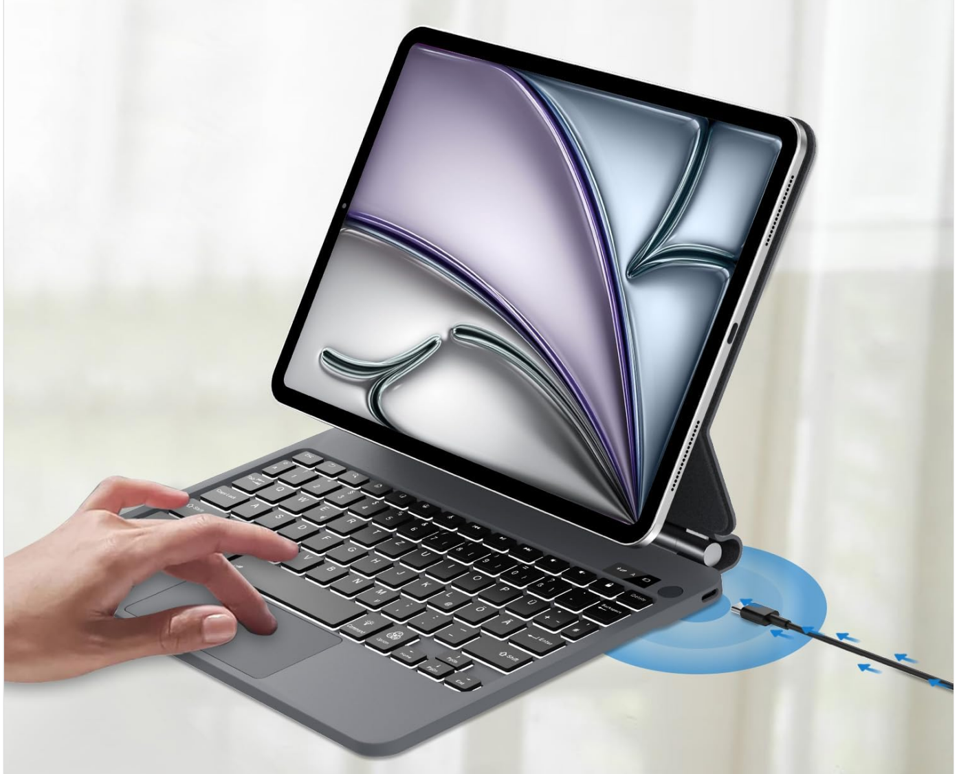
Image: The keyboard case being charged via USB-C, highlighting its long-lasting battery and quick charging capabilities.