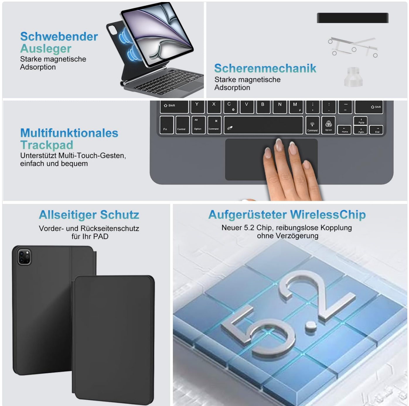
Image: Close-up of the multi-functional trackpad, highlighting its capabilities and the keyboard's overall protective design.

The trackpad automatically deactivates when typing to prevent accidental inputs.