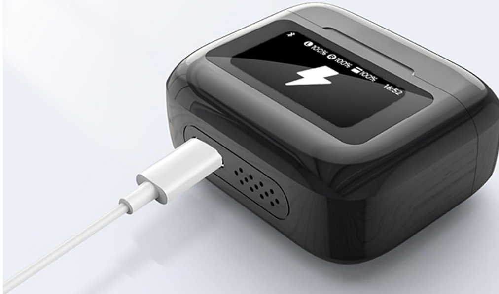
Image: The charging case screen showing battery percentages and estimated usage times for single endurance, combined range, and standby time.