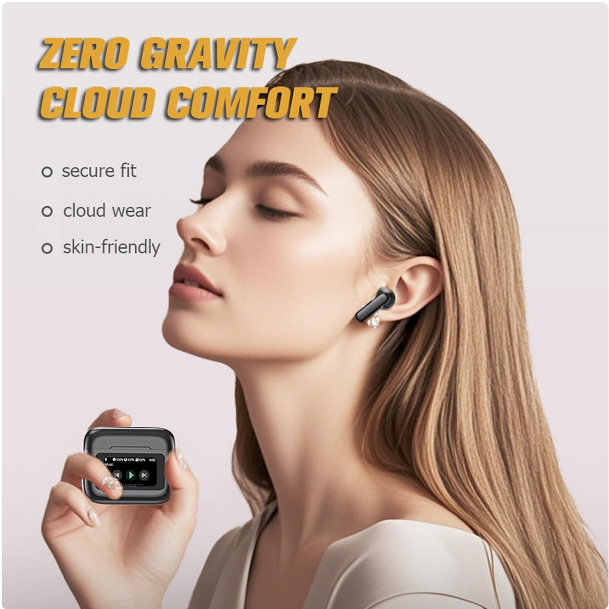
Image: A woman wearing the Xmenha JM21 earbuds, illustrating their comfortable and secure fit, described as 'Zero Gravity Cloud Comfort'.