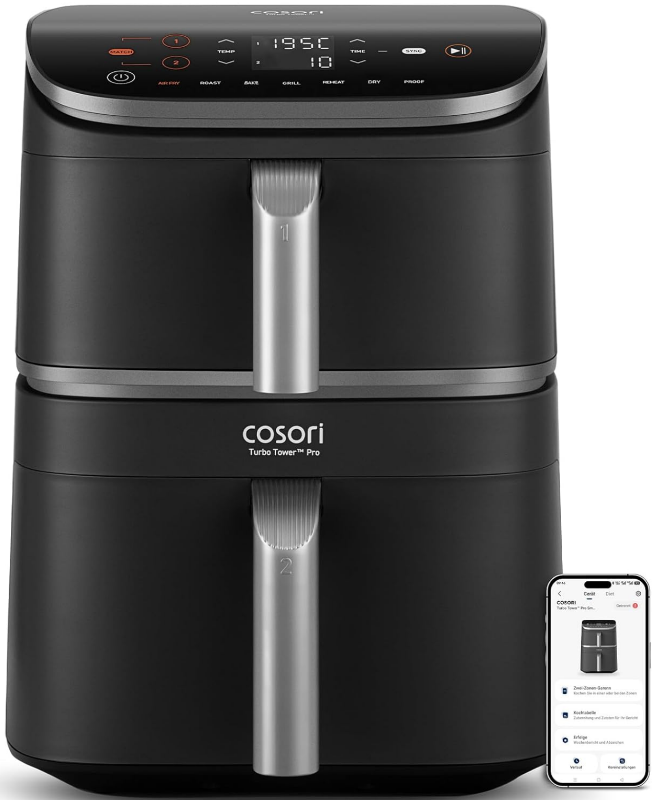
Image: The COSORI Air Fryer 10.8L Smart Turbo Tower Pro, showcasing its stacked dual-basket design and top control panel.