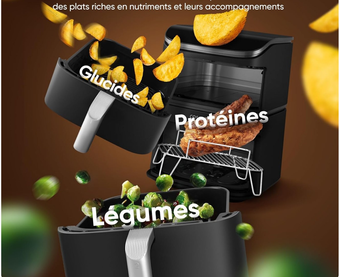
Image: Illustration of the air fryer's capability to cook a complete meal simultaneously, with separate sections for carbohydrates, proteins, and vegetables.

Cuisinez en meme temps des plats riches en nutriments et leurs accompagnements