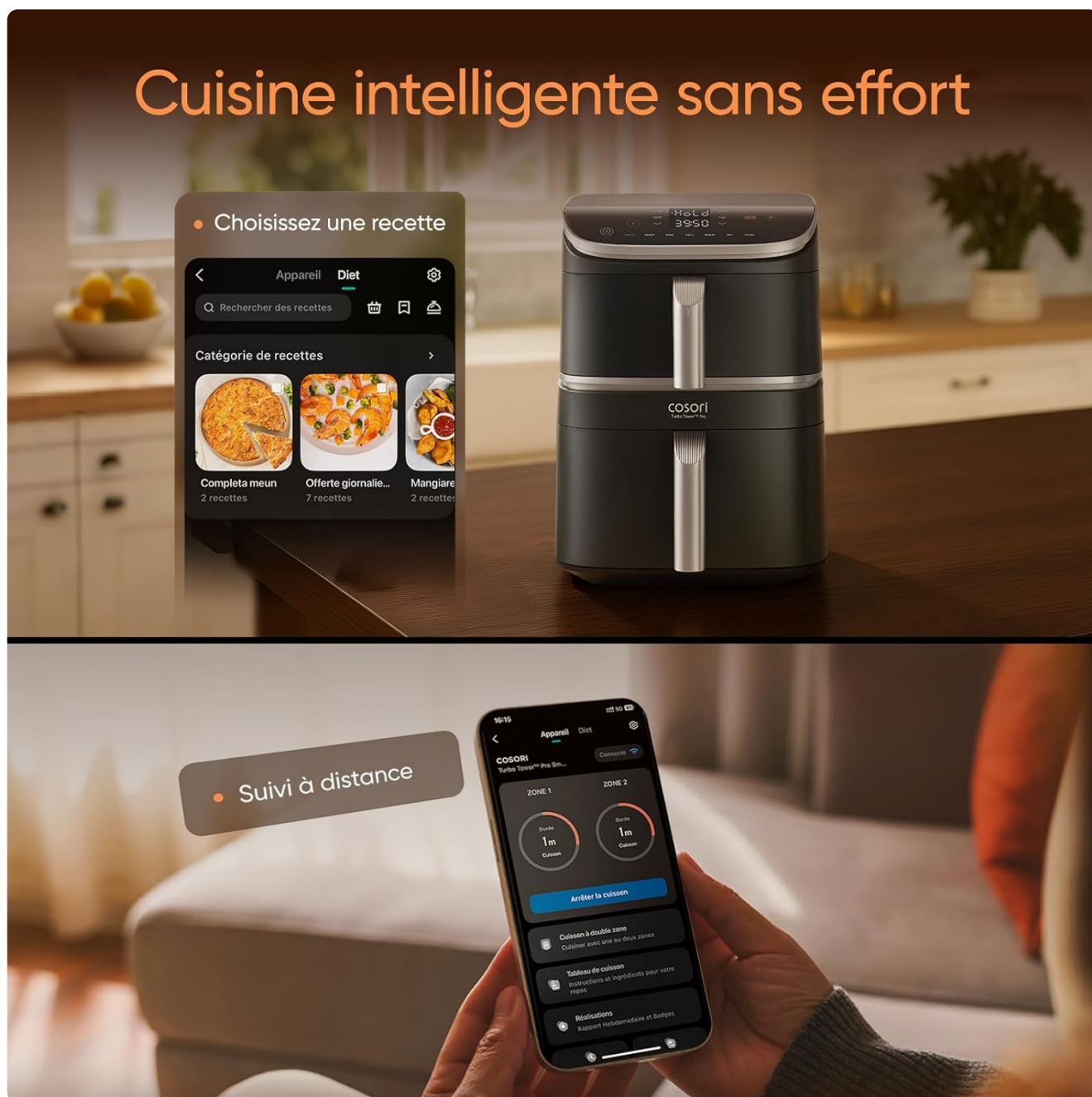
Image: The COSORI Air Fryer with a smartphone displaying the VeSync app interface, demonstrating remote control and monitoring capabilities.

For smart features, download the VeSync app and follow the in-app instructions to connect your air fryer.