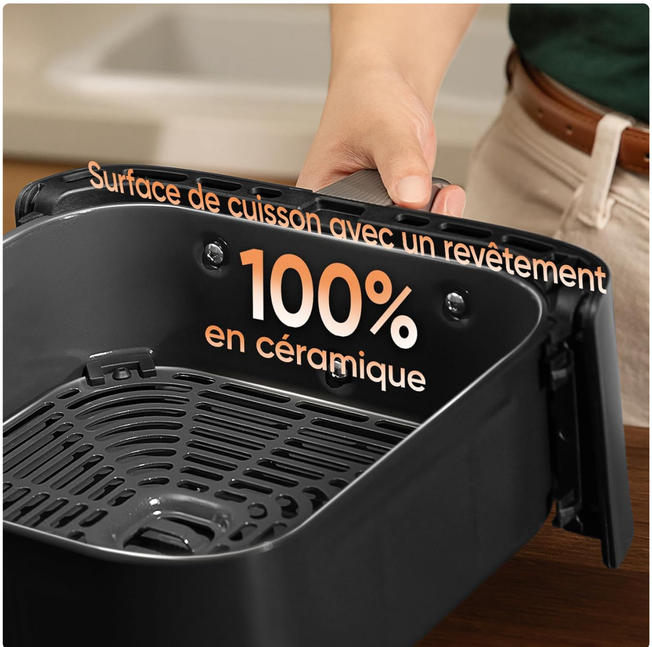
Image: A close-up view of the air fryer basket, highlighting its 100% ceramic coated cooking surface for easy cleaning and safe food contact.