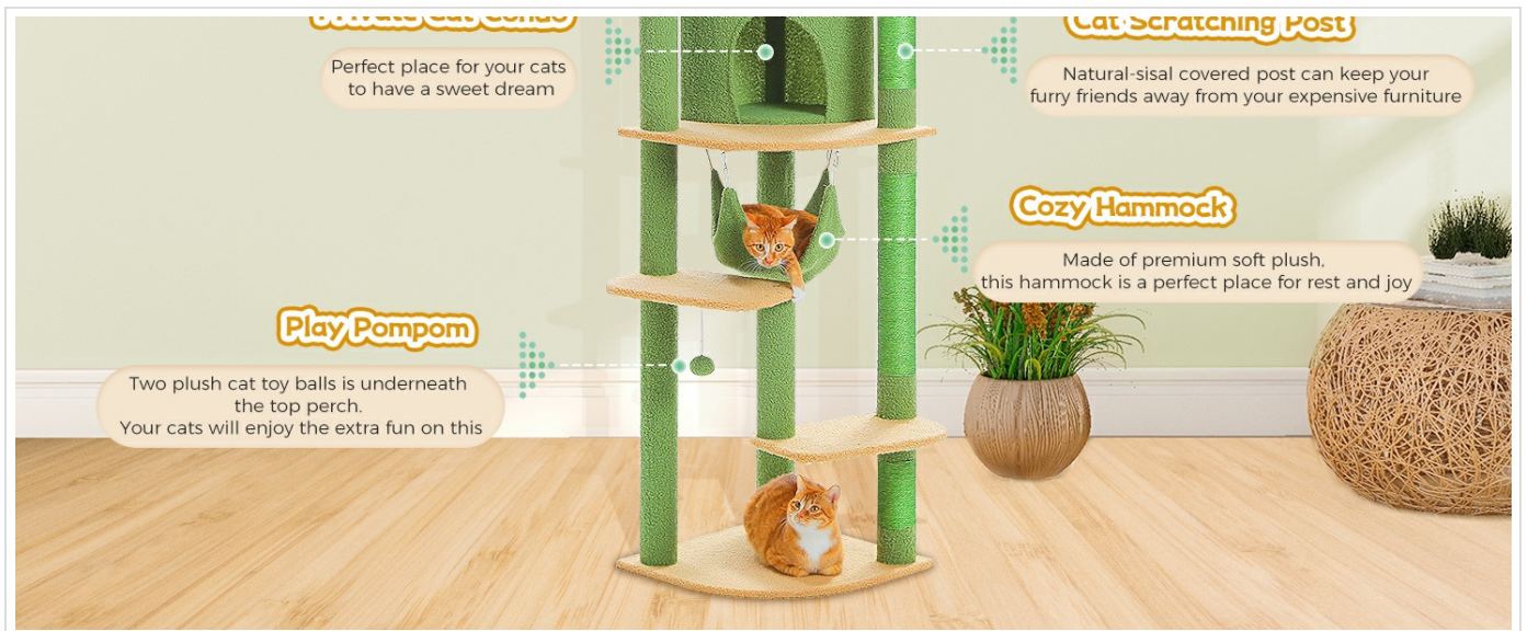
Figure 6: Cat resting in the cozy hammock, designed for comfort.