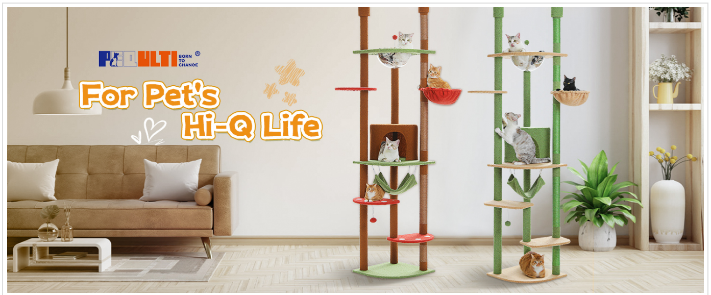
Figure 1: PEQULTI Floor to Ceiling Cat Tree in Cactus Green.