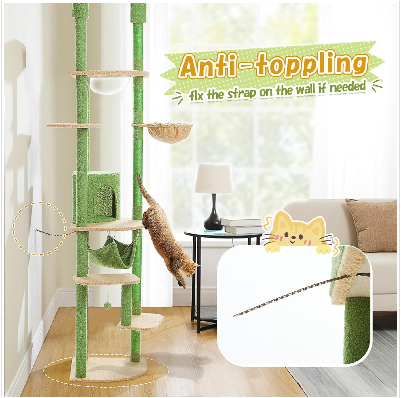
Figure 4: Anti-Toppling Strap for enhanced stability.

Your browser does not support the video tag.