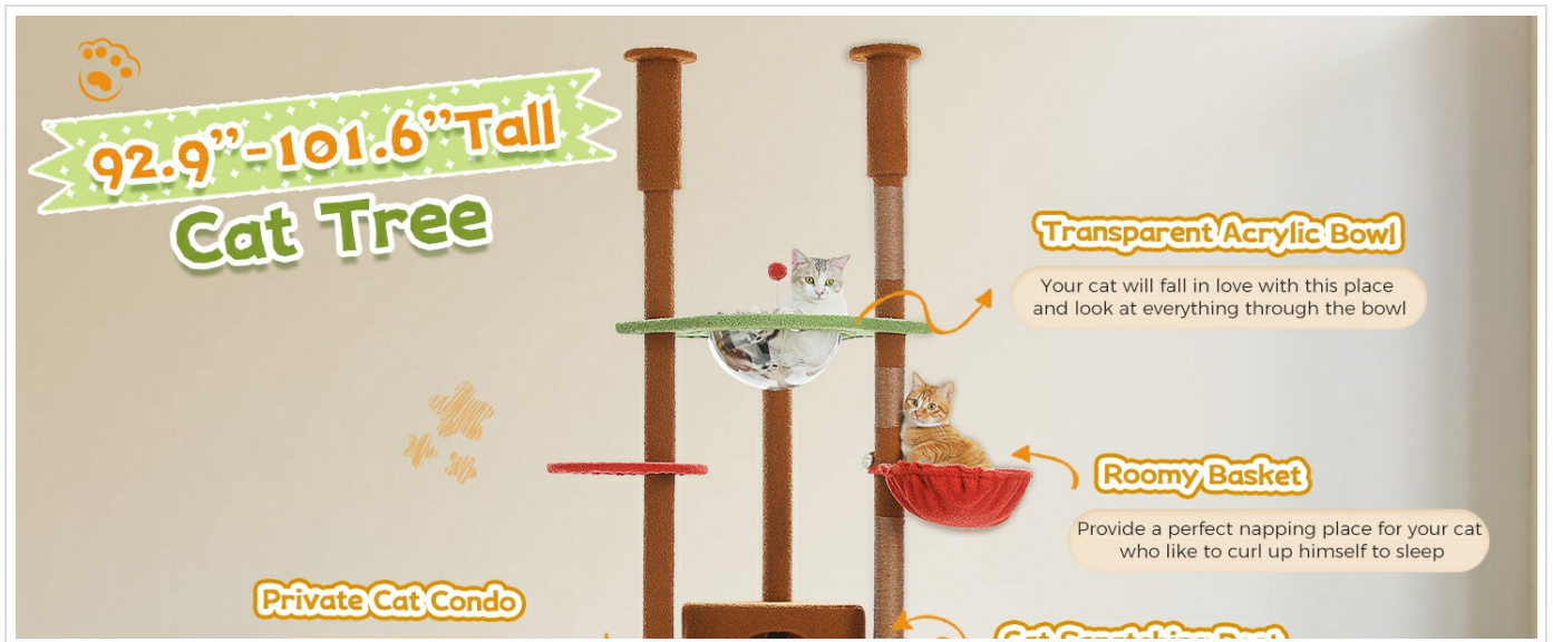
Figure 5: Cat enjoying the transparent acrylic bowl, offering a unique view.