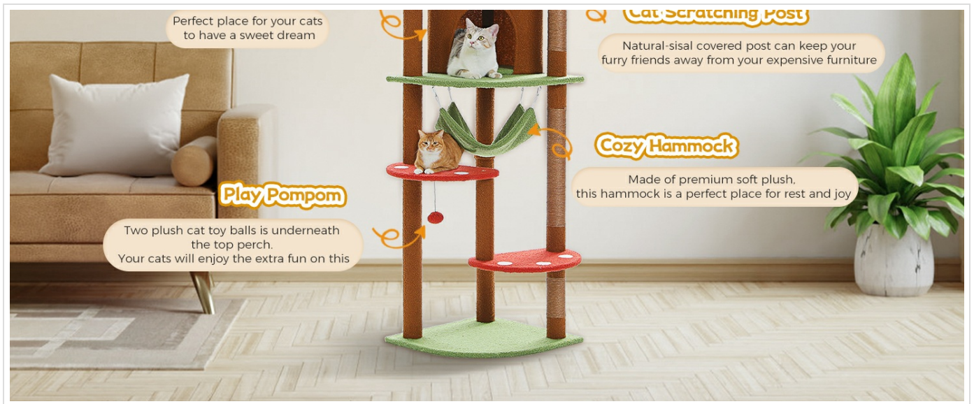
Figure 7: Cat utilizing the spacious and private cat condo.