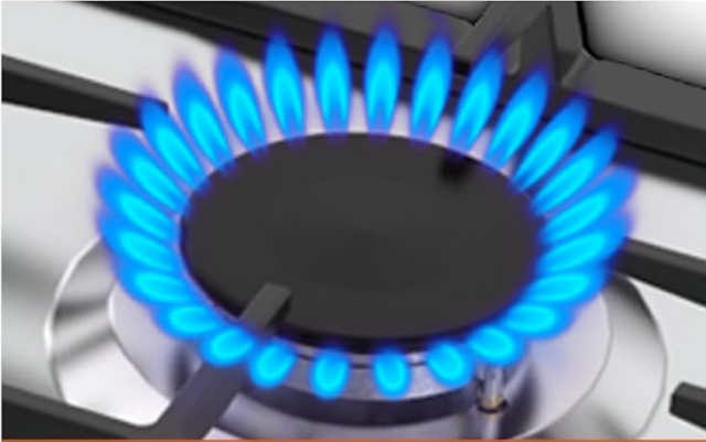
High Power Burners