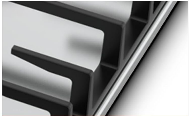
Cast Iron Grate

Durable Quality: This close-up highlights the robust construction, including high-power burners, melt-proof control knobs, electronic pulse ignition, and sturdy cast iron grates.