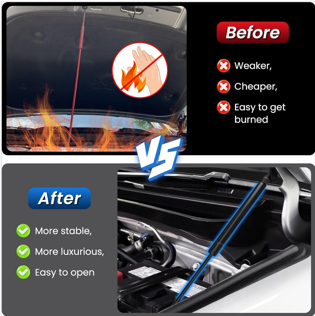
Figure 5.1: Comparison of hood support methods. This image illustrates the difference between using a traditional prop rod and the stability provided by the installed gas struts.