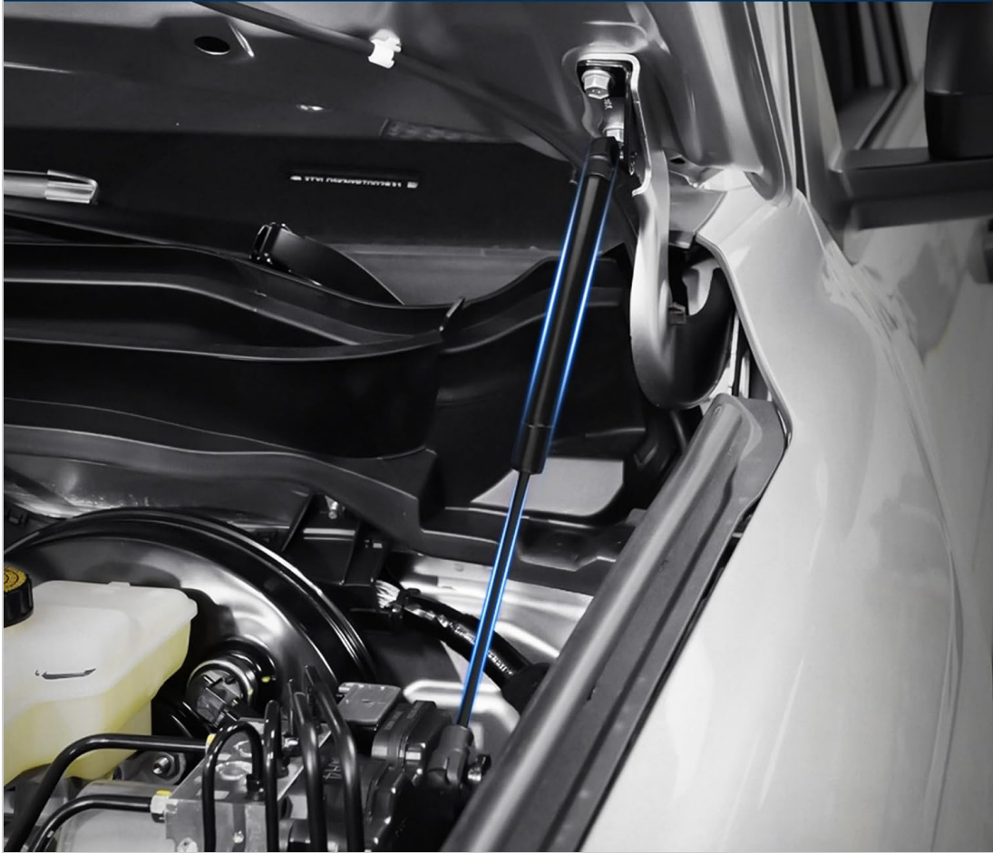
Figure 4.2: TECHPICCO Hood Struts installed on a Toyota Tacoma. This image provides an overall view of the product in its operational state, supporting the hood.