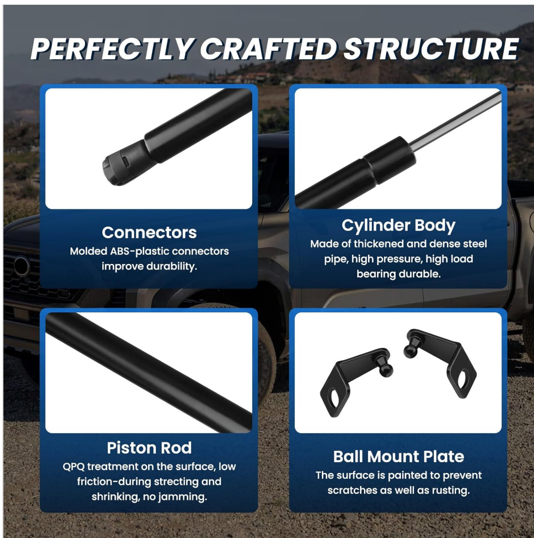
Figure 3.1: Components of the TECHPICCO Hood Strut kit. This image displays the individual parts: connectors, the main cylinder body, the piston rod, and the ball mount plates, highlighting their construction and features.