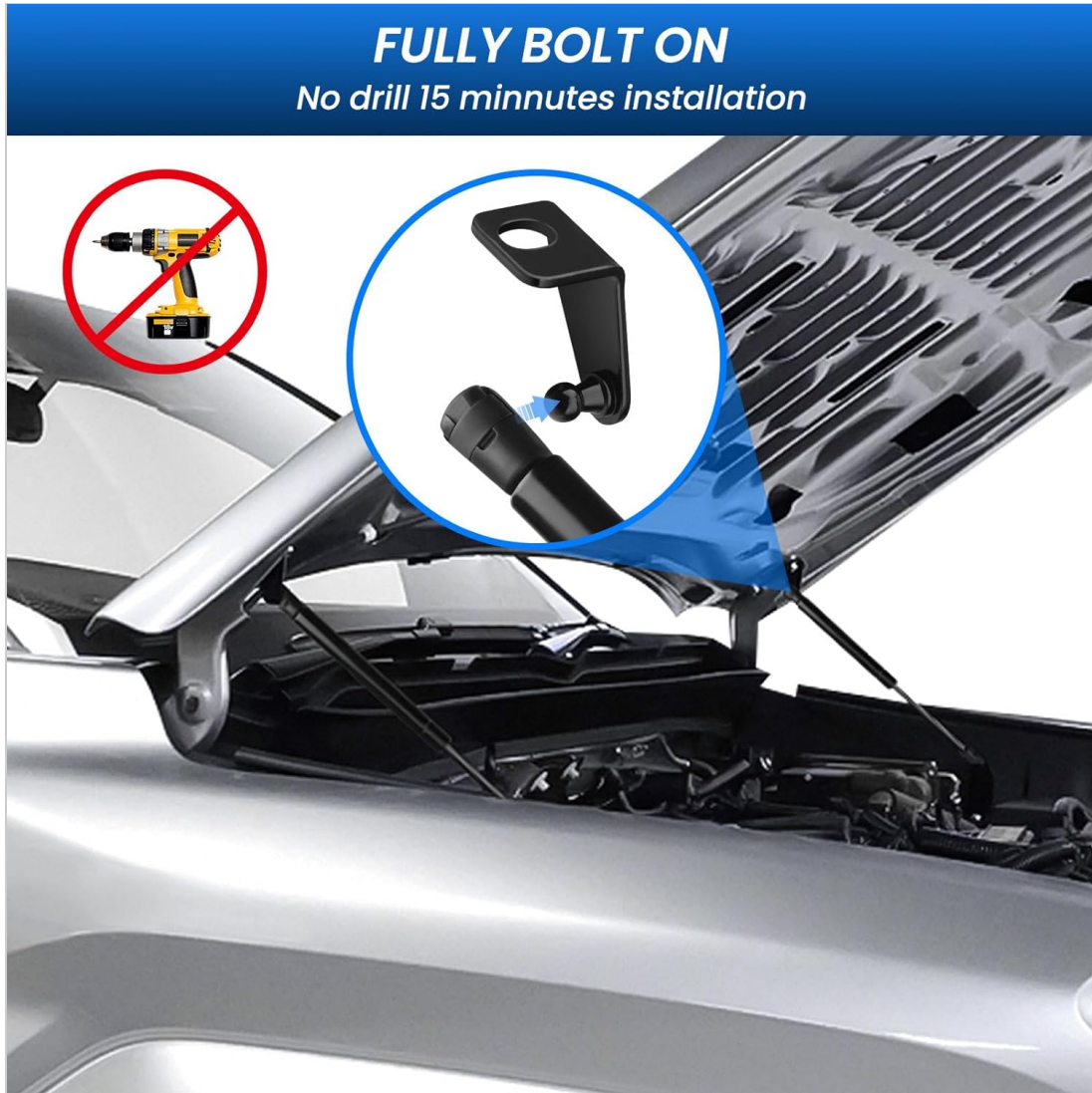
Figure 4.1: Illustration of the bolt-on installation process. This image highlights that no drilling is required, and the struts attach directly to existing points.