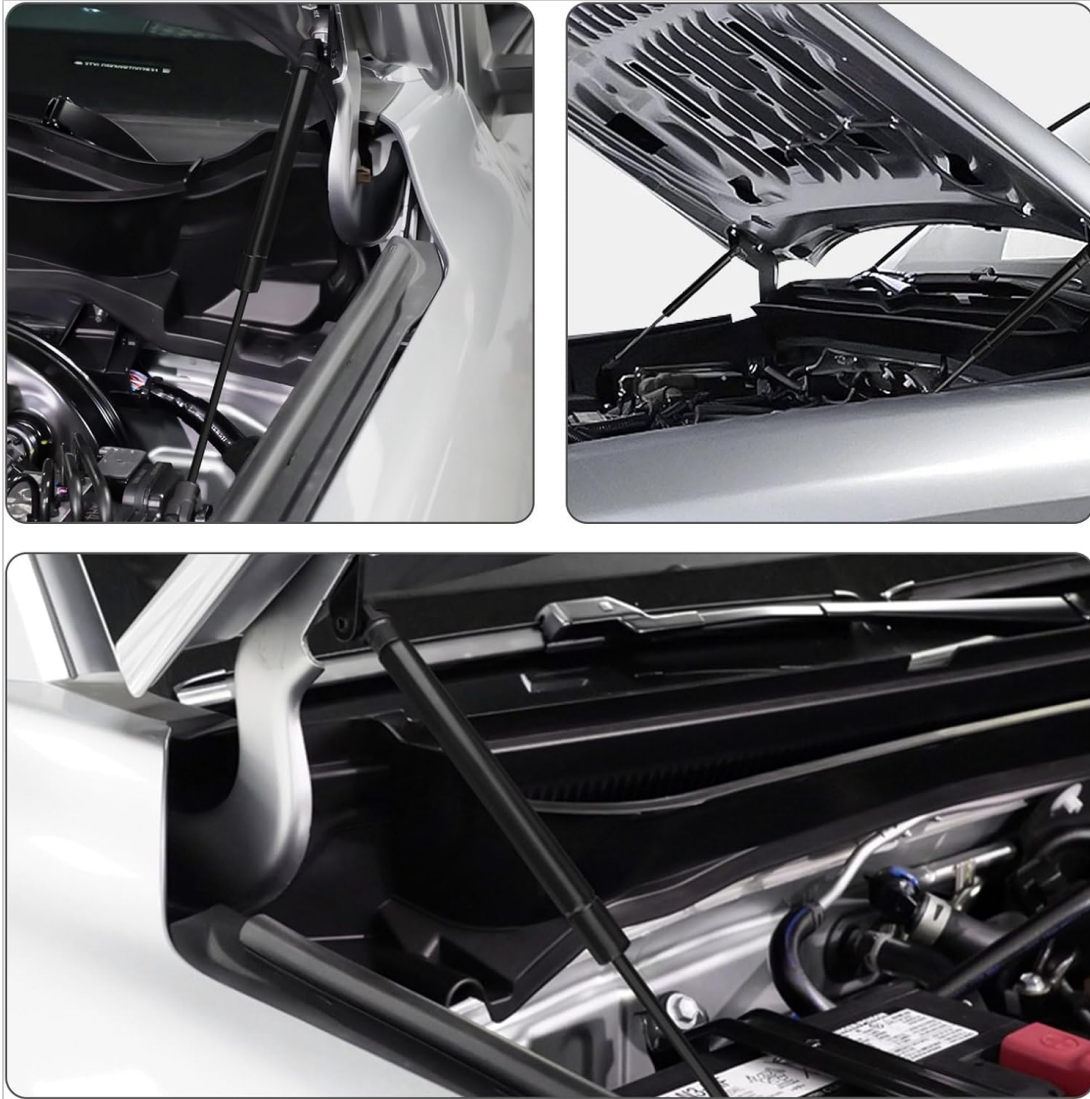
Figure 4.3: Various installed views of the hood struts. This composite image shows the struts from different perspectives within the engine bay, demonstrating their fit and function.