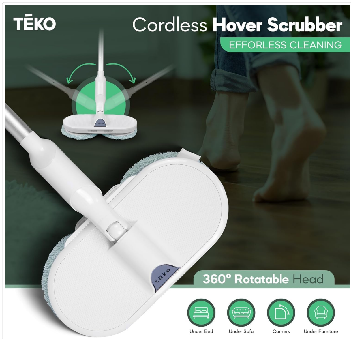
Figure 1: The TEKO Hover Scrubber Omni features a 360-degree rotatable head for enhanced maneuverability, allowing easy access to tight spaces and under furniture.