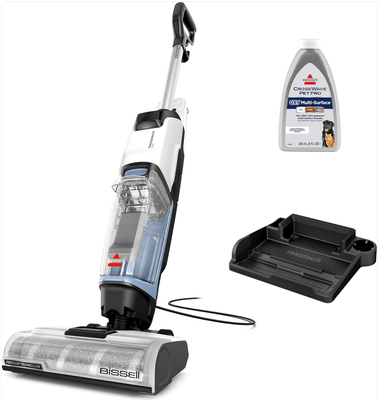
Figure 1: BISSELL CrossWave Edge unit with included accessories, including the clean water tank, dirty water tank, brush roll, and storage tray.