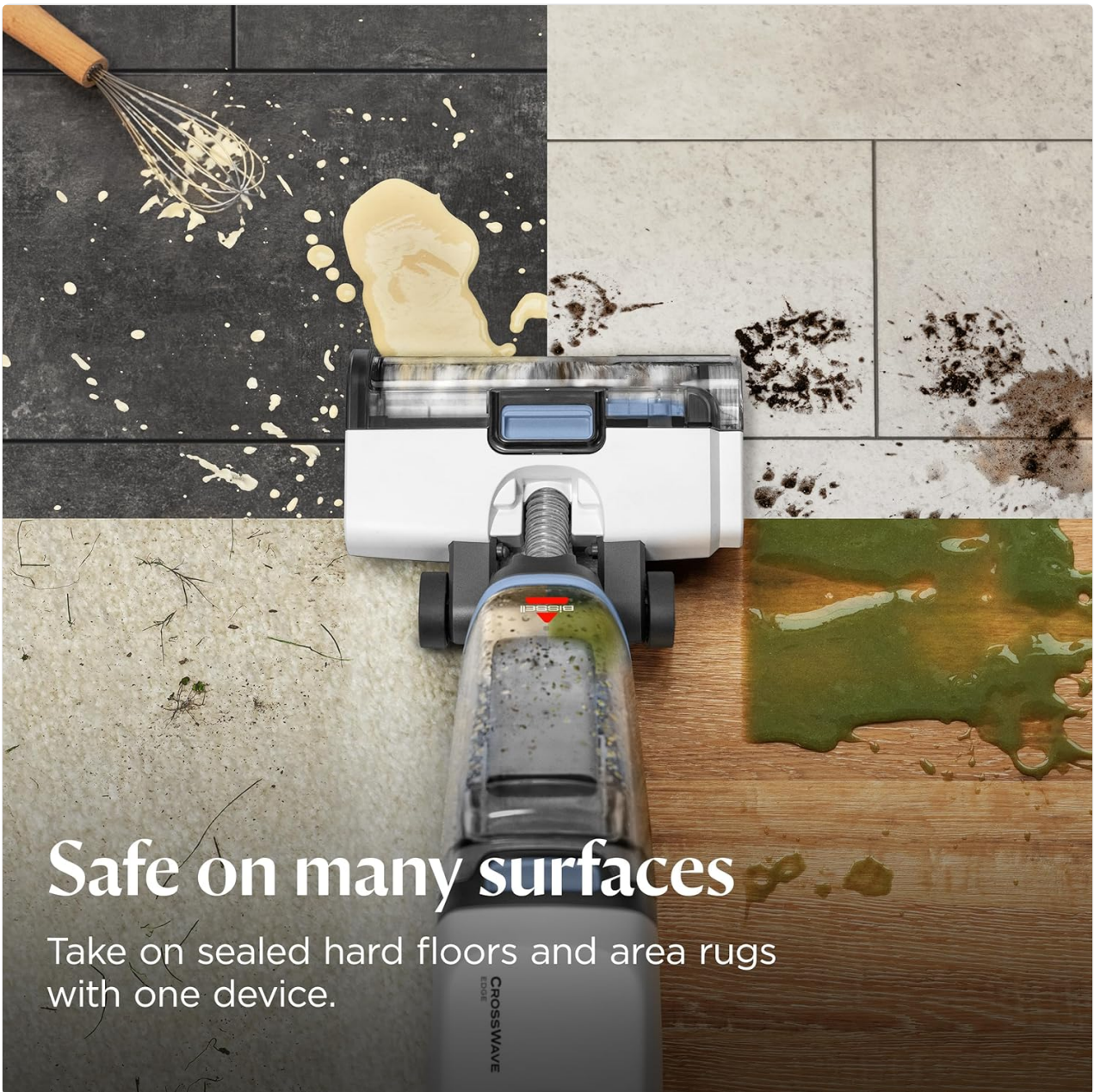
Figure 3: Illustrates the CrossWave Edge's capability to clean various sealed hard surfaces and area rugs.