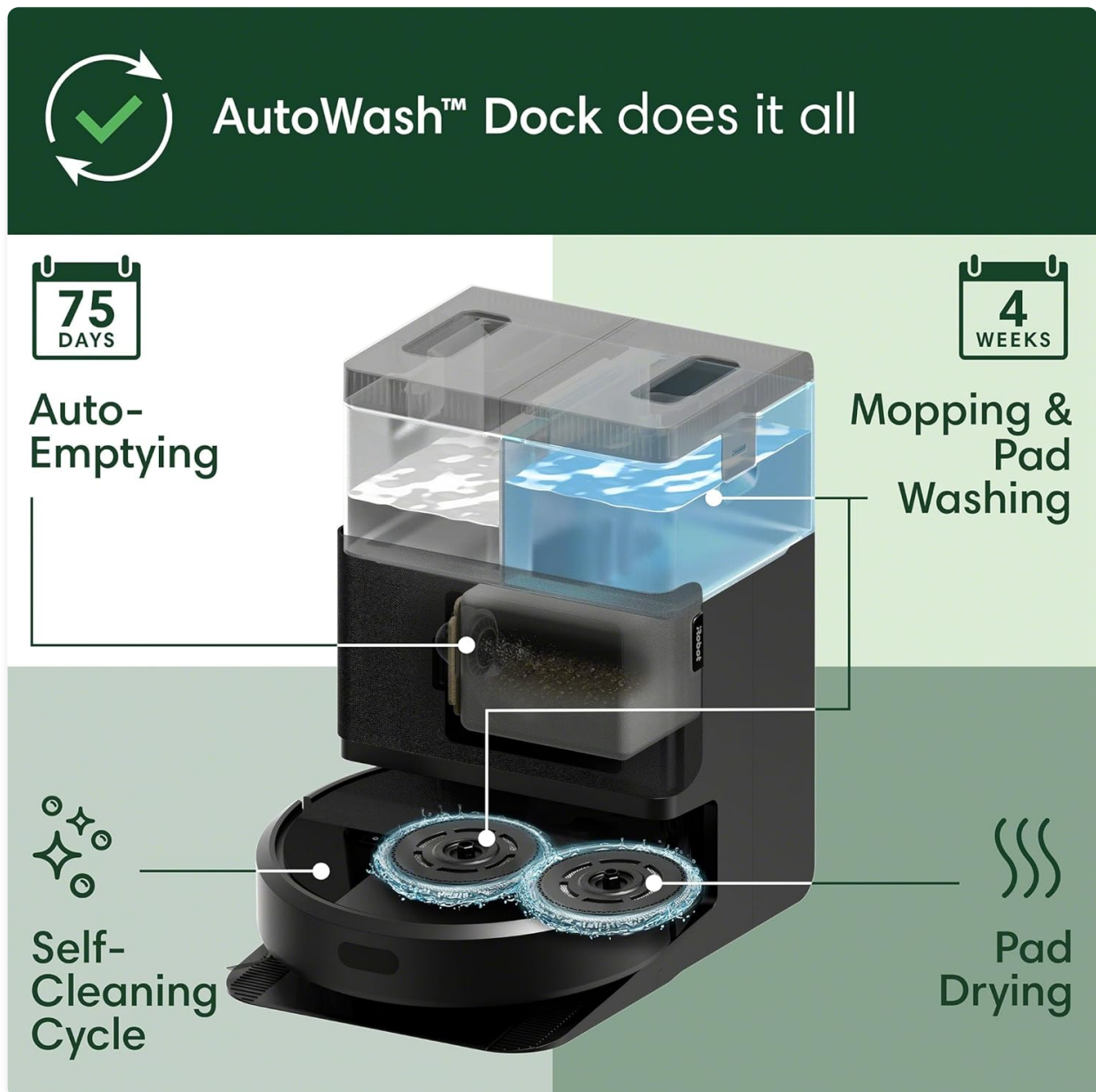
Figure 4.1: The AutoWash Dock's comprehensive features for automated maintenance.

The AutoWash Dock is designed for minimal manual intervention, handling dirt disposal and mop pad care automatically.