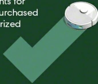
Figure 7.2: Ensure purchase from authorized resellers to protect your investment and warranty.

iRobot does not certify the quality or authenticity of products purchased from non-authorized resellers on Amazon, and will only cover warranty claims, provide service or offer replacements for products purchased from authorized resellers.