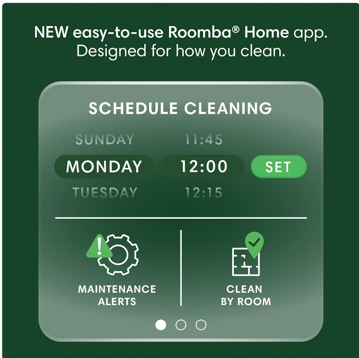
Figure 2.2: The iRobot Home App, essential for scheduling and managing your robot.