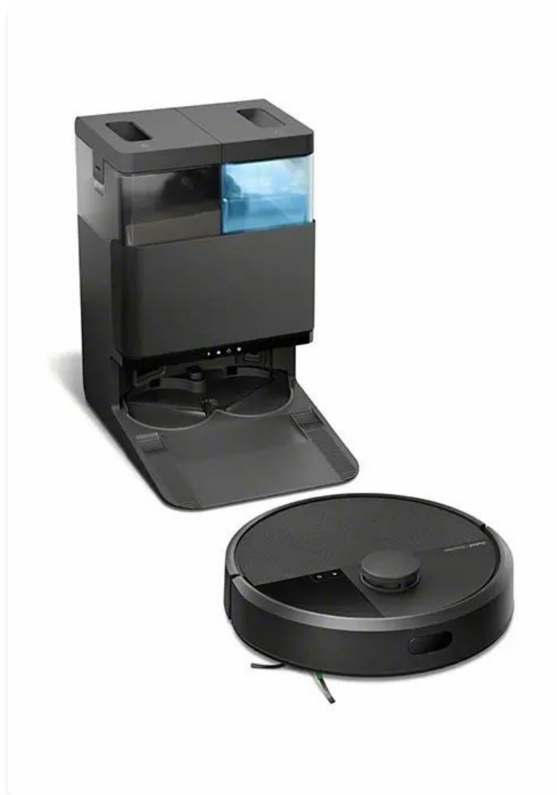
Figure 2.1: The Roomba robot and its AutoWash dock, ready for setup.

Carefully remove all components from the packaging. Ensure you have the Roomba Plus 405 Combo robot, the AutoWash Dock, and any included accessories.