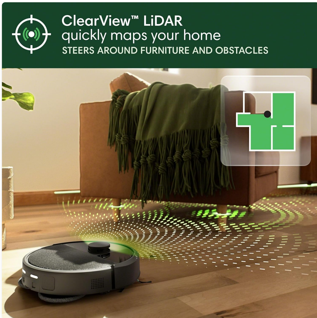
Figure 3.1: ClearView LiDAR technology enables the robot to quickly map your home for efficient navigation.

Before its first cleaning, the robot will perform a mapping run to learn your home's layout. This helps optimize future cleaning paths.