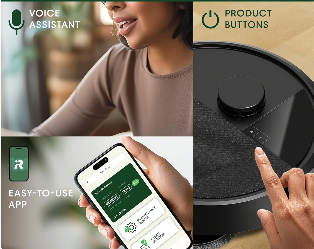
Figure 3.2: Control your Roomba using the app, voice commands, or directly via the robot's buttons.