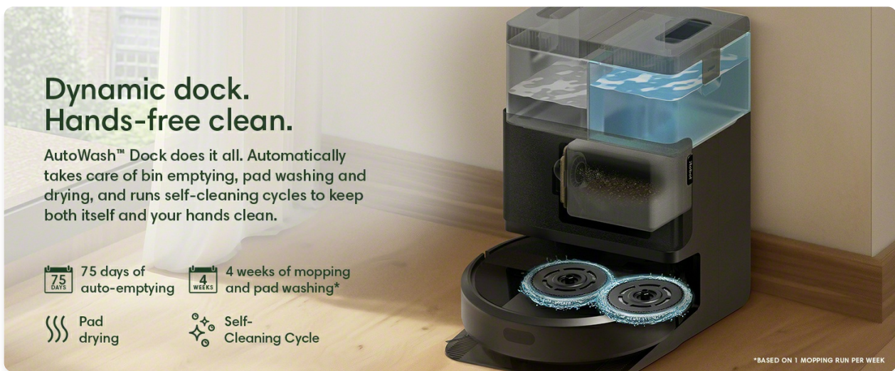
Figure 4.2: The dynamic dock ensures hands-free cleaning by managing bin emptying, pad washing, and drying.