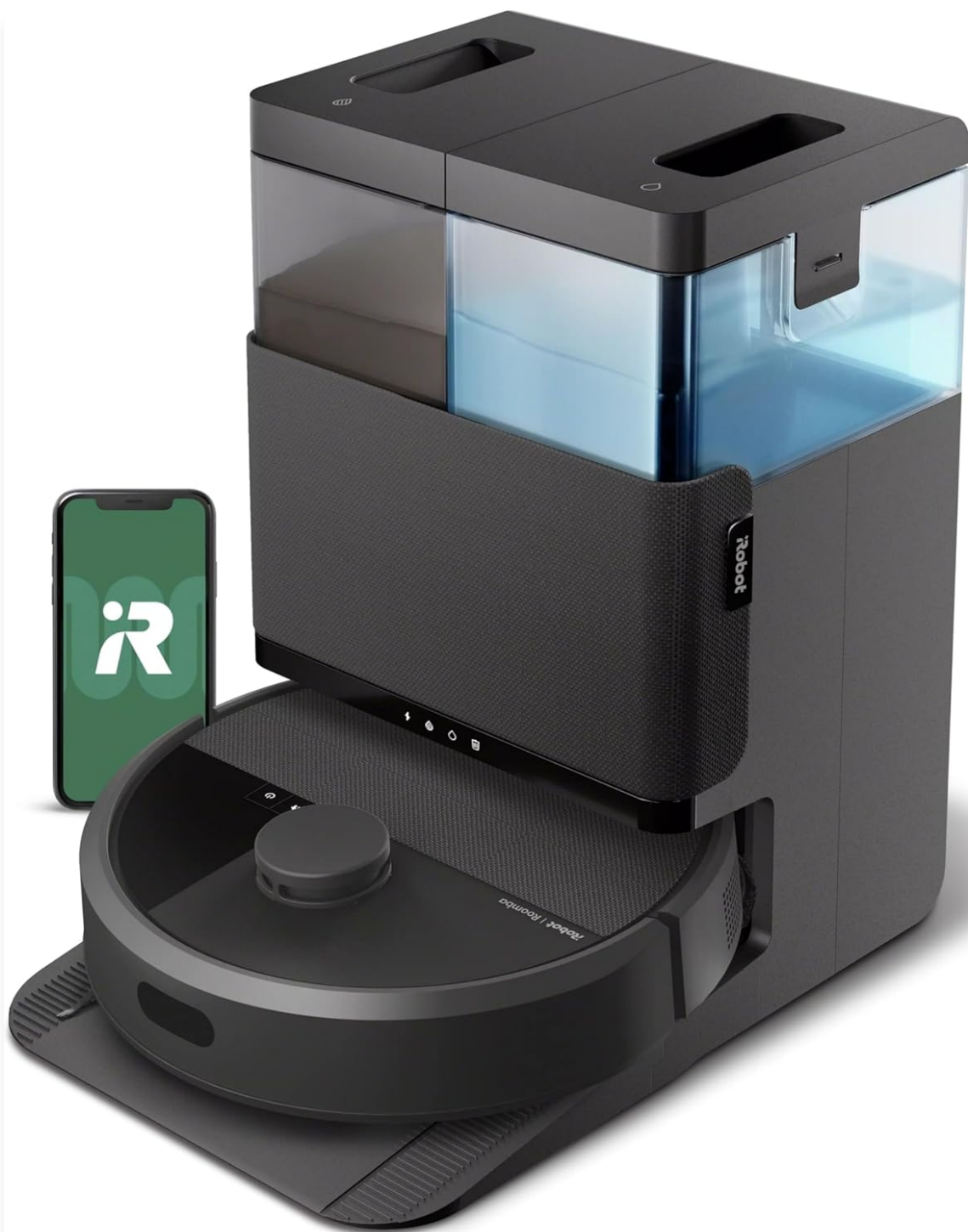
Figure 1.1: The iRobot Roomba Plus 405 Combo Robot Vacuum and Mop with its AutoWash Dock.