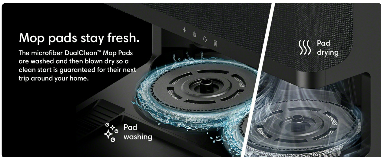
Figure 4.3: The dock ensures mop pads stay fresh through continuous washing and drying.