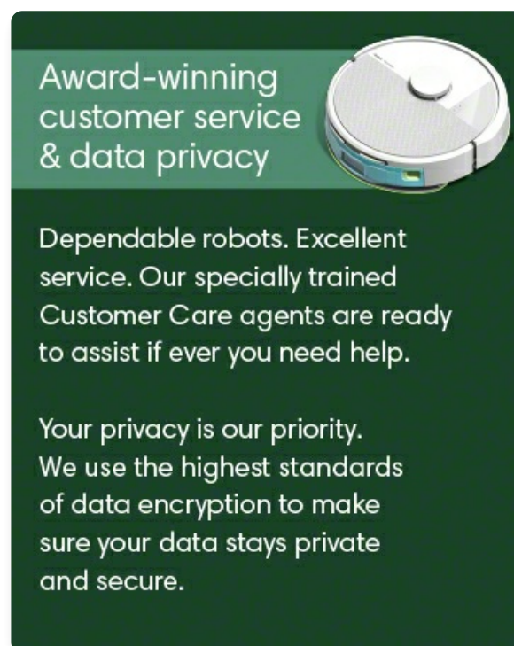
Figure 7.1: iRobot's commitment to customer service and data privacy.

Important Note on Warranty: iRobot does not certify the quality or authenticity of products purchased from non-authorized resellers on Amazon, and will only cover warranty claims, provide service, or offer replacements for products purchased from authorized resellers.