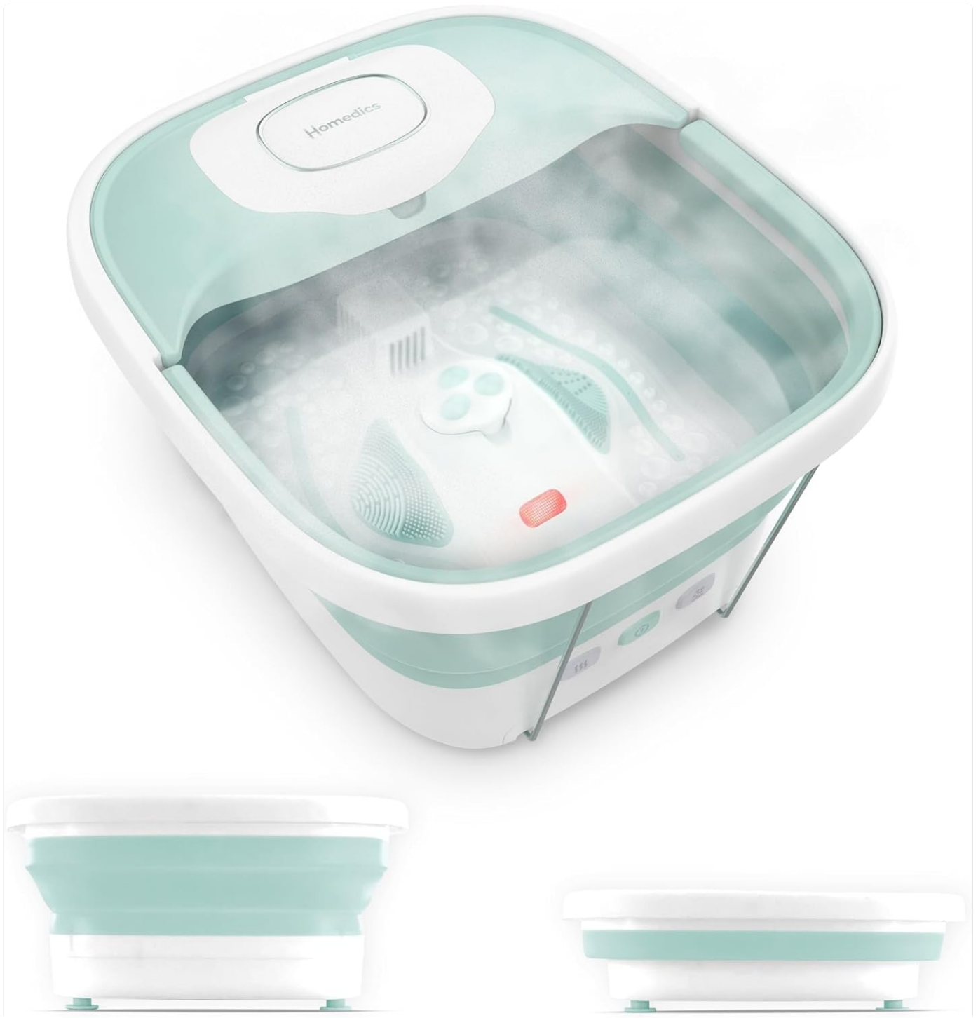
Image: The HoMedics Smart Space Elite Footbath in its expanded, ready-to-use state, with smaller images demonstrating its collapsible design.