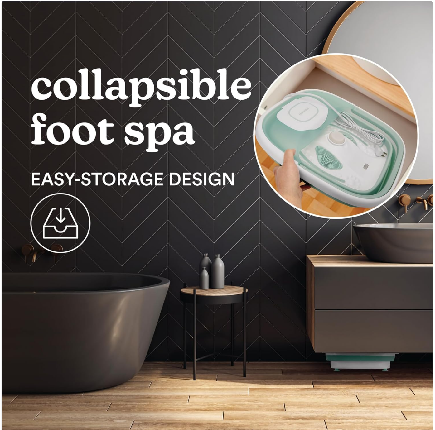
Image: Demonstrates the collapsible design of the foot spa, showing how it can be easily stored in a compact space.