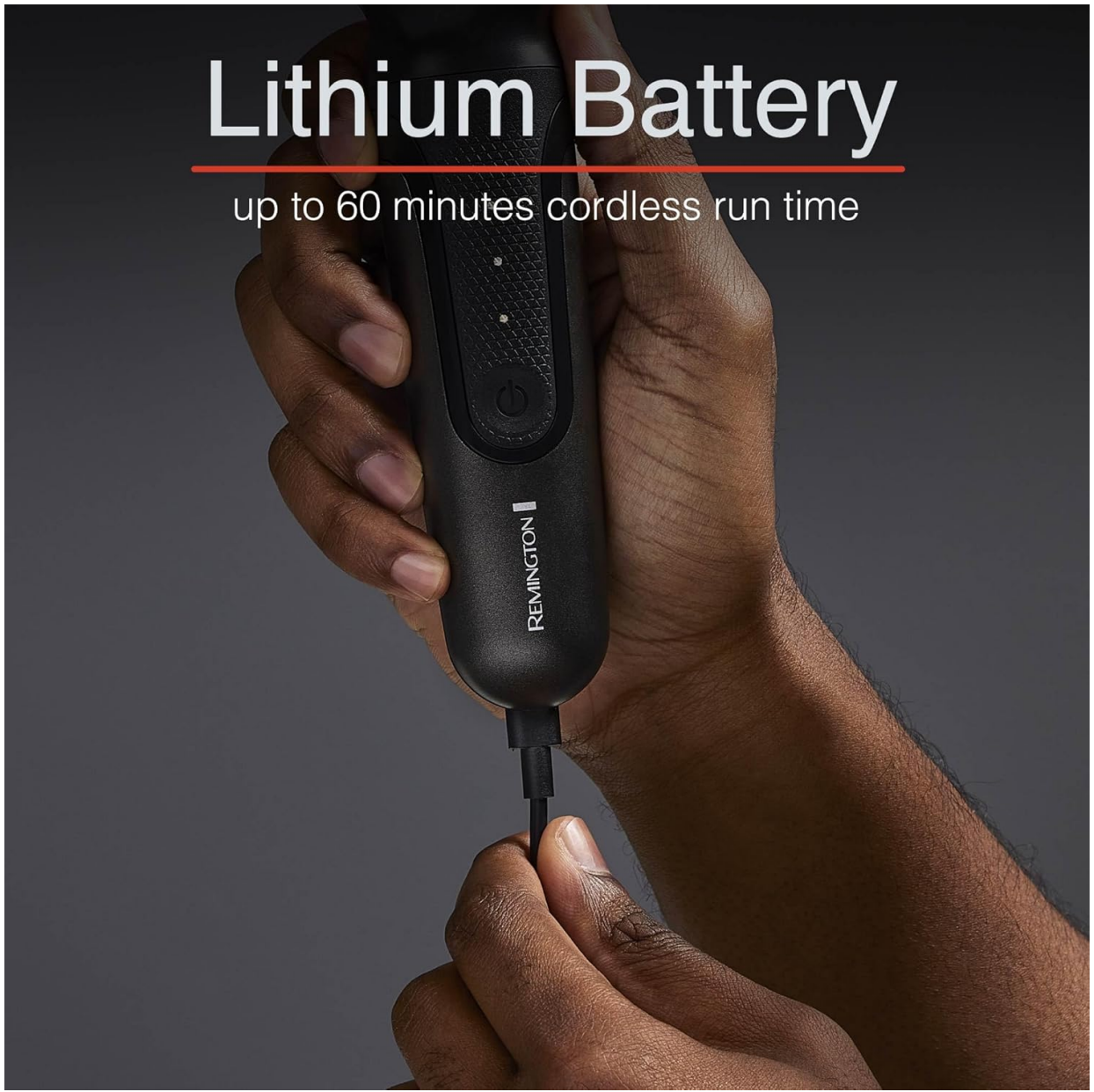
Image: Hands connecting the USB-C charging cable to the Remington ONE Multi-Tool, with the three LED battery indicator lights illuminated.

The Remington ONE Multi-Tool is equipped with a lithium battery. A full charge takes approximately 2 hours and provides up to 60 minutes of cordless runtime. A 5-minute quick charge can provide enough power for a single use. Connect the USB-C cable to the device and a compatible power source. The LED indicators will show the charging status.