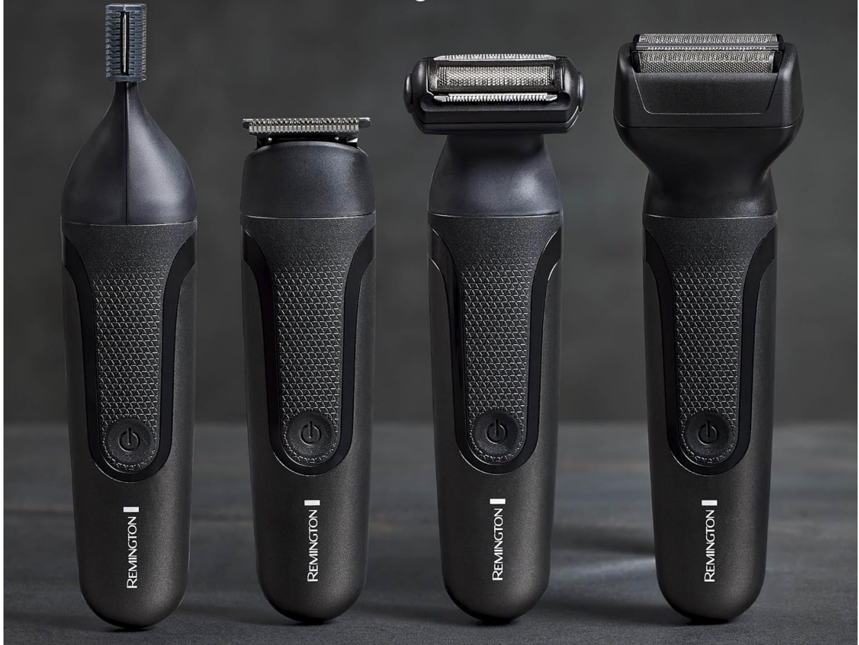
Image: The Remington ONE Multi-Tool handle shown with four different interchangeable heads: the nose/ear/eyebrow trimmer, T-blade trimmer, body shaver, and foil shaver, illustrating its versatility.

interchangeable heads and one sleek multi-groom handle