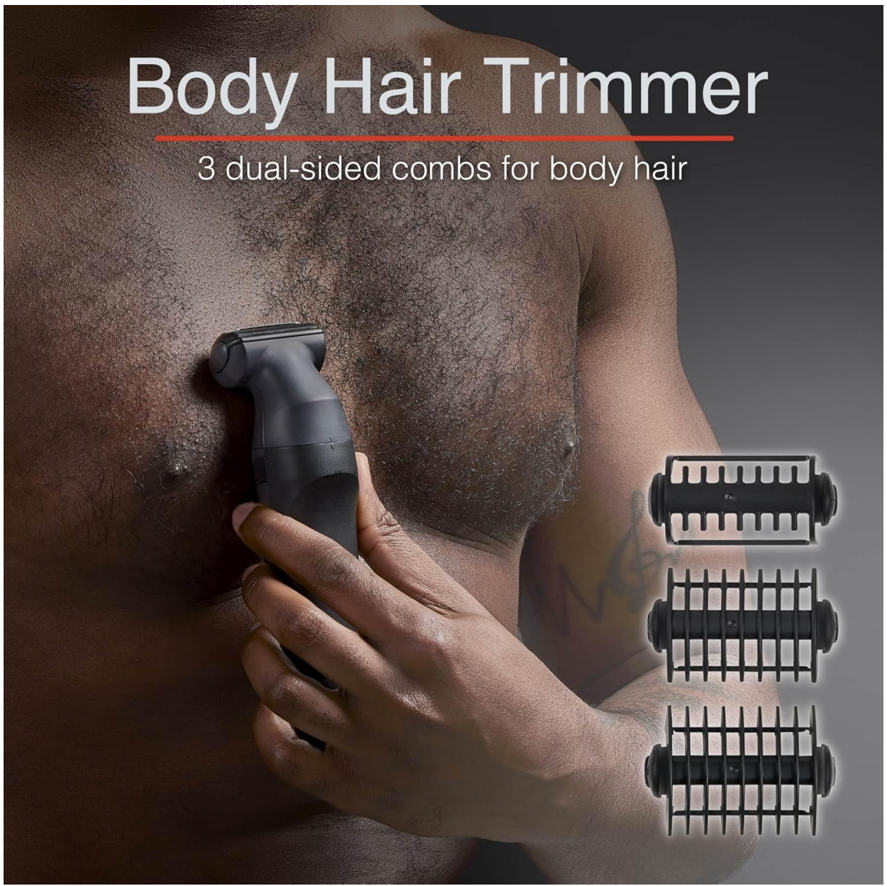
Image: A man using the body hair trimmer attachment on his chest, illustrating its application for body grooming.

Attach the body hair trimmer head. Use one of the three fixed combs (1mm, 3mm, 5mm) for comfortable trimming. Stretch the skin and trim slowly with light pressure, moving against the direction of hair growth.