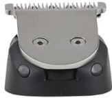
Wide T-Blade Attachment