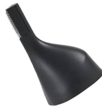
Nose & Ear Attachment

Image: A detailed diagram labeling each attachment: Wide T-Blade Attachment, 1mm Body Shaver Comb, Adjustable Comb (1mm-5mm), 3mm Body Shaver Comb, Body Shaver Attachment, 5mm Body Shaver Comb, Dual-Sided Nose & Ear Comb, and Nose & Ear Attachment.