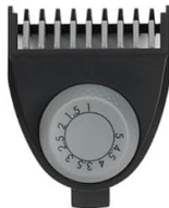
Adjustable Comb (1mm-5mm)