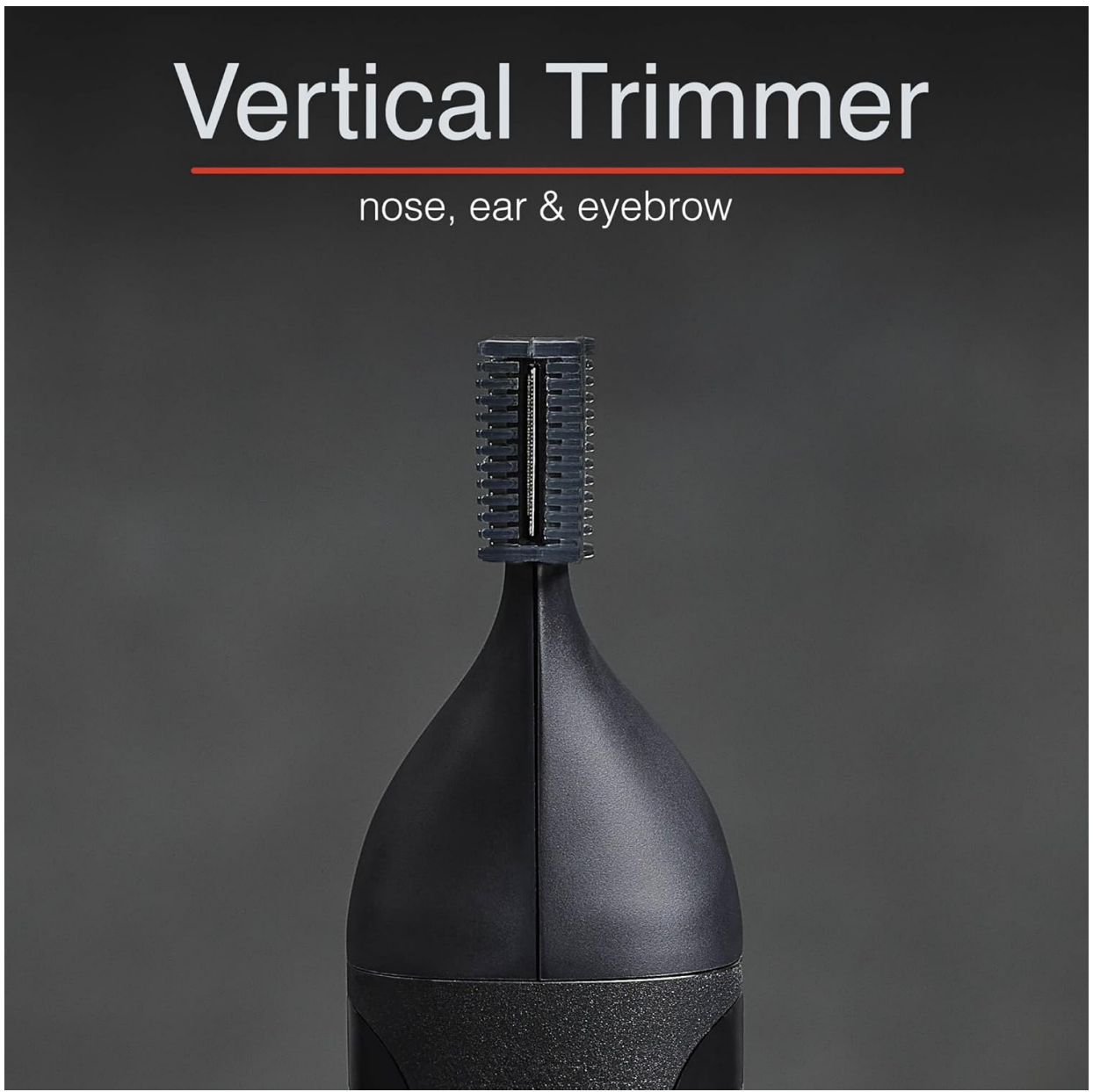
Image: A close-up view of the vertical trimmer head, designed for safely trimming nose, ear, and eyebrow hairs.

Attach the vertical trimmer head. Gently insert the trimmer into the nostril or ear canal, or carefully guide it over eyebrows to remove unwanted hair. Use the dual-sided comb for eyebrow shaping if desired.