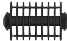
3mm Body Shaver Comb