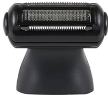
Body Shaver Attachment