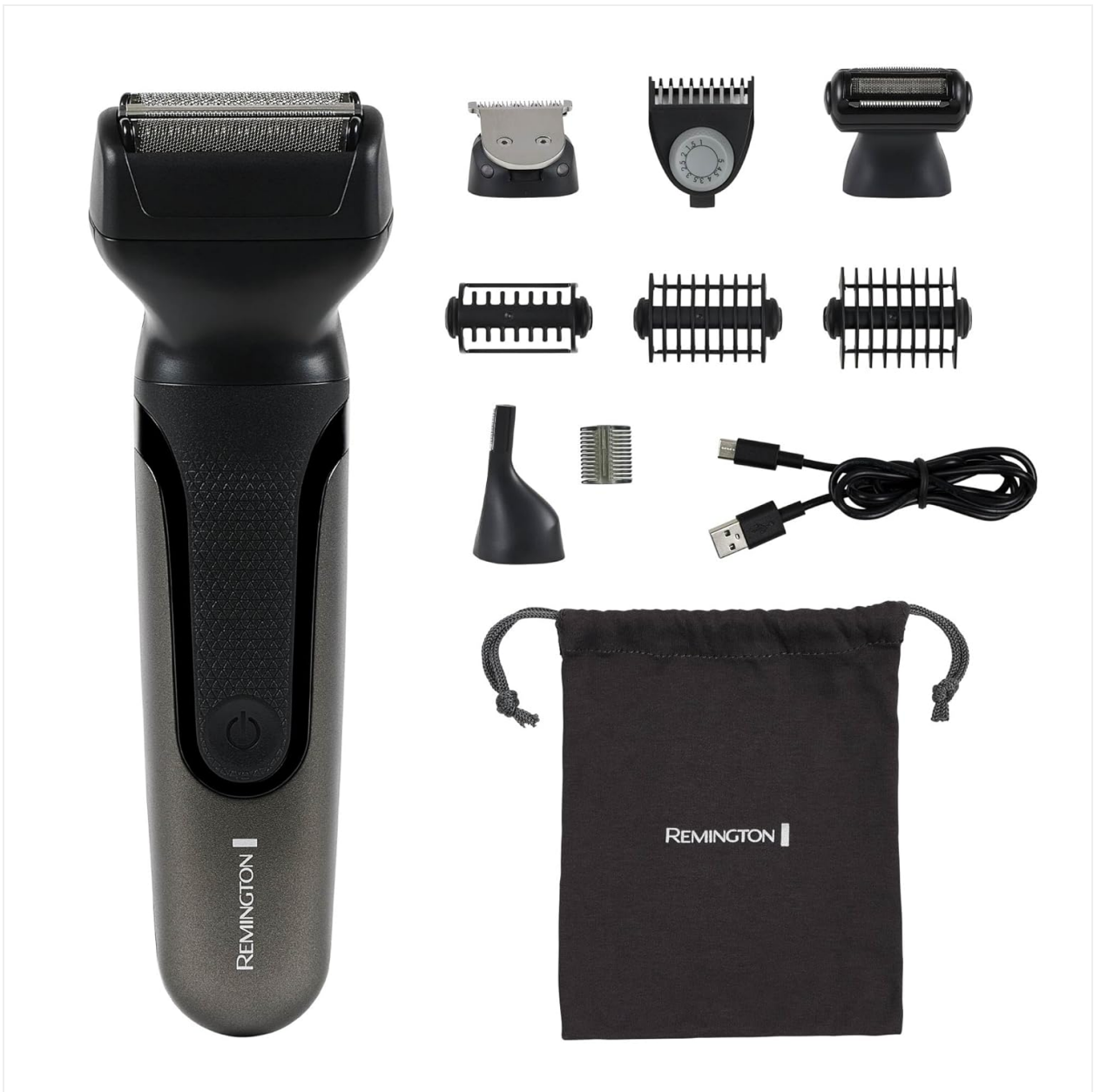
Image: The Remington ONE Multi-Tool handle displayed with its full set of attachments, including the foil shaver, T-blade trimmer, body hair trimmer, nose/ear/eyebrow trimmer, various combs, charging cable, and a travel pouch.