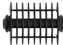
5mm Body Shaver Comb